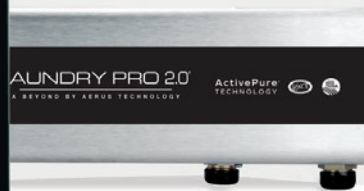
Laundry Pro 2.0