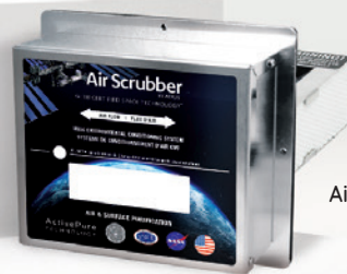
Air Scrubber by Aerus