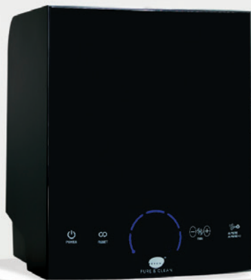
Aerus Pure & Clean