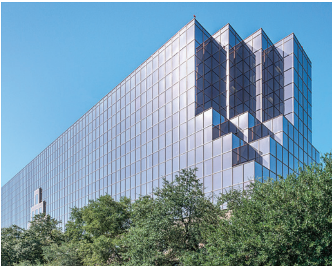
AERUS CORPORATE HEADQUARTERS | DALLAS, TX