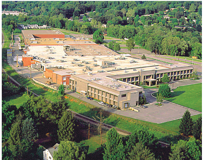
AERUS MANUFACTURING PLANT | BRISTOL, VA

AES | AERUS ENTERPRISE SOLUTIONS www.airscrubberbyaerus.com