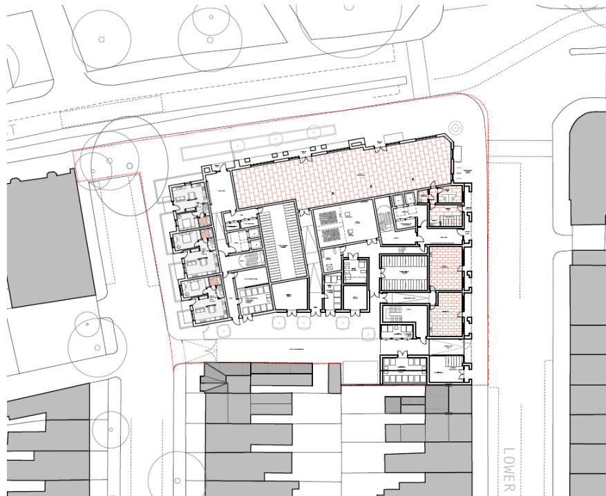
Figure 3: Proposed site plan.