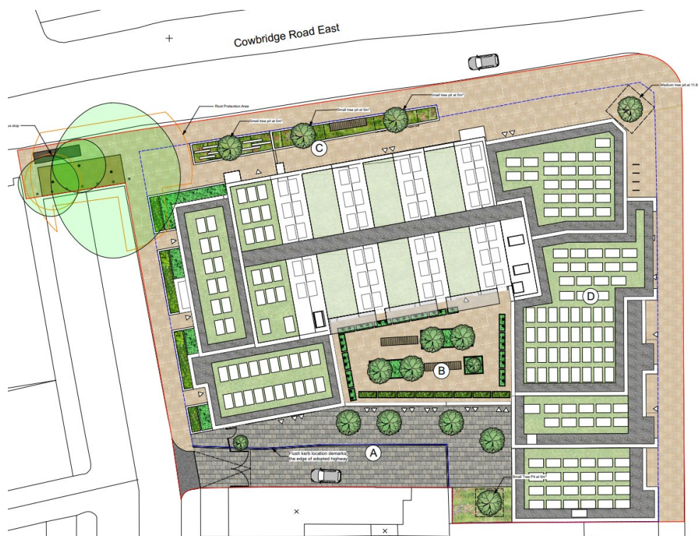
Figure 6: Proposed landscape masterplan.