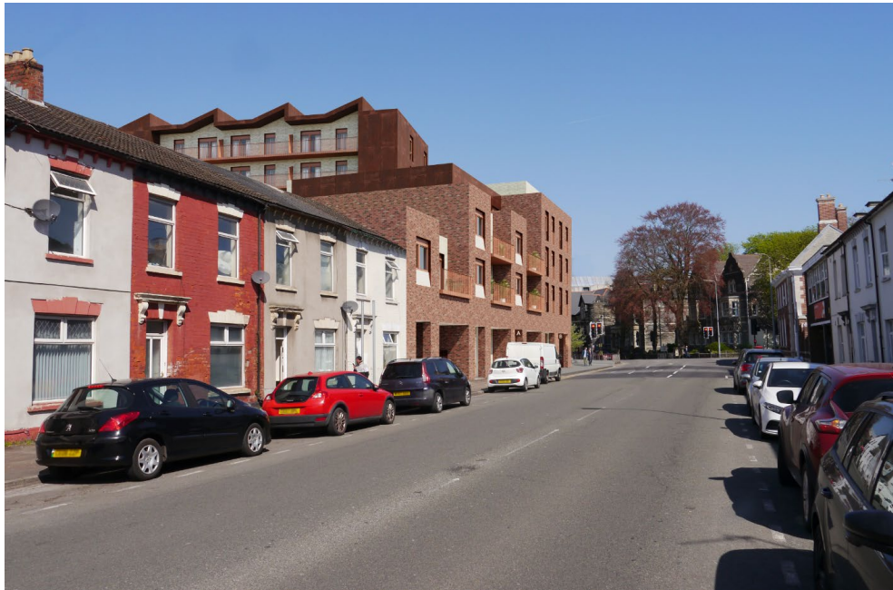
View 3: Facing north along Lower Cathedral Road: