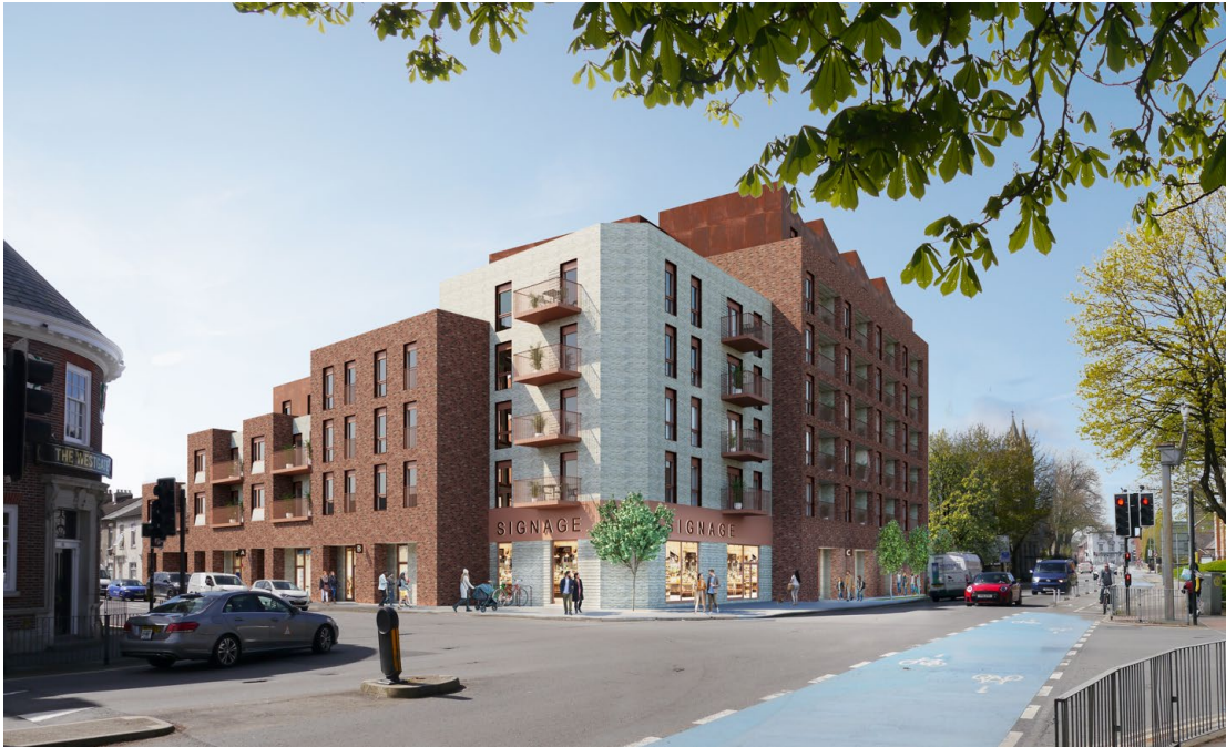
Figure 5: Artist impression facing west from Cowbridge Road East.