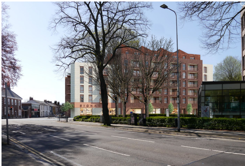
View 4: Facing south along Cathedral Road: