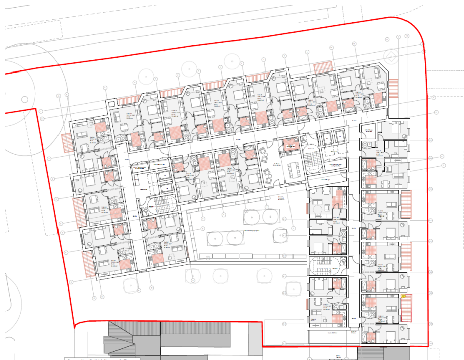
Figure 4: Proposed first floor plan with communal external amenity space lying centrally.