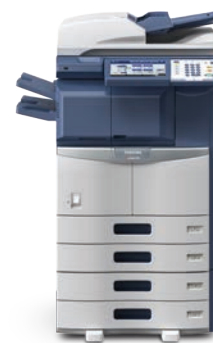
e-STUDIO356 with 50-Sheet Inner Finisher and Hole Punch.