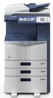
e-STUDIO356 with 2,000-Sheet LCF.