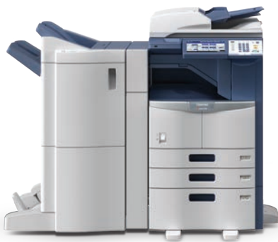
e-STUDIO506 with 2,000-Sheet LCF, Hole Punch, and Saddle-Stitch Finisher.