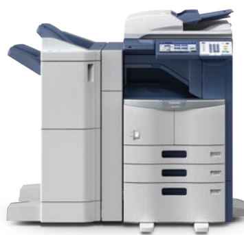
e-STUDIO456 with 2,000-Sheet LCF, Hole Punch, and 50-Sheet Staple Console Finisher.