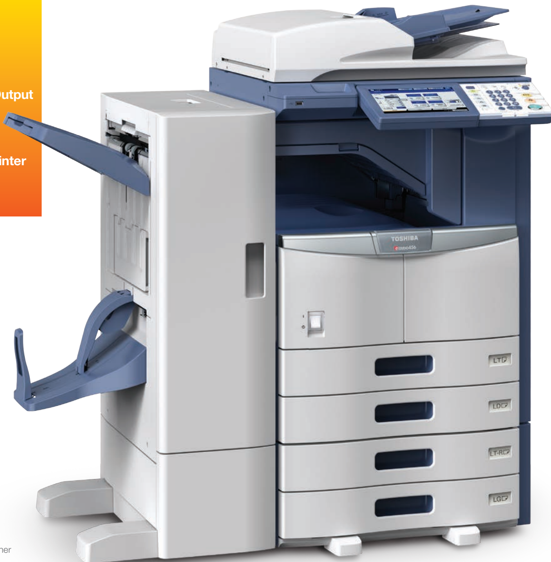
e-STUDIO456 with Saddle-Stitch Finisher