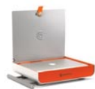
Griffin Multidock 2 Charge/SyncTrolley 30 GA38828