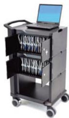
Ergotron Tablet Management Cart 32 24-376-085