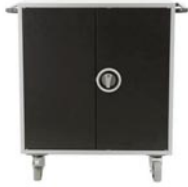
Leba iCart Mini Lite 15 3201-LEBA