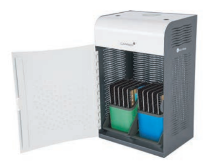
Carrier 10 Charging Station™

Specifications and images are for illustration purposes only. Final product may differ.