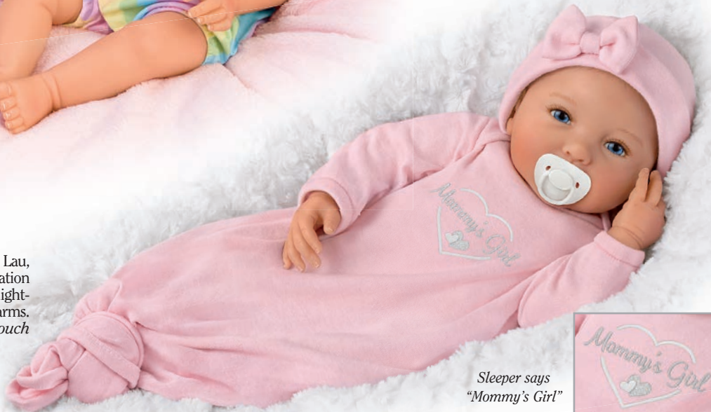
Sleeper says "Mommy's Girl"

Created by Master Doll Artist Ping Lau, Mommy's Girl is an adorable celebration of love. And her beanbag body is lightly weighted to feel real in your arms. Includes magnetic pacifier. RealTouch vinyl with weighted beanbag body. 17". 6+ Item #03-02966-001: $99.99 (plus $10.99 s+s) Four easy installments of $27.75