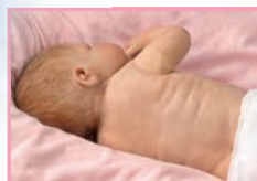
Full vinyl with a cloth body underneath for ease in posing