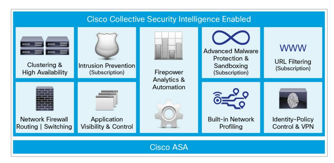
Figure 1. Cisco ASA with FirePOWER Services: Key Security Features