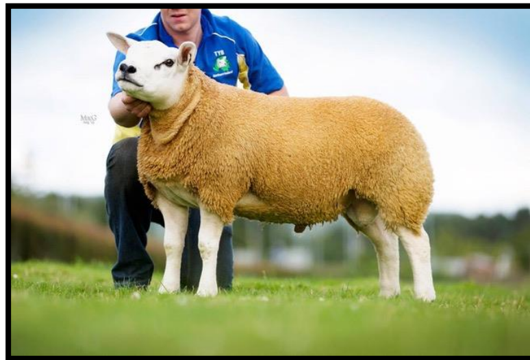
(Limestone Buccaneer : Reserve Champion Ashbourne Show)