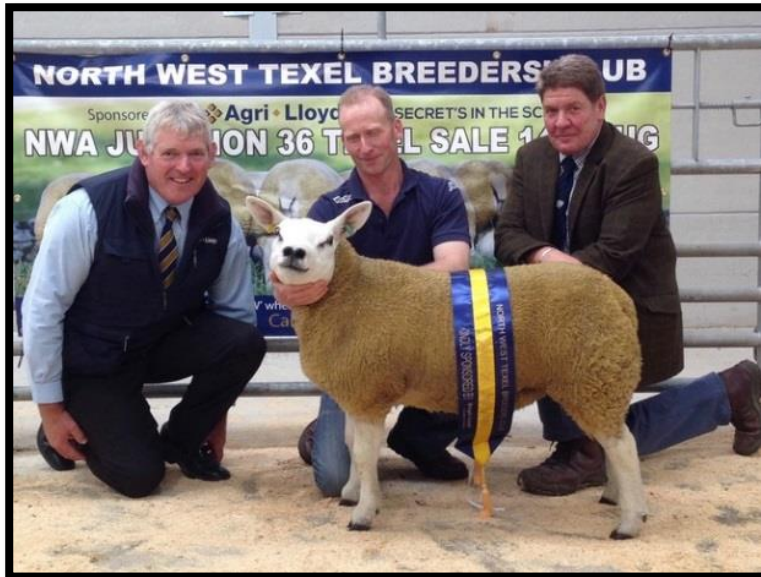
(NWTBC Ewe Lamb Champion 2016 – Limestone Yasmin WFL 1600177)

Sire: KILLYVOLGAN WHIZZ KID RRY1500033(E) by GLENSIDE VALHALLA FPG1400768(E) Dam: WFL1200091(3) by STRATHBOGIE SENATOR IJS1100021(E) GDam: WFL1000024(4) by TOPHILL PLAYBOY HPH091191(2) GGDam: NTA07360(2) by ALWENT MAJOR FORCE NTA06007(2) Service Sire: CHERRYVALE BFR by KNOCK YAZOO HAK1601044(3) Service Details: Served 04/10/2018 This animal has had embryos collected from it. Ref. Bye-Law 9.9. Remarks: NWTBC 2016 Champion Ewe Lamb. From our best female line, breeding exceptionally well. Prize winning sons to 12,000gns.