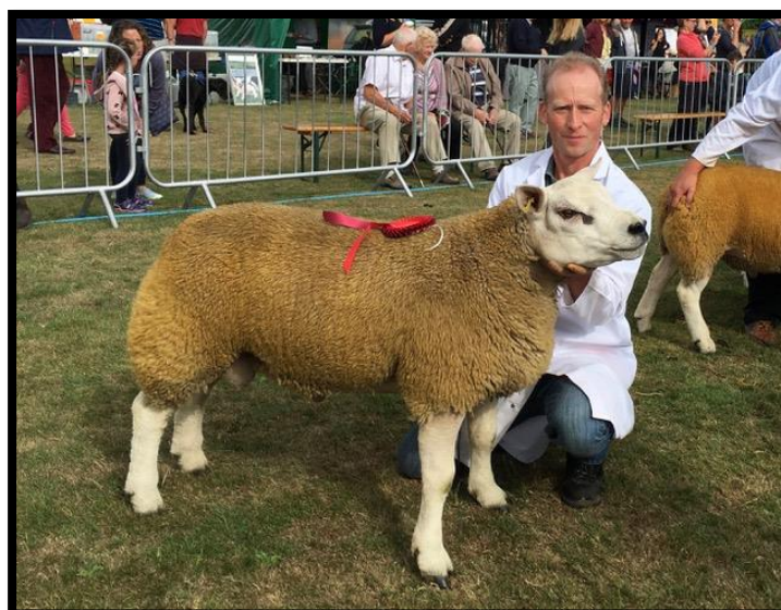
(Killyvolgan Whizzkid – First Prize Novice Ram Lamb at Lanark. 2015/16 Stock Tup and sire of ewes.)

Sire: KILLYVOLGAN WHIZZ KID RRY1500033(E) by GLENSIDE VALHALLA FPG1400768(E) Dam: WFL1400132(2) by CAMBWELL STEWART LTC1100528(E) GDam: WFL1200085(2) by MITCHELLHILL SUNDANCE KJM1100105(1) GGDam: LTC093644(2) by LLANGWM NUT CRACKER JLI07005(E) Service Sire: CORRIECRAVIE BLUE MOON by COWAL YOU'RE A RASCAL CKC1607638(E) Service Details: Served 14/09/2018