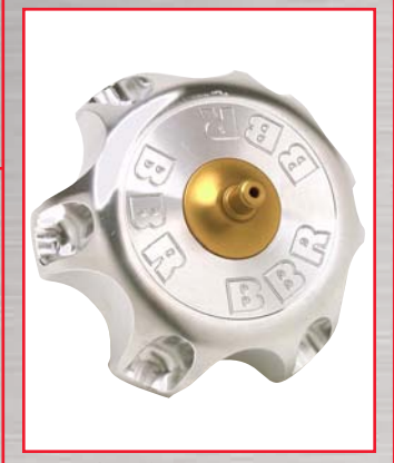
BBR Gas Cap 110-HCR-1201 $69.95

Complete exhaust system from the headpipe to the tailsection. Comes with a removable USDA Forest Service approved spark arrester installed. Ceramic coated, stepped header for power gains through-out the RPM range. Accepts OEM Honda endcap from CRF150/230F for super quiet sound output!