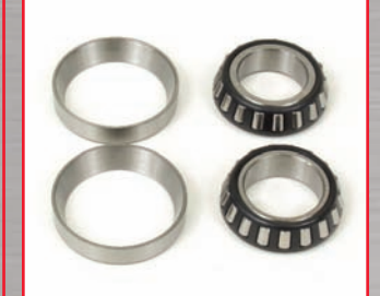
BBR Tapered Steering Bearing Set