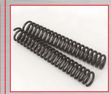
XR50 Heavy Duty Fork Springs