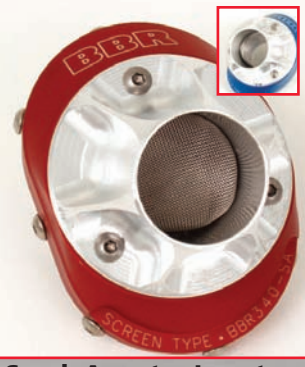
Spark Arrester Inserts 215-HCF-4511 CRF450R (02-04) $149.95

49.95 215-YZF-2511 Y2250 F 01-03 $149.95 215-YZF-4011 YZ400/426F 98-02 $149.95 215-YZF-4511 YZ450 F 03 $149.95