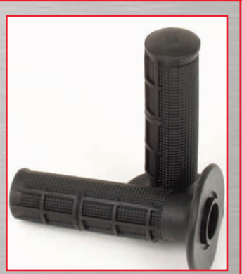
BBR handlebar Grips 500-BBR-1001 $9.95

110-YYZ-1202 Stamped "Z" YZ 02 YZ 125/250 (02), YZ85(02)