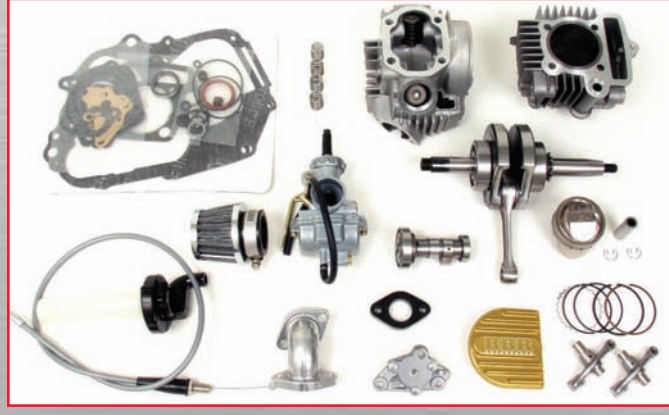
110cc Super Pro Stroker Kit

411-HXR-5300 110 Kit $1295.95 Big valve head, stroker crank, 24mm carb. Everything included for easy installation.