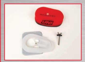
Free Flow Filter Kit 430-YTR-1201 Kit $79.95 Replacement filter $24.95