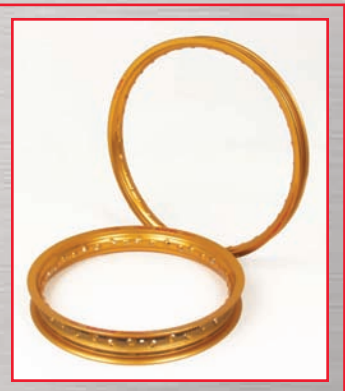
Aluminum Rims 16"/19"

390-YTR-1205 Gold $249.95 390-YTR-1206 Black $249.95 390-YTR-1207 Silver $249.95 These rims are lighter and stronger than stock rims. Fits 94-03 XR100.