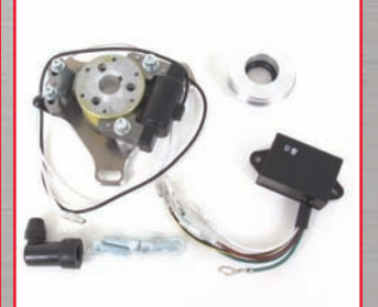
Inner Rotor Ignition 450-HXR-1001 $329.95