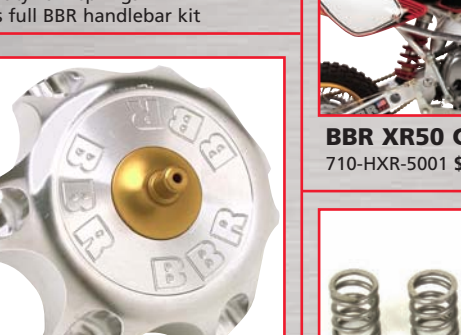
Billet Gas Cap 110-HCR-1201 $69.95