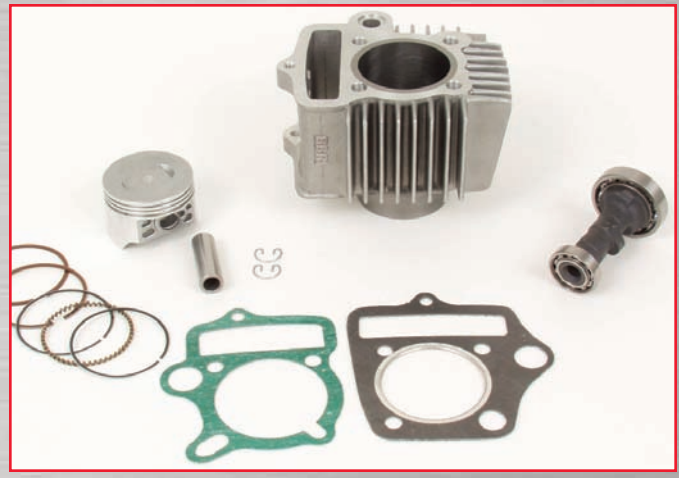
82cc Big Bore Kit with Cam

411-HXR-5001 Big Bore Kit $349.95 FFATURES>: