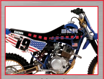
BBR Graphics Kit 710-YTR-1201 $129.95