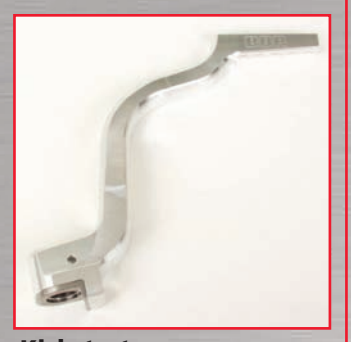
Kickstarters 130-YYZ-2501 YZ250 '96-01, YZ400/426F 1" short 98-02 $169.95

49.95 215-YZF-2511 Y2250 F 01-03 $149.95 215-YZF-4011 YZ400/426F 98-02 $149.95 215-YZF-4511 YZ450 F 03 $149.95