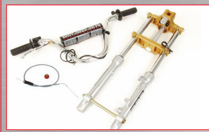
XR50 Fork Kit

630-HXR-5003 Fork Kit $599.95 630-HXR-5004 minus bar kit $519.95