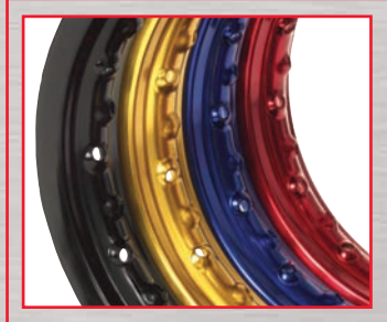
XR50 Aluminum Rims $199.95 (pair)

390-HXR-5001 Gold 390-HXR-5002 Black 390-HXR-5003 Red 390-HXR-5004 Blue