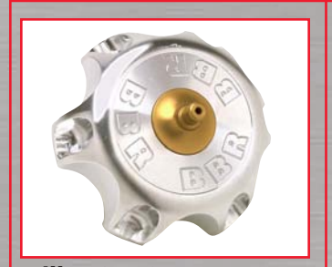
Billet Gas Cap 110-HCR-1201 $69.95