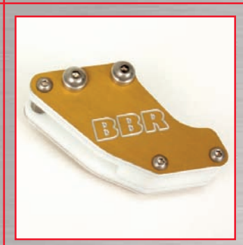
Chain Guides 340-HXR-5001 $69.95

A must have! The only complete kit on the market. 510-HXR-5001 $229.95