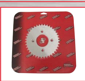
XR50 Rear Sprockets

Rev on past the stuck 9800 RPM limit. 451-HXR-5001 $59.95