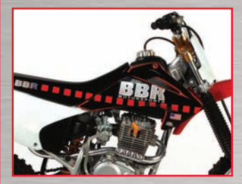
BBR Graphics Kit 710-HCF-1501 $129.95