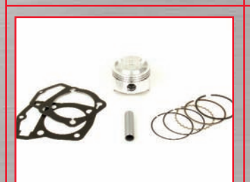
CRF 170 Big Bore Kit 410-HCF-1503 $169.95