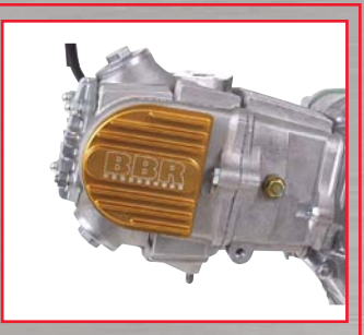
BBR XR50 Cam Cover 405-HXR-5001 $49.95

Comes with a removable USDA Forest Service approved spark arrester installed. Ceramic coated, tapered header for power gains through-out the RPM range. Also accepts stock endcap for stock level sound output!