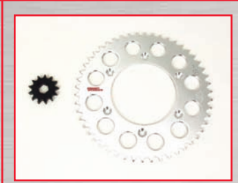
CRF 428 Sprockets Call for info.