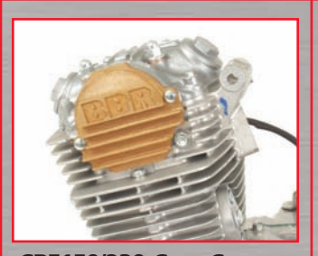
CRF150/230 Cam Cover 405-HCF-1501 $59.95

Includes frame, motor mounts, brake pedal, footpeg mounts, plastic gas tank, air-boot, exhaust system, radiator wings, graphics kit & seat cover, and BBR gascap. Uses chassis components from 1996-2003 Honda CR80/85 or CR80/85 Expert. Complete with MSO paperwork.