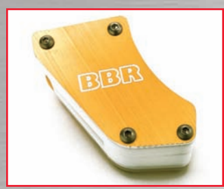
Chain Guide 340-HXR-1001 $69.95