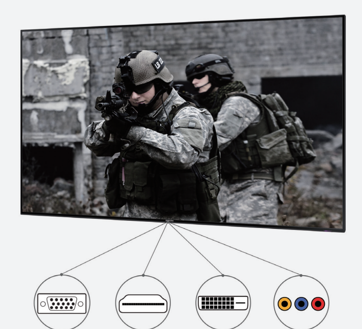
Figure 1. Flexibility of source device compatibility with expansive connectivity options