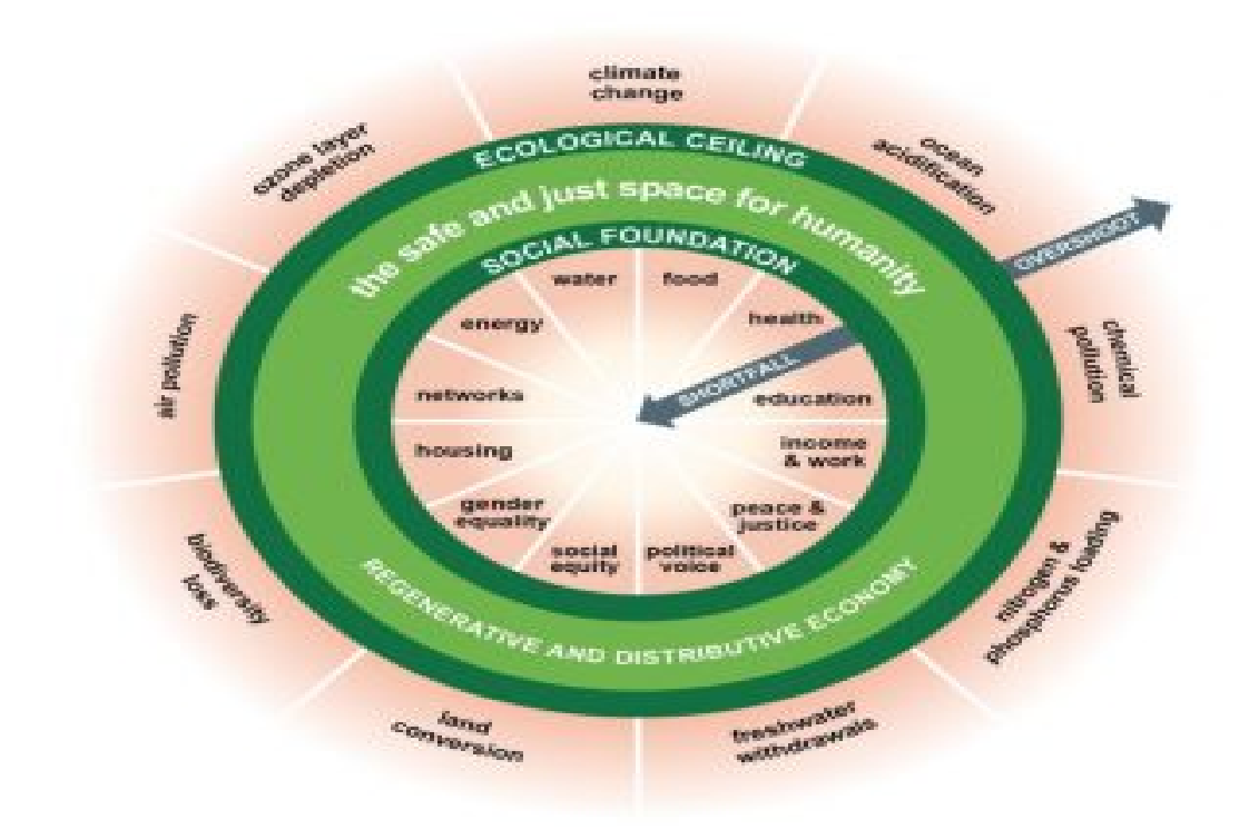
Figure 2: The Doughnut of social and planetary boundaries (2017)

In this model, the two key features consist of an outer environmental ceiling of nine planetary boundaries, as described above, beyond which lie unacceptable environmental degradation and potential tipping points in Earth systems. We must not surpass this ceiling. The inner social foundation of the model is formed from twelve dimensions derived from internationally agreed minimum social standards, as identified by the world's governments in the Sustainable Development Goals in 2015. It is suggested that society should be structured such that no-one falls below this social foundation. The space between the social and planetary boundaries is an environmentally safe and socially just space in which humanity can thrive.