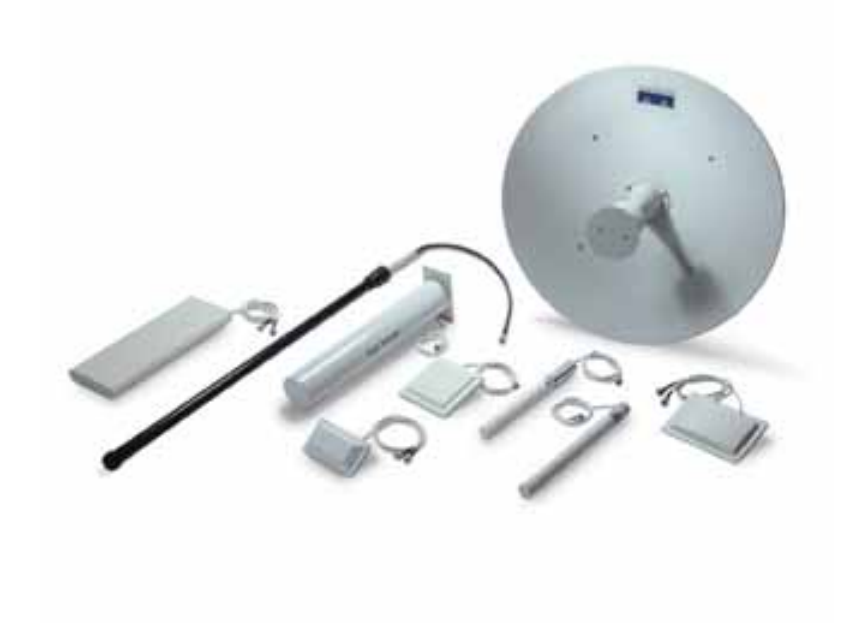
Figure 1 Cisco offers a complete range of antennas for client adapter, access point, and bridge equipment that enable a customized wireless solution for almost any installation.

Cisco is committed to providing not only the best access points, client adapters, and bridges in the industry—it is also committed to providing a complete solution for any wireless LAN deployment. That's why Cisco has the widest range of antennas, cable, and accessories available from any wireless manufacturer.