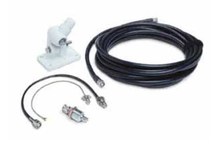
Table 5 Cisco Aironet Accessory Features

To complete an installation, Cisco provides a variety of accessories that offer increased functionality, safety, and convenience. (See Table 5.)