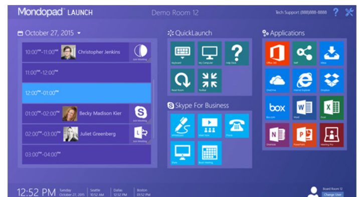
QuickLaunch Professional Edition

Montage, from DisplayNote, offers simple but powerful casting so that you can easily share content wirelessly from your laptop or mobile device. Montage allows up to six people to cast content simultaneously. The main user at the screen can choose which user to show as the active screen, and other users can then annotate from their personal device on to the casted image for all to see.