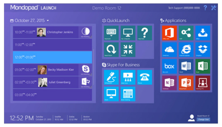
QuickLaunch Professional Edition

Montage, from DisplayNote, offers simple but powerful casting so that you can easily share content wirelessly from your laptop or mobile device. Montage allows up to six people to cast content simultaneously. The main user at the screen can choose which user to show as the active screen, and other users can then annotate from their personal device on to the casted image for all to see.