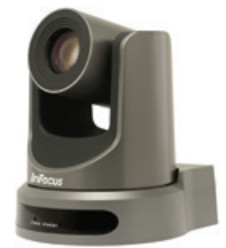
RealCam PTZ Camera

Thunder Speakerphone (INA-TH150): VoiceAware anti-echo & noise-reducing technology for any size meeting room