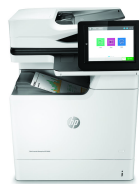
HP Color LaserJet Enterprise MFP M681dh