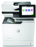
HP Color LaserJet Enterprise Flow MFP M681f

This HP Color LaserJet MFP with JetIntelligence combines exceptional performance and energy efficiency with professional-quality documents right when you need them—all while protecting your network with the industry's deepest security. 1