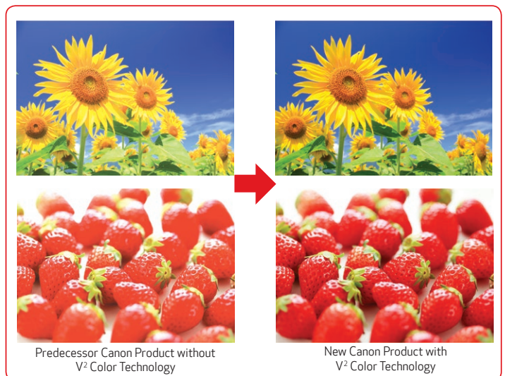
Predecessor Canon Product without V 2 Color Technology