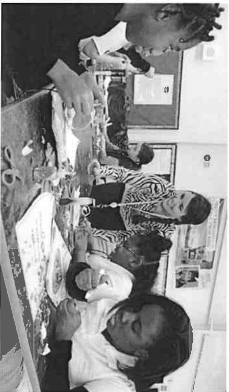
High-quality teaching is the most powerful tool for helping students reach high standards

The report has been prepared by the Finance Department following the requirements and guidelines prescribed by the Governmental Accounting Standards Board and recommended by the Government Financial Officers Association. We believe the data presented is accurate in all material respects and that it is presented in a manner designed to fairly reflect the financial position and results of operations of the District. All disclosures necessary to enable the reader to gain the maximum understanding of the District’s financial activity have been included.