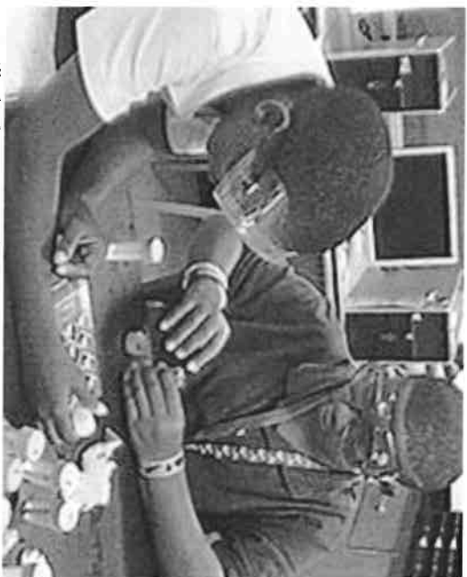
All schools are resourced and equipped to support student needs

Program provides a living education for the whole child. Teachers use art, music, drama, movement, and experiences to deliver the curriculum. Students are empowered to think creatively and critically, understand and manage emotions, and work in a focused and willing manner. These students will integrate art into the curriculum, play with social intent, and focus on relationships, nutrition, and environmental sustainability.