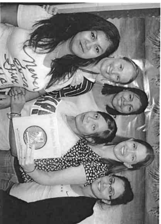
Enriched student educational experiences

create a framework to improve teaching and learning. There are three strands of this ambitious partnership: transforming teaching and learning; transforming secondary schools to better serve students and their families; and transforming business and community engagement.