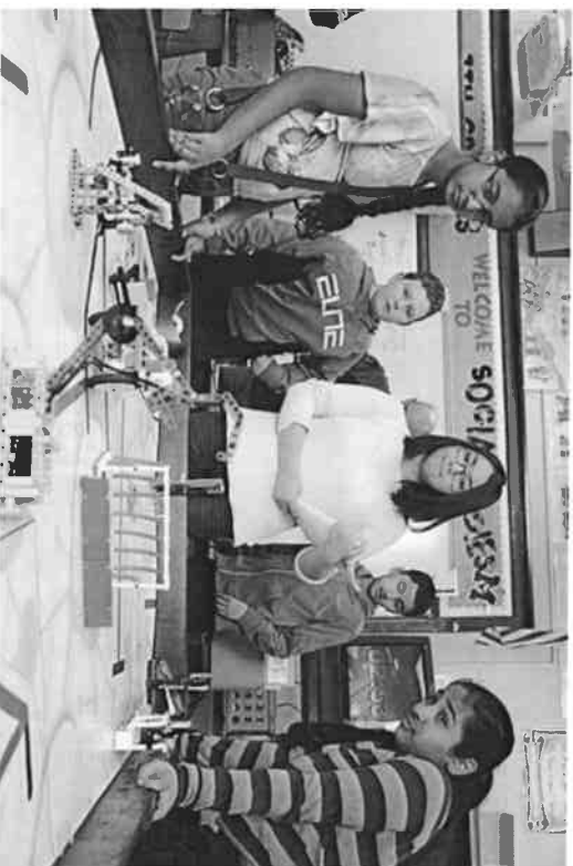
Talents and resources used wisely to benefit students