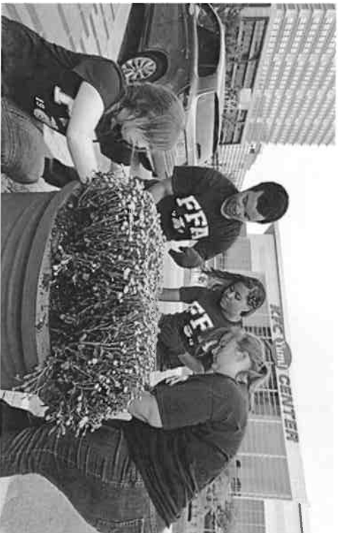
Community-based experiences to support student learning