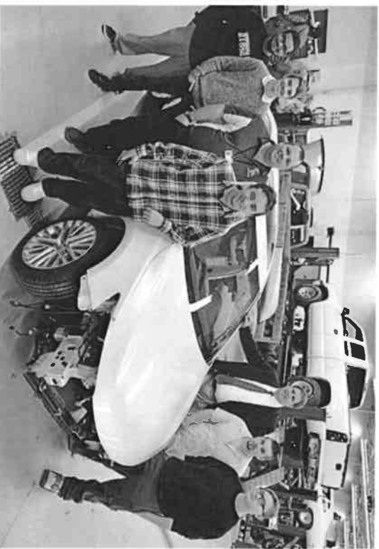
Students graduate prepared for college or career

pay for its disbursements and staff review bank information daily. Accordingly, the bank accounts are reconciled by the third day after the end of the month. Schools are audited every year. We maintain an anonymous fraud hotline to safeguard our assets. Currently, we are tightening segregation of duties and internal controls at satellite offices.