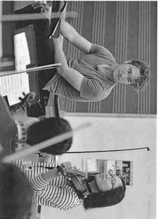
Adults model integrity, respect, creativity, and accountability.