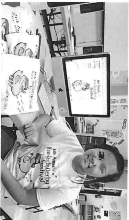
Instruction that inspires!

Through the resulting emphasis on data-driven educational accountability, Kentucky has gained a reputation as a cutting edge educational system focusing on accountability. The District, as well, has many years of assessment data. We continuously review our curriculum and initiatives to ensure Jefferson County children are being educated to the height of their ability.