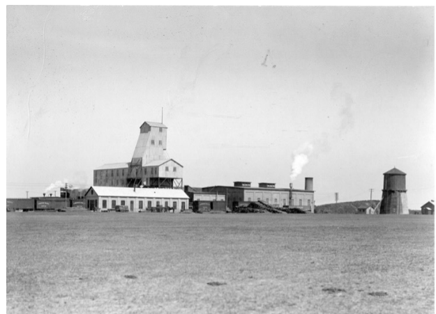
The Galt Number 6 mine in Hardieville was the main employer of Okinawans until its closure in 1935.