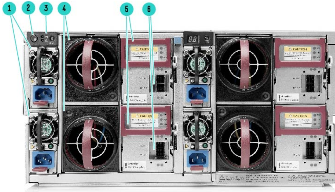
HPE D6020 Disk Enclosure -Rear View