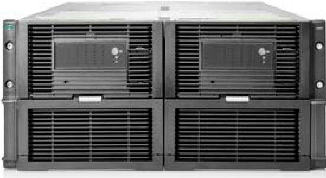
HPE D6020 Disk Enclosure –Front View

The HPE Apollo A4520 supports six (6) D6020 enclosures per A4520 (3 per node).