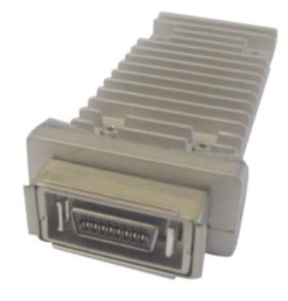
Figure 9. Cisco 10-Gbps Fibre Channel CX4 X2 Transceiver (Part Number DS-X2-FC10G-CX4)