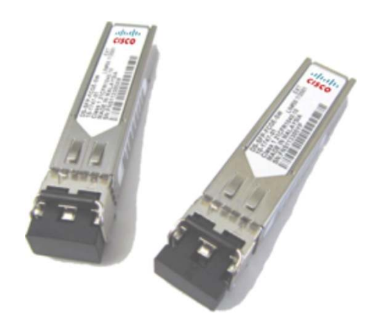
Figure 2. Cisco 4-Gbps Fibre Channel SFPs