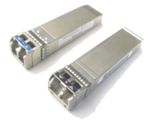
Figure 3. Cisco 8-Gbps Fibre Channel SFP+

The Cisco 8-Gbps Fibre Channel SFP+ (Figure 3) is designed to provide Fibre Channel connectivity for the 2/4/8-Gbps ports on the Cisco MDS 9000 Family platform. Three types of Cisco 8-Gbps Fibre Channel SFP+ are available: the Cisco Fibre Channel Shortwave SFP+ (part number DS-SFP-FC8G-SW) the Cisco Fibre Channel Longwave SFP+ (part number DS-SFP-FC8G-LW), and the Cisco Fibre Channel Extended Reach SFP+ (part number DS-SFP-FC8G-ER). Each product offers 2/4/8-Gbps autosensing Fibre Channel connectivity.