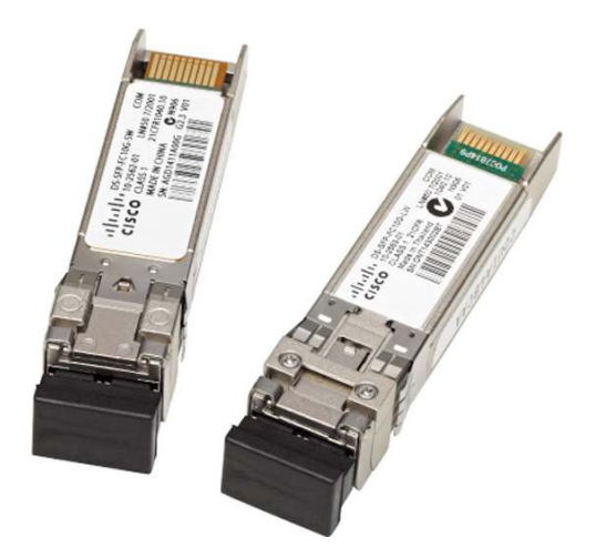
Figure 4. Cisco 10-Gbps Fibre Channel SFP+

The Cisco 10-Gbps Fibre Channel SFP+ (Figure 4) is designed to provide Fibre Channel connectivity for the 10-Gbps Fibre Channel ports on the Cisco MDS 9000 Family platform. Two types of Cisco 10-Gbps Fibre Channel SFP+ are available: the Cisco Fibre Channel Shortwave SFP+ (part number DS-SFP-FC10G-SW) and the Cisco Fibre Channel Longwave SFP+ (part number DS-SFP-FC10G-LW).