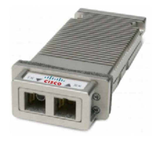
Figure 11. Cisco 10-Gbps Ethernet X2 Transceiver

The Cisco Ethernet X2 Transceiver Short Reach (up to 300m; part number DS-X2-E10G-SR) enables highperformance Fibre Channel connectivity for the Cisco MDS 9000 family 10-Gbps Fibre Channel switching module to an existing Ethernet Dense Wavelength-Division Multiplexing (DWDM) transponder (Figure 11). The data format transmitted by the Ethernet X2 transceiver (DS-X2-E10G-SR) onto the fiber is identical to that transmitted by the Fibre Channel transceiver (DS-X2-FC10G-SR), except that the Fibre Channel packets are clocked at the 10 gigabit Ethernet rate, which allows Fibre Channel packets to be carried over an existing 10-Gbps Ethernet DWDM infrastructure. The Cisco MDS 9000 family 10-Gbps Fibre Channel switching module will automatically detect DS-X2-E10G-SR; no software configuration is required.