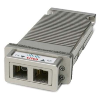
Figure 8. Cisco 10-Gbps Fibre Channel X2 Transceiver (Part Numbers DS-X2-FC10G-SR, DS-X2-FC10G-LR, and DS-X2-FC10G-ER)

The Cisco Fibre Channel X2 transceivers are designed to provide high-performance Fibre Channel connectivity for the 10-Gbps Fibre Channel ports on the Cisco MDS 9000 family platform. There are three types of Cisco 10-Gbps Fibre Channel X2 transceivers for transmission on optical cables: Cisco Short Reach (up to 300m; part number DS-X2-FC10G-SR), Cisco Long Reach (up to 10 km; part number DS-X2-FC10G-LR), and Cisco Extended Reach (up to 40 km; part number DS-X2-FC10G-ER) (Figure 8). There is also a 10-Gbps Fibre Channel X2 transceiver for transmission on copper cable (up to 15m; part number DS-X2-FC10G-CX4) (Figure 9). Each product offers 10-Gbps Fibre Channel connectivity.