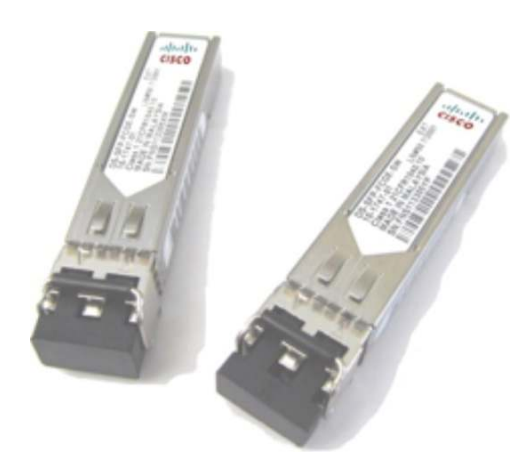
Figure 1. Cisco 2-Gbps Fibre Channel SFPs

The Cisco 2-Gbps Fibre Channel SFPs (Figure 1) are designed to provide cost-effective Fibre Channel connectivity for the Cisco MDS 9000 Fibre Channel switching modules. Two types of Cisco 2-Gbps Fibre Channel SFP are available: the Cisco Fibre Channel Shortwave SFP (part number DS-SFP-FC-2G-SW) and the Cisco Fibre Channel Longwave SFP (part number DS-SFP-FC-2G-LW). Each product offers 1/2-Gbps autosensing Fibre Channel connectivity.