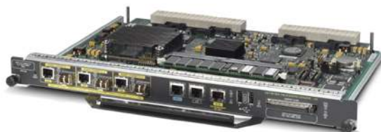
Table 1. Features and Benefits Overview