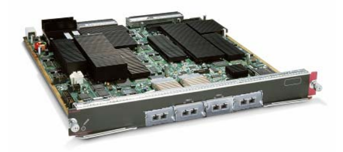
Figure 1. Cisco Catalyst 6500 Series CEF720 4-port 10 Gigabit Ethernet Module (WS-X6704-10GE) and installed XENPAKs

Cisco's premier modular multilayer switch, the Cisco<sup>®</sup> Catalyst<sup>®</sup> 6500 Series delivers secure, converged services from the access layer to the core, to the data center, to the WAN edge.