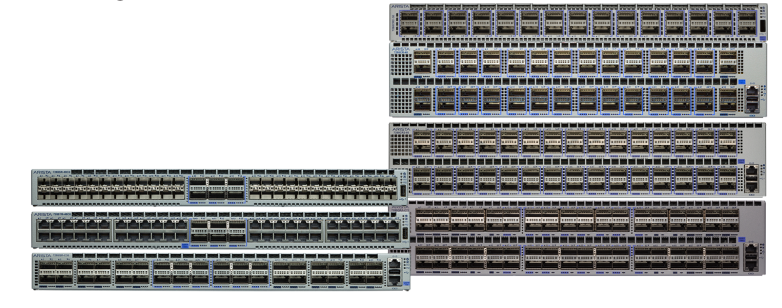
Arista 7280R Series

7280R support for 100GbE QSFP incorporates a flexible choice of interface speed including 25GbE and 50GbE providing unparalleled flexibility and the ability to seamlessly transition data centers to the next generation of Ethernet performance. The 7280R Series provide industry leading power efficiency with airflow choices for back to front, or front to back. An optional built-in SSD supports advanced logging, data captures and other services directly on the switch. Combined with Arista EOS the 7280R Series delivers advanced features for big data, cloud, virtualized and traditional designs.