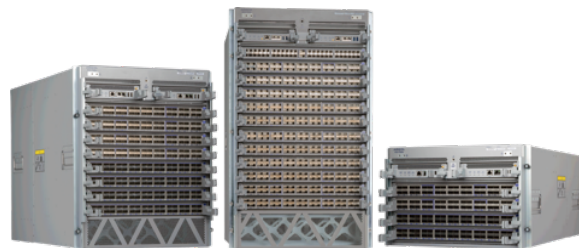
Arista 7500R3 Series Modular Data Center Switches

All components are hot swappable, with redundant supervisor, power, fabric and cooling modules with front-to-rear airflow. The system is purpose built for data centers and is energy efficient with typical power consumption of under 25 watts per 100G port for a fully configured chassis. These attributes make the Arista 7500R3 an ideal platform for building reliable and highly scalable data center networks.