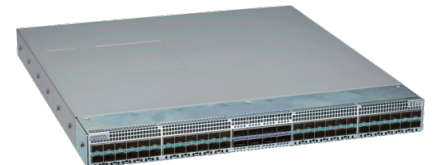
Arista 7050SX3-48YC8: 48x 25G SFP and 8x 100G QSFP ports

The Arista 7050SX3-48YC8 is a 1RU system with 48 ports of 25G SFP and 8 ports of 100G QSFP with an overall throughput of 4Tbps. The high density SFP ports can be configured to run either at 25G or a mix of 10G/1G speeds. The QSFP ports allow for 100GbE or 40GbE as high speed network uplinks, with a wide choice of transceivers and cables enabling a choice of combinations for both leaf and spine deployment. With low latency and no oversubscription, the switch is optimized for high performance server and storage deployments.