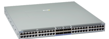
Arista 7050TX3-48C8: 48x 10GBaseT and 8x 100G QSFP ports

The Arista 7050SX3-48C8 and 7050TX3-48C8 are 1RU systems with 48 port of 10G and 8 ports of 100G with an overall throughput of 2.56Tbps. The SX3 high density 10G ports can be configured for a mix of 10G/1G speeds to facilitate mixed connections and the TX3 RJ45 ports allows both 1G and 10G speeds. The QSFP ports allow 100GbE or 40GbE as network uplinks, with a rich choice of transceivers and cables for both leaf and spine deployment. With no oversubscription, the switch is optimized for high performance deployments with consistent features.