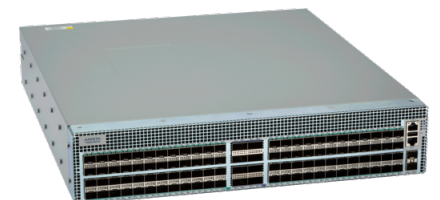
Arista 7050SX3-96YC8: 96x 25G SFP and 8x 100G QSFP ports

The Arista 7050SX3-96YC8 is a 2RU system with 96 ports of 25G and 8 ports of 100G with an overall throughput of 6.4Tbps bi-directional. The high density SFP ports can be configured in groups of 4 to run either at 25G or a mix of 10G/1G speeds. The QSFP ports allow for a choice of 5 speeds including 100GbE, 40GbE, 4x10GbE, 4x25GbE or 2x 50GbE with a wide choice of transceivers and cables enabling a choice of combinations for both leaf and spine deployment. With low latency and no oversubscription, the switch is optimized for high density server environments with native 25G connections.