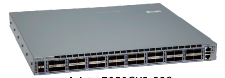
Arista 7050CX3-32S: 32x 100G QSFP100 ports, 2 SFP+ ports

The 7050CX3-32S is a 1RU system with 32 100G QSFP ports offering wire speed throughput of up to 6.4Tbps bi-directional. Each QSFP port supports a choice of 5 speeds with flexible configuration between 100GbE, 40GbE, 4x10GbE, 4x25GbE or 2x50GbE modes for up to 128 ports of 10GbE and 25GbE or 64 ports of 50GbE. All ports can operate in any supported mode without limitation, allowing easy migration from lower speeds and the flexibility for leaf or spine deployment.