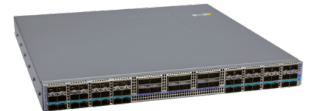
Arista 7050SX3-48YC12: 48x 25G SFP and 12x 100G QSFP ports

The Arista 7050SX3-48YC12 is a 1RU system with 48 ports of 25GbE SFP and 12 ports of 100GbE QSFP with an overall throughput of 4.8Tbps. The high density SFP ports can be configured in groups of 4 to run either at 25G or a mix of 10G/1G speeds. The QSFP ports allow for a choice of 5 speeds including 100GbE, 40GbE, 4x10GbE, 4x25GbE or 2x 50GbE with a wide choice of transceivers and cables enabling a choice of combinations for both leaf and spine deployment. With low latency and no oversubscription, the switch is optimized for high performance server and storage deployments.