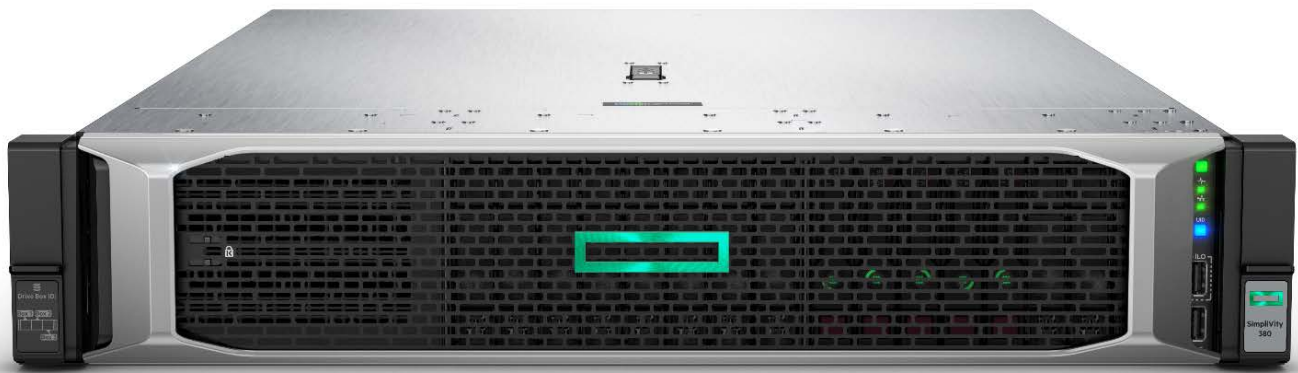
HPE SimpliVity 380 Gen10

HPE SimpliVity 380, based on the HPE ProLiant DL380 Gen10 Servers, is a compact, scalable, 2U rack-mounted building block that delivers integrated server, storage, and storage networking services. Adaptable for diverse virtualized workloads, the secure 2U HPE SimpliVity 380 Gen10 delivers world-class performance with the right balance of expandability and scalability. It also provides a complete set of advanced functionalities that enable dramatic improvements to the efficiency, management, protection, and performance—at a fraction of the cost and complexity of today’s traditional infrastructure stack.