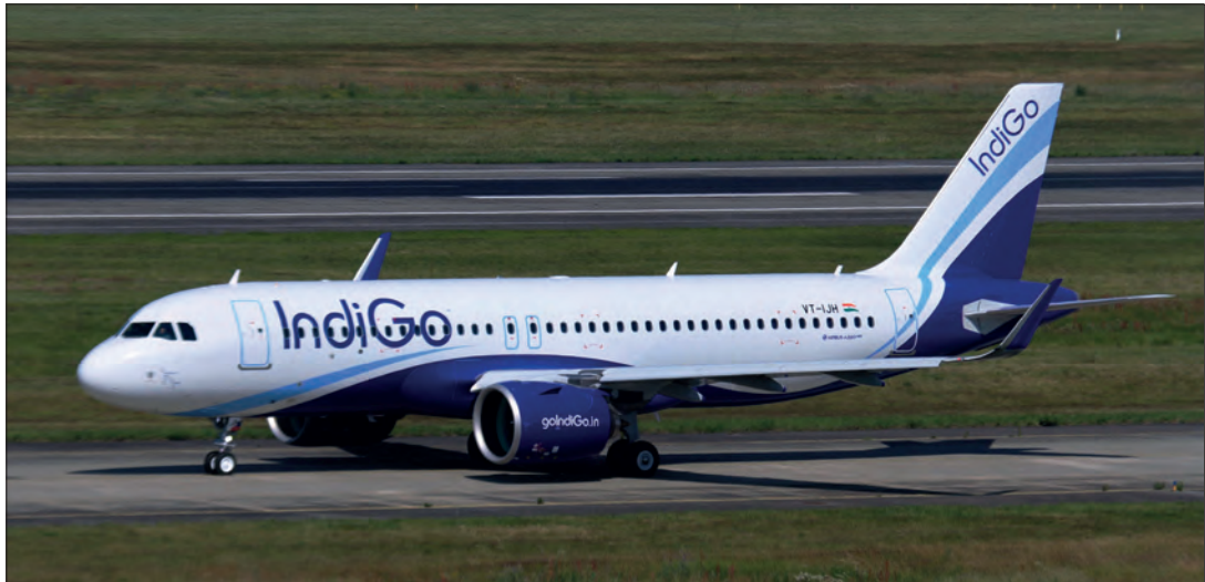
Airbus A320-271N VT-IJH (9031) of IndiGo at Toulouse on 18th June 2019, starting on its delivery flight. [Martin Uzzell]