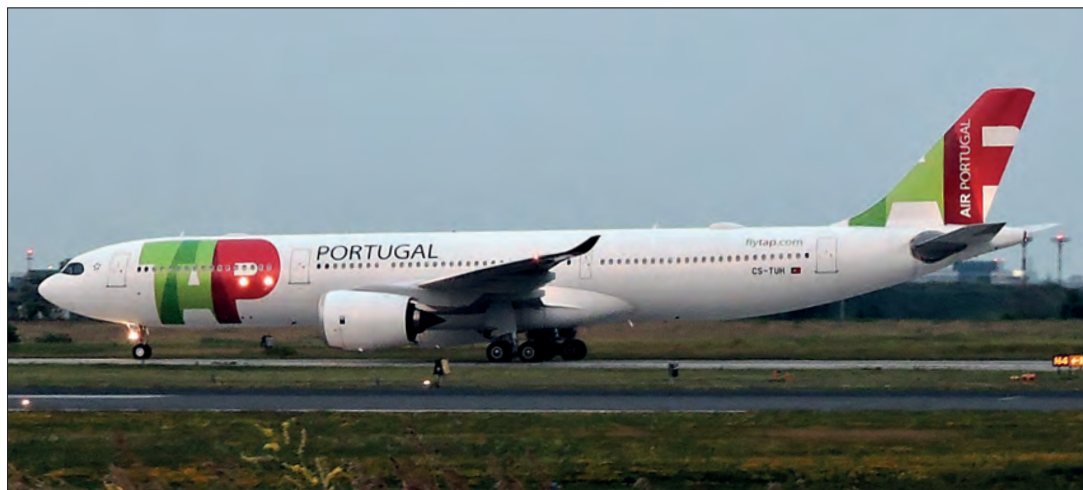
Airbus A330-900 CS-TUH (1906) of TAP Air Portugal at Toronto Pearson on 10th July 2019.