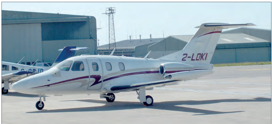
Eclipse 500 2-LOKI (000015) at Guernsey on 1st July 2019.

Eclipse-builder One Aviation has requested court approval to sell its assets in a bid to avoid going into liquidation.