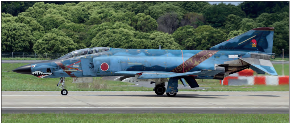
RF-4E Kai 47-6905 of JASDF/501 Hikotai, wearing special '1961 – 2020' markings celebrating the squadron's operations with F-86 and F-4 aircraft, at Hyakuri AB on 25th June 2019.