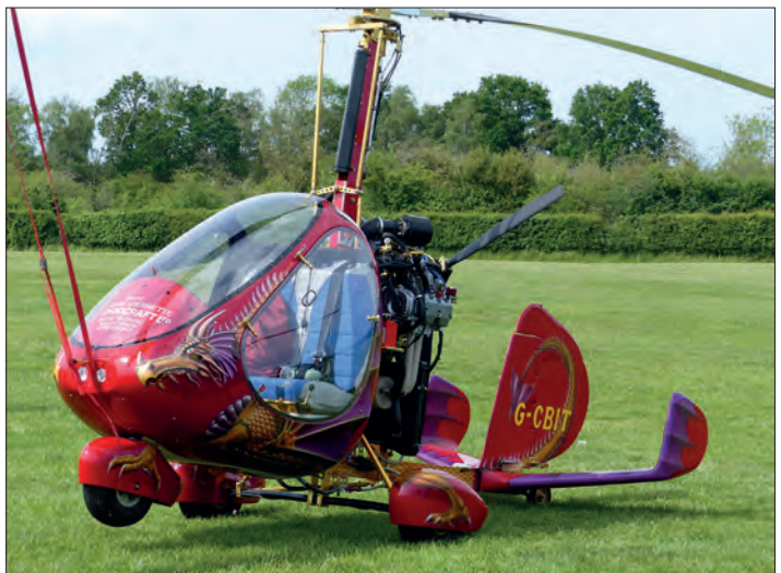
Rotary Air Force RAF 2000 GTX-SE G-CBIT (H2-01-12-521) at Old Warden on 25th May 2019.

Aero Commander 500: N3596T Alpi Pioneer 300 Hawk: G-ISBD Auster J/1N: G-AIGF Beech D17S Staggerwing: N17GL Boeing Stearman: N38940/18263 Bristell NG5 Speedwing: G-STUU Cessna F150J: G-AWUU Cessna F150L: G-GFLY Cessna F172H: G-AVHH, G-BEZX Cessna F172P: G-BIZF Diamond DA.40 Star: G-SUEO Europa XS: G-OWWW EV-97 Eurostar: G-CDAC Grumman-American AA-5B Tiger: G-ZERO Ikarus C-42: G-MSKY Jodel D.112: G-BVEH Jodel D.117: G-BFGK Jodel D.120: G-AYGG Luscombe 8F Silhouette: G-LUSK Nanchang CJ-6A: G-BXZB/CT180 Piper PA-22-108 Colt: G-ARNE Piper PA-28-140 Cherokee: G-LFSC Piper PA-32R-201 Saratoga SP: N51AH Pipistrel Virus: G-PIVI Pitts S-1S: G-WIGY