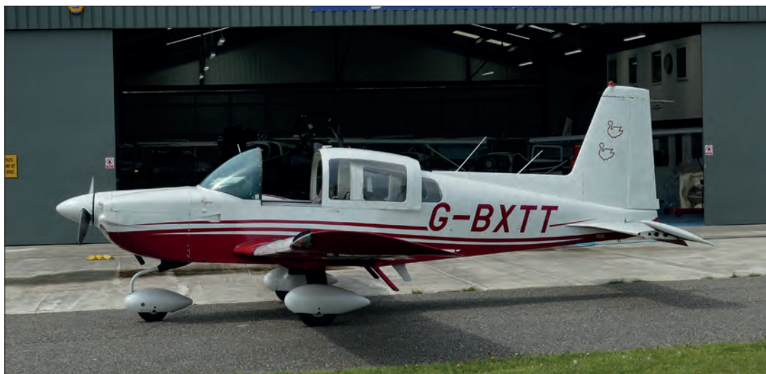
Grumman American AA-5B Tiger G-BXTT (AA5B-0749) at Dunkeswell on 7th May 2019, visiting from its French base.

DURHAM TEES VALLEY, CO. DURHAM – Eden Flight Training took delivery of Beech C23 G-BARH on 18th May. Aerospatiale AS365N2 G-NHAC