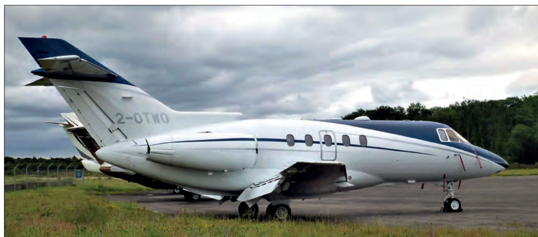
Hawker 800XP 2-OTWO (258481) at Bournemouth on 31st May 2019. [Martin Uzzell]