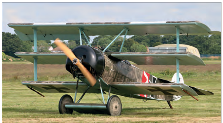
Fokker Dr.1 Triplane Replica G-CFHY/556/17 (PFA 238-4408) at Solent on 8th June 2019. [Terry Coombes]

Westland Scout AH.1: G-BXRS/XW613 Westland WA.341 Gazelle HT.2: G-ZZLE/XX436 Westland WA.341 Gazelle HT.3: G-CBSI/XZ934, G-CBSK/ZB627 WSK-PZL Antonov AN-2P: HA-ANG (9th only) Yakovlev Yak-18T: HA-YAV (9th only) Yakovlev Yak-52: G-YAKI(9th only), G-YAKX (9th only) The Red Arrows also performed a flypast on the 8th.