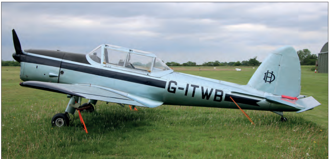
DHC-1 Chipmunk 22 G-ITWB (48) at Rougham on 26th May 2019.