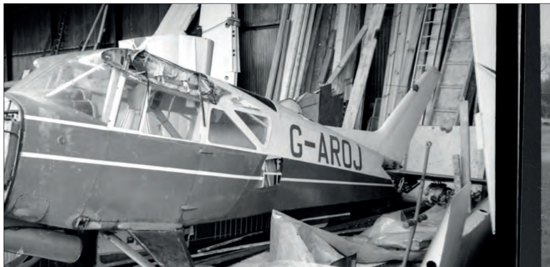
One of the Beagle A.109 Airedales for sale at Carr Farm is possibly G-AR0J (B.508), seen here at Whelpley Ash Farm on 31st March 1979.

Another of the older classic microlights appears from a Macclesfield owner/seller in the shape of Hiway Skytrike I/Flexiform Highlander