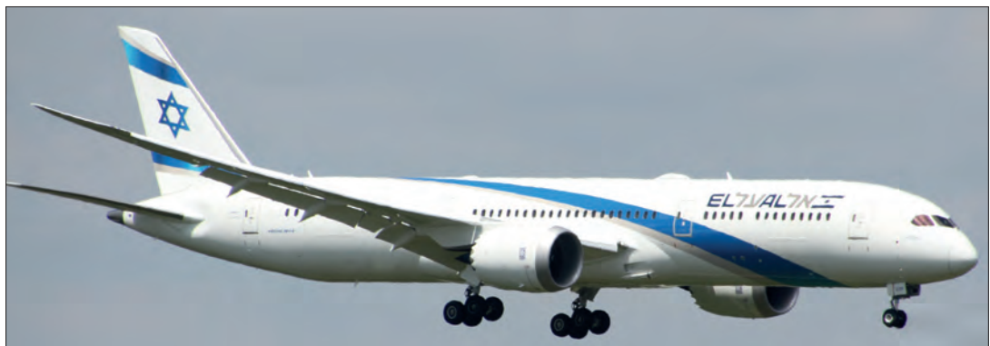
Boeing 787-9 4X-EDK (63395/863) of El Al Israel Airlines at Heathrow on 3rd July 2019. [Norman Hibberd]