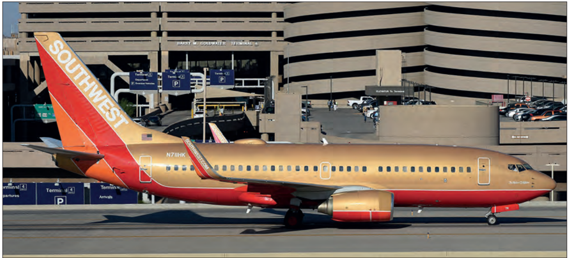
Boeing 737-7H4 N711HK (27845/38) of Southwest Airlines at Phoenix, AZ – Sky Harbor International Airport (KPHX) on 12th June 2019 wearing the “The Herbert D. Kelleher” retro colour scheme.