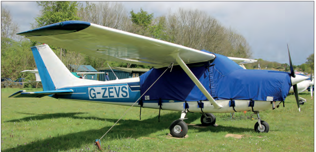
Cessna F172H G-ZEVS (F17200736) is a new resident at Popham and was seen at the Microlight Fair on 4th May 2019.

SOLENT, HANTS – Magni M16C G-CFXF arrived to be based on the 26th. X'Air Hawk G-IEEF is due to have departed to Henstridge by the time you read this and Pegasus Quik G-TCNY was road out on the 1st June, having been sold.