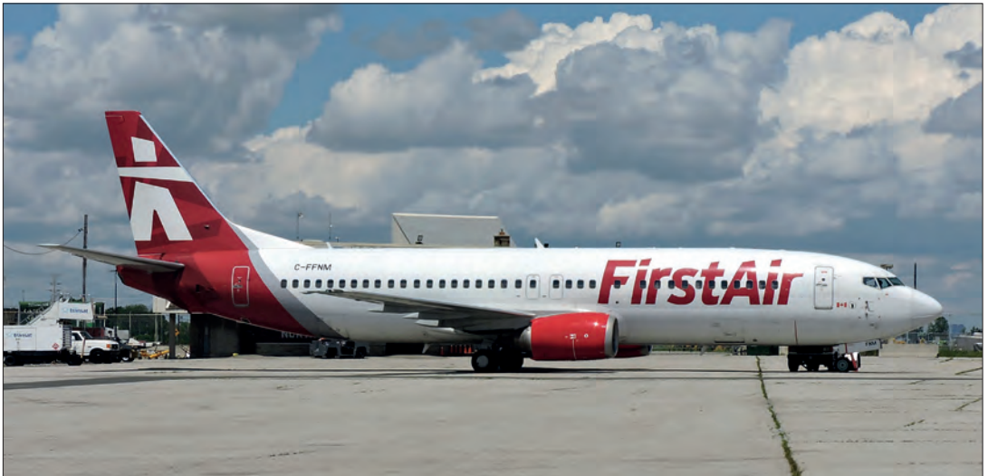
Boeing 737-436 C-FFNM (25839/2188) of FirstAir at Toronto Pearson on 29th June 2019.