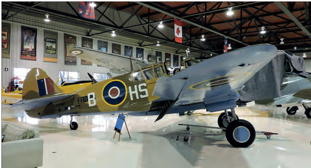
Curtiss 87V Warhawk IV C-FVWC/FR350' (28589) at Vintage Wings of Canada, Gatineau.

Lockheed 583-04-15 Starfighter (CF-104D) 104646 (583A-5316) Lockheed Lear Learstar (Lockheed 18-10 Lodestar (C-57)) CF-CEC (18-2132)