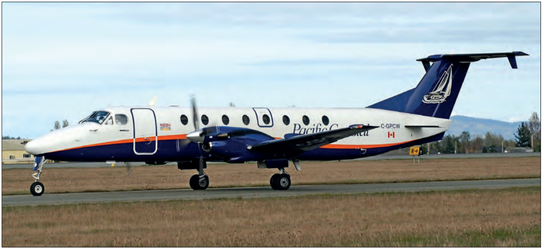
Beech 1900C-1 C-GPCW (UC-76) of Pacific Coastal has now been sold to Alaska Central Express and registered N127AX. It was photographed at Victoria, British Columbia on 28th March 2018.

1900D UE-383 N383AW Skyline Aviation Services LLC; registered 13Jun19. 1900D UE-428 OB-2157P cancelled as exported to Canada 04Jun19.