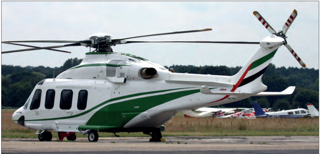
AgustaWestland AW139 DU-141 (31224) at Fairoaks on 9th July 2019.