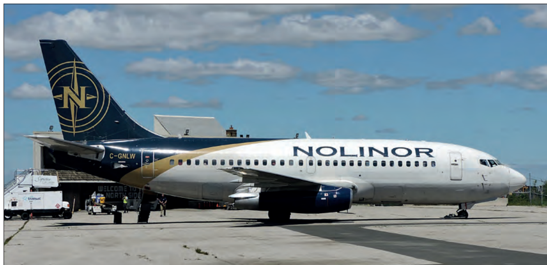
Boeing 737-2R4C(A) C-GNLW (23130/1040) of Nolinor at Toronto Pearson on 30th June 2019. [Hawthorn Photography]