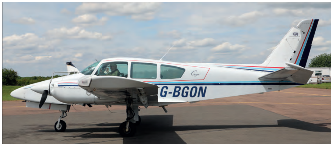
Grumman American GA-7 Cougar G-BGON (GA7 0095) at Leicester on 1st June 2019.