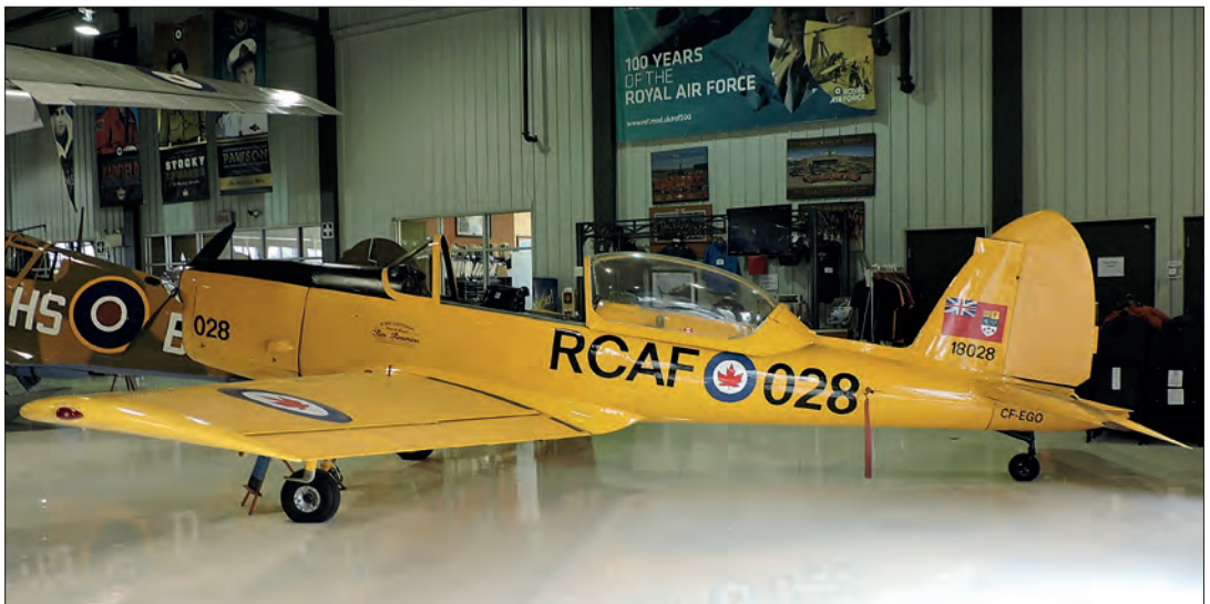
De Havilland DHC.1 Chipmunk 1B-2-S5 CF-EGO/18028 (166-204) at Vintage Wings of Canada, Gatineau.

Lockheed 414-17-11 Hudson VI (A-28A) FK466 (414-6942) – fuselage only.