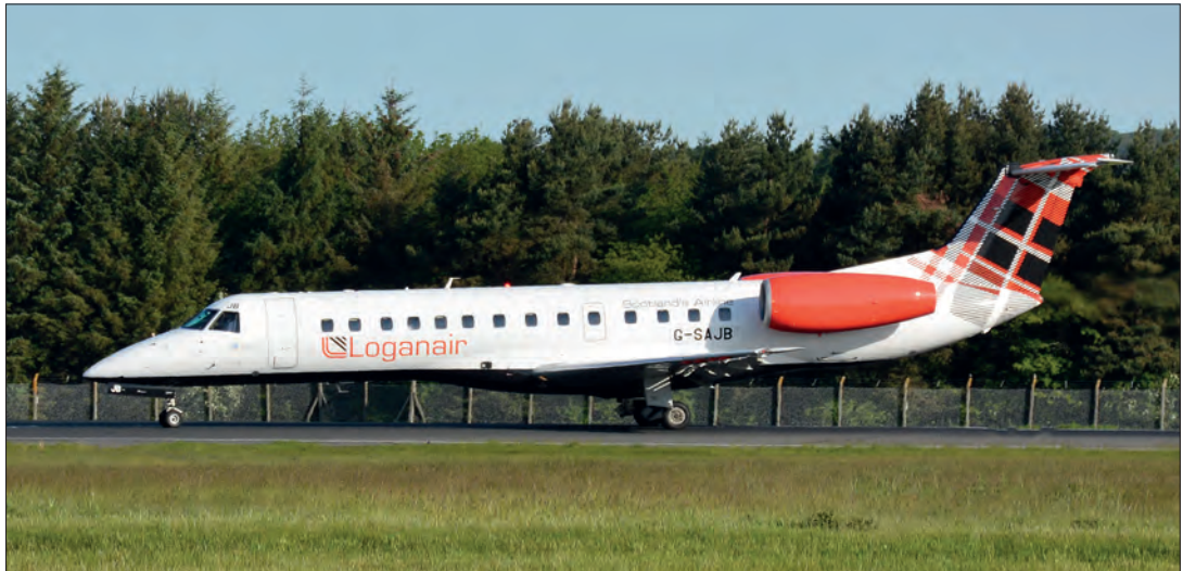
Embraer EMB-135ER G-SAJB (145473) of Loganair at Edinburgh on 1st June 2019.

On the 14th Daher TBM-930 N930AD [1272] arrived from Tarbes-Lourdes, night stopped and continued on to Keflavik en route to Groton, CT.