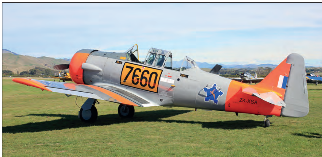
North American AT-6A Texan ZK-XSA/7660 at Omaka on 20th April 2019. [Roy Blewitt]

Aeroprakt A-32 Vixen: ZK-WCB AESL Airtourer Super 150: ZK-DBD Auster J/5 Adventurer: ZK-AXJ Aviat A-1B: ZK-RBC B&F Technik FK-14B Polaris: ZK-RFD Bell 206B JetRanger: ZK-HTA Cessna 172M Skyhawk: ZK-DXJ, ZK-DXL Cessna 172P Skyhawk: ZK-MAG Cessna 172S Skyhawk SP: ZK-JQA, ZK-KAL Cessna 177B Cardinal: ZK-DFU, ZK-DMI Cessna 180A: ZK-FRY Cessna 182R Skylane: ZK-CNR Cessna R182 Skylane RG: ZK-MRG Cessna T182T Turbo Skylane: ZK-ZZR Cessna 185 Skywagon: ZK-CAK Cessna U206D Stationair: ZK-EDI Cessna 208B Grand Caravan: ZK-SKY Cirrus SR22: ZK-MKO De Havilland Canada DHC-2 Beaver: ZK-BVA Gipsland GA-8 Aerovan: ZK-EHS, ZK-PEL Grumman American AA-5A Cheetah: ZK-DLL Grumman American AA-5B Cheetah: ZK-EFT Jodel D.11A: ZK-DJQ MX MXS: ZK-MXS Piper PA-22-150 Tri Pacer: ZK-IDX, ZK-TDA Piper PA-28-140 Cherokee: ZK-CUD Piper PA-28-151 Warrior: ZK-DOT Piper PA-28-160 Cherokee: ZK-CNY Piper PA-28-181 Archer II/III: ZK-JPA, ZK-KCC Piper PA-38-112 Tomahawk: ZK-EIY Pitts S-1S: ZK-FRJ Rockwell Aero Commander 690A: ZK-PVB SOCAT A Rallye 235: ZK-RLY SportCruiser: ZK-JBZ Team Rocket F1: ZK-FIZ Tri-R Cruiser: ZK-TEL Van's RV6A: ZK-RVF Victa Airtourer 100: ZK-CHF Wittman Tailwind: ZK-RET Yakovlev Yak-18: ZK-SSR Zenair CH601 Zodiac: ZK-DBZ