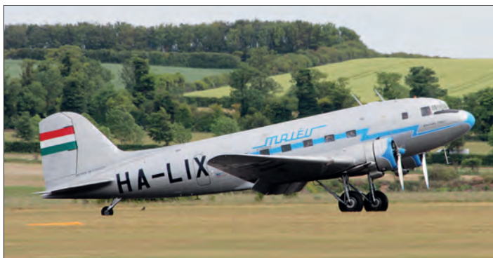
Lisunov Li-2T HA-LIX (18433209) at Duxford on 2nd June 2019.

Cessna 180K Skywagon: G-CIBO (180-53177) Cessna T.303 Crusader: D-IBIS (T303-00024) De Havilland DH.104 Devon C2/2: G-DHDV/VP981 (4205) De Havilland DH.82 Tiger Moth: G-AGPK/PG657 (86566), G-ANZZ/DE974 (85834) De Havilland DH.89A Dragon Rapide: G-AIYR/HG691 (6676) De Havilland DH.89B Dominie I: G-AIDL/TX310 (6968), G-AKIF (6838) Europa Aviation Europa XS: G-OVPM (625) Grumman F8F-2P Bearcat: G-RUMM/121714 (D.1088) Grumman FM-2 Wildcat: G-RUMW/JV579 (5765) Hawker Fury F Mk.I: G-CBZP/K5674 (41H-67550) Noorduyn AT-16-ND Harvard IIB: G-BDAM/FE992/992 ER (14-726) Noorduyn AT-6A Harvard T.2B: G-CORS/KF183 (14A-1884) North American AT-6C Harvard IIA: G-TSIX/111836 (88-9725) North American AT-6D-NT Texan: G-TDJN/313048 (121-42228) North American P-51D Mustang: G-BIXL/472216 (122-38675), G-SHWN/KH774 (122-40417) Piper J-3C-65 Cub: G-BILI/454467 (13207) Piper PA-28-140 Cherokee: G-BRPK (28-7325070) Piper PA-28-161 Warrior II: G-GUAR (28-7816576) Piper PA-32R-301T Turbo Saratoga SP: F-GGBD (32R-8129110) Reims/Cessna F172M Skyhawk: G-BKIJ (920) Republic P-47D Thunderbolt: G-THUN/549192 (399-55731(2)) Socata TB-10 Tobago: G-GGBH (6) Supermarine Spitfire LF.IX: G-ASJV/MH434 (CBAF.IX552) Supermarine Spitfire Tr.9: G-BMSB/MJ627 (CBAF.7722) Supermarine Spitfire Vb: G-LFVB/EP120 (CBAF.2403) Supermarine Spitfire XVIe: G-OXVI/TD248 (CBAF.IX4262)