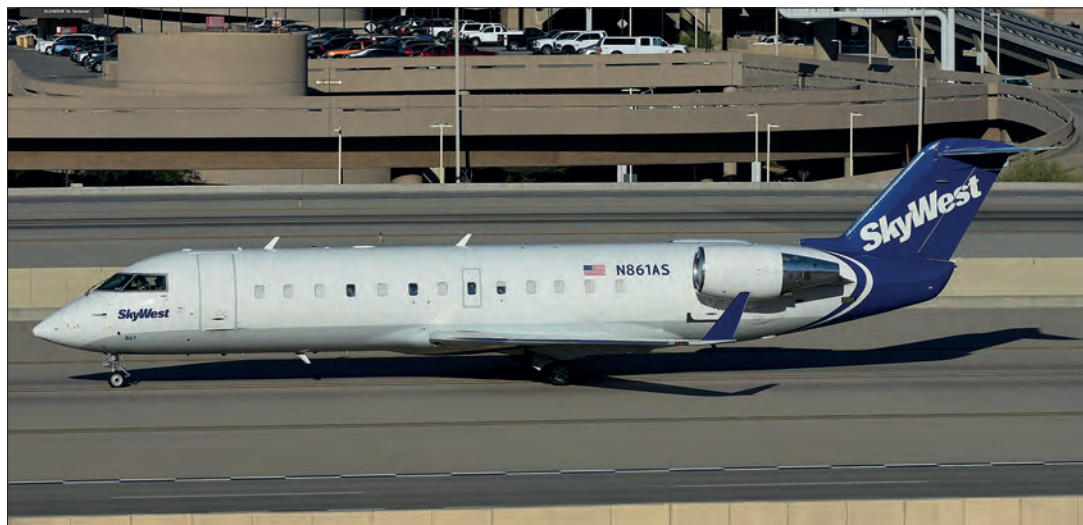
Canadair CRJ-200ER N861AS (7445) of Skywest Airlines at Phoenix, AZ – Sky Harbor International Airport (KPHX) on 12th June 2019.

CL-600-2D24 15467 C-GZUY Bombardier Inc; ff 08Jun19, registered to American Airlines Inc as N605NN 21Jun19 and ferried YMX-Dayton same day as JIA9939 for op by PSA Airlines for American Eagle.