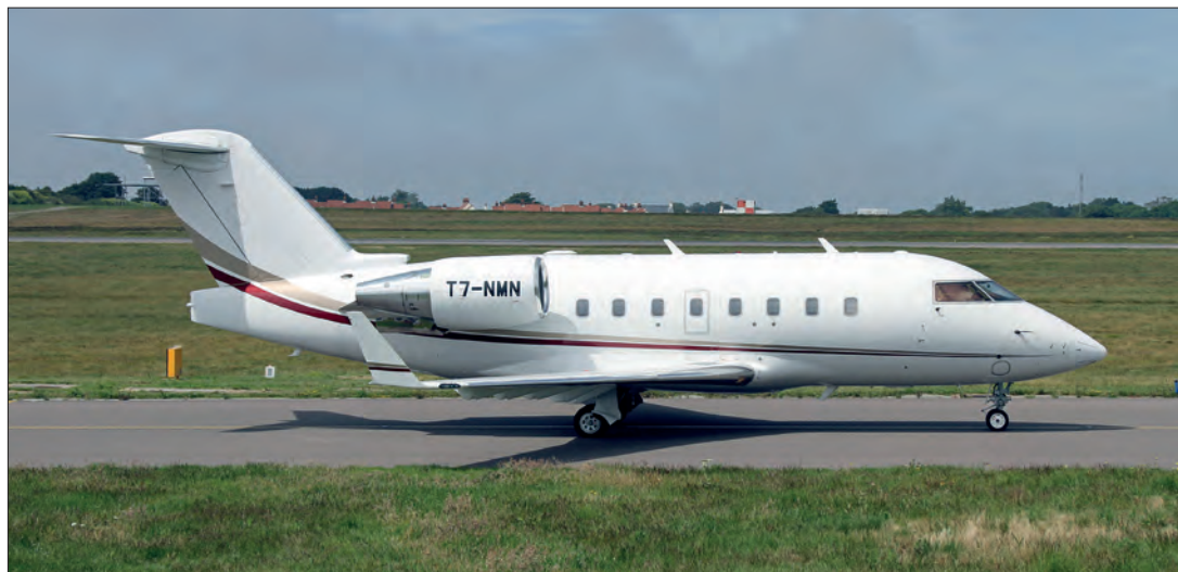
... which had been achieved by 24th June 2019, when it was captured taxiing.