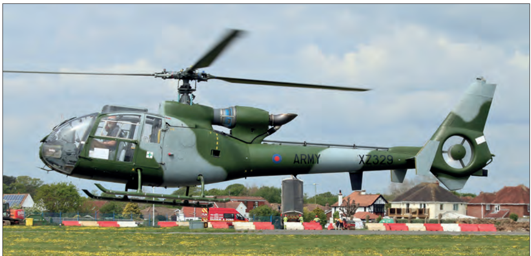
SA.341 Gazelle AH.1 G-BZYD/XZ329 (1648) at Solent on 2nd May 2019.

As expected Loganair inaugurated its flights to Scottish destinations in May, the service from & to Aberdeen commencing on 12th and that from & to Glasgow on 28th. Aircraft used on the Aberdeen route were as follows: SAAB 2000s G-LGNO (20th, 21st), G-LGNR (19th, 24th, 29th), G-LGNS (15th, 30th), Embraer 145s G-SAJC (22nd, 23rd), G-SAJG (23rd, 24th), G-SAJH (20th), G-SAJL (16th), G-SAJN