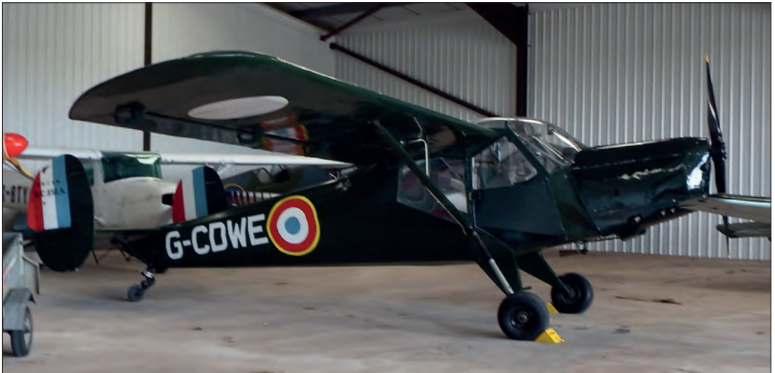
Nord NC.856 Norwegian G-CDWE (01) at Dunkswell on 6th July 2019.

replaced sister-ship G-NHAA on Air Ambulance duty on the 16th. The increase in visitors on 24th to 26th May was due to the Radio One Big Weekend being held locally at Stewart Park, Marton-in-Cleveland.