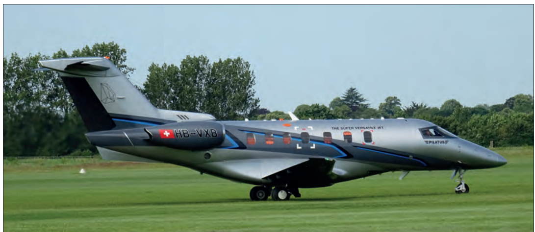
Pilatus PC-24 HB-VXB (P02) at Goodwood on 28th June 2019. [Vaughan Hewitt]