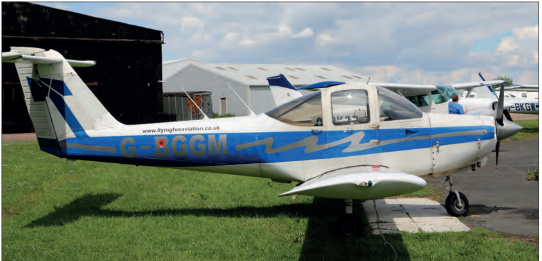
PA-38-112 Tomahawk G-BGGM (38-79A0170) at Leicester on 6th June 2019. [Nigel Bailey-Underwood]