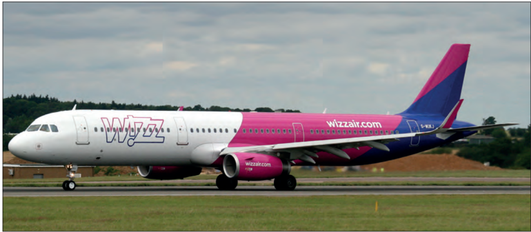
Airbus A321-231 G-WUKJ (8879) of Wizz Air at Luton on 1st July 2019. [K West]