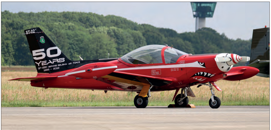
SiAl-Marchetti SF.260M ST-02 in special 50 Year colours, at Volkel on 15th June 2019.