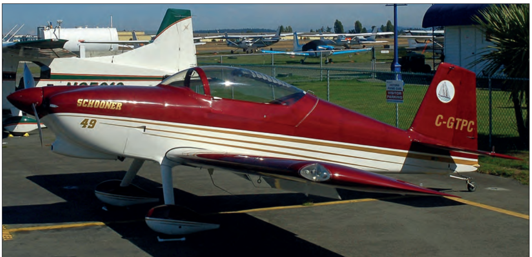
Van's RV-8 C-GTPC (82421), seen at Victoria, British Columbia on 19th September 2018, became N44LA on 4th June 2019.