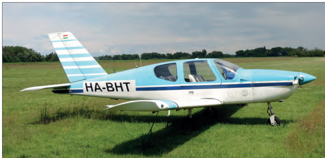
TB-9 Tampico HA-BHT (1295) was photographed at Ocseny on 22nd May 2019.