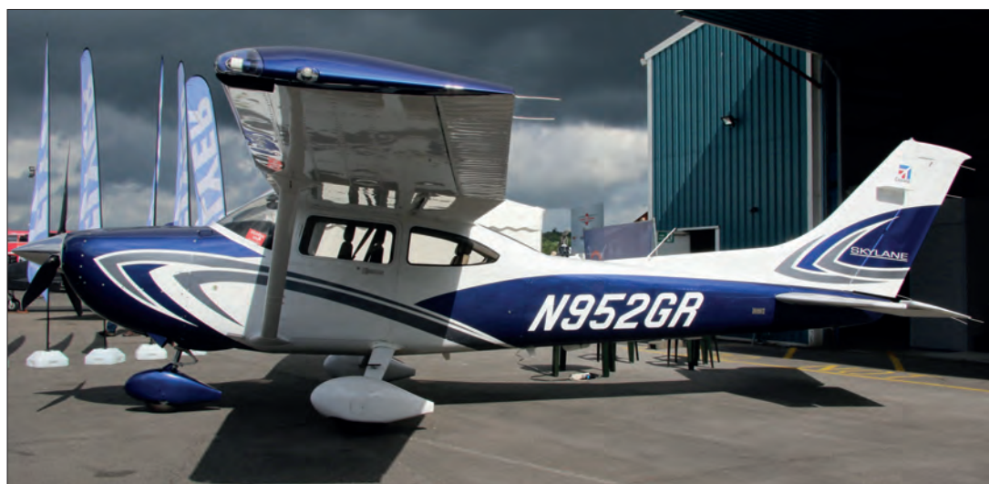
Cessna 182T Skylane N952GR (18283064) at Wycombe Air Park on 15th June 2019.