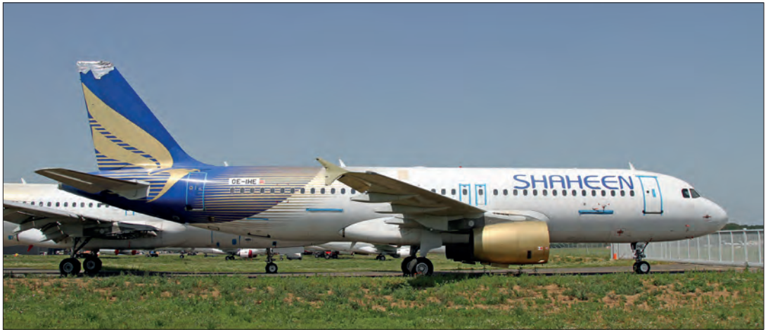
Airbus A320-232 (1497), still wearing the scheme of former operator Shaheen (ex AP-BLJ), was stored at Lourdes-Tarbes on 29th June 2019.