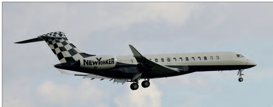
Bombardier BD-700-2A12 Global 7500 VP-CFK (70009) at London Stansted on 12th July 2019.