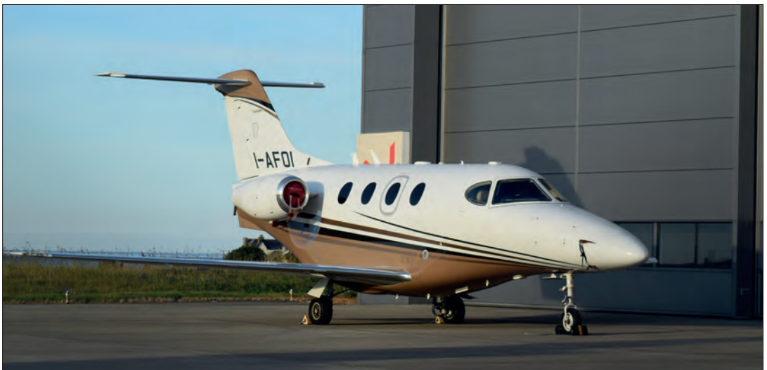
Beech 390 Premier 1A I-AFOI (RB-245) at Isle of Man on 4th July 2019.