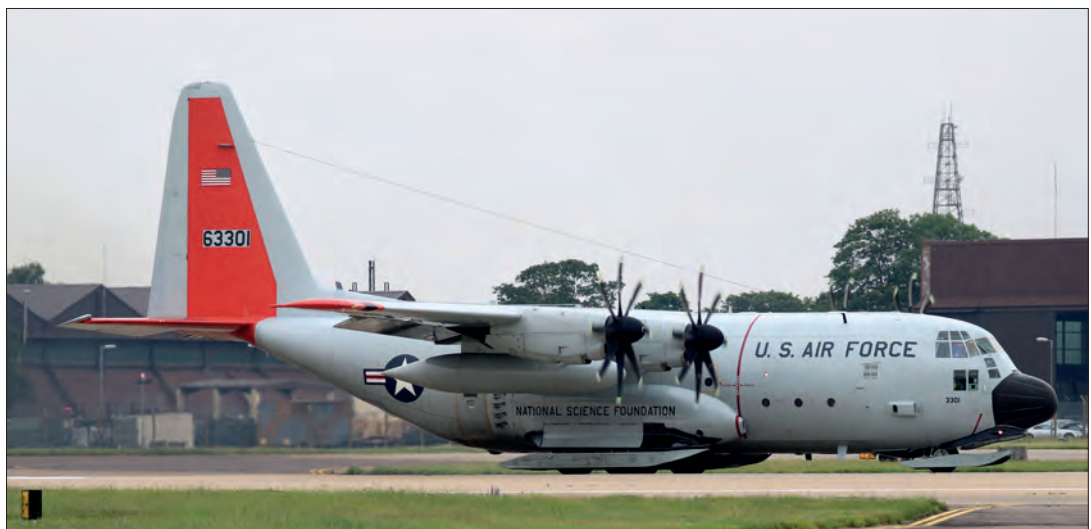
LC-130R 76-3301 of 139th AS, National Science Foundation, callsign Rch 565, at Mildenhall on 24th June 2019.