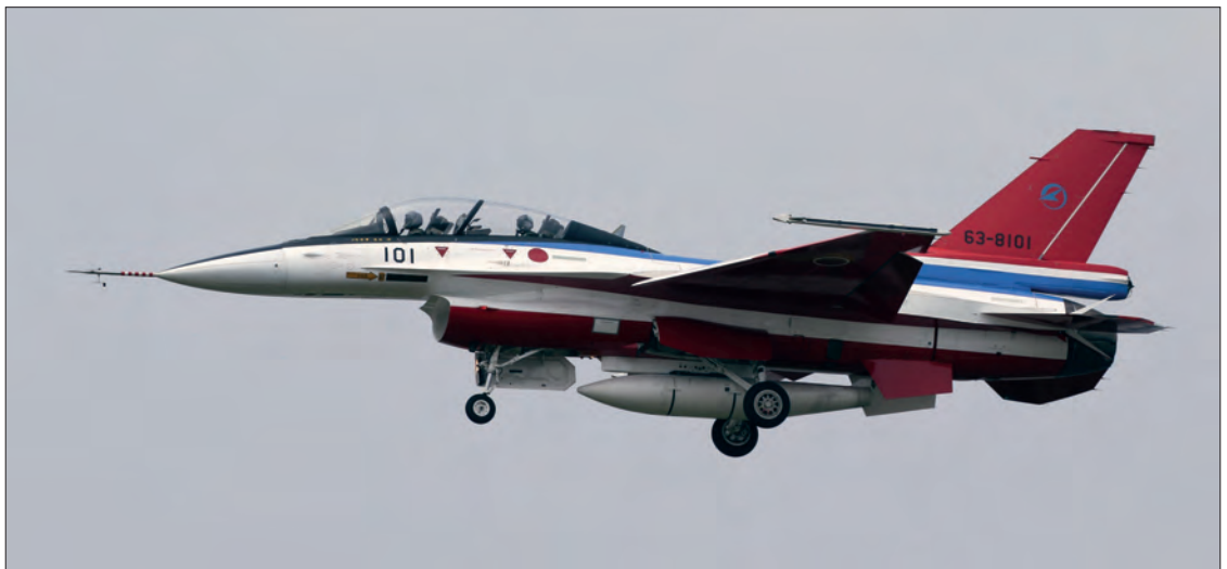
Fuji F-2B 63-8101 of JASDF/Hiko Kaihatsu Jikken Dan (Air Development and Test Command Squadron) on finals at Gifu AB on 2nd July 2019.