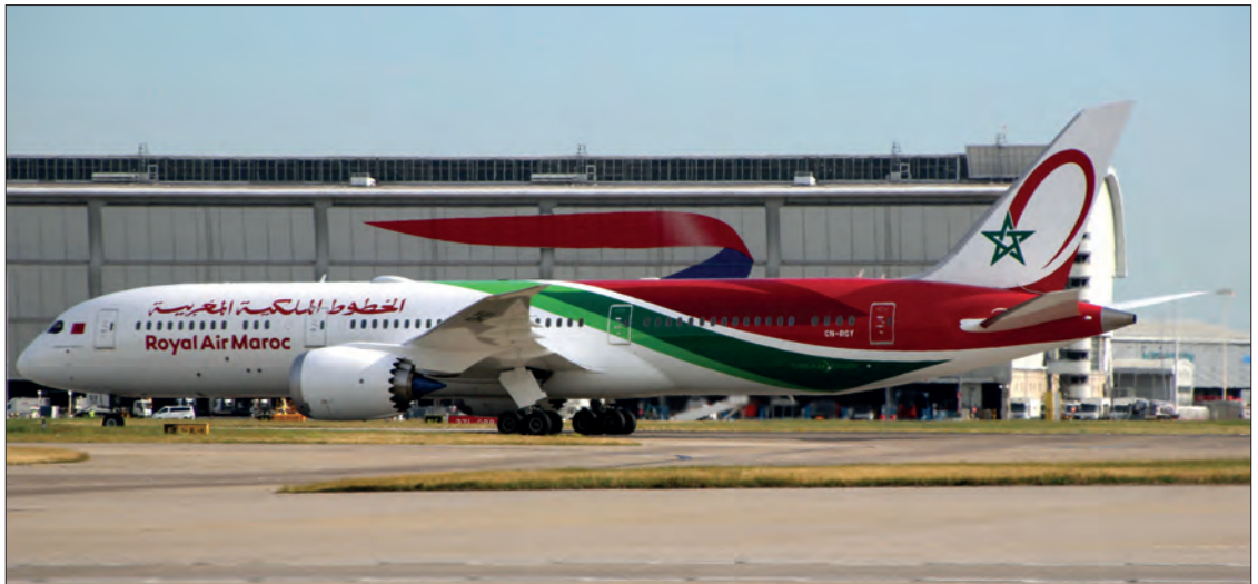
Boeing 787-9 Dreamliner CN-RGY (65558/859) of Royal Air Maroc at London-Heathrow on 4th July 2019. [K West]