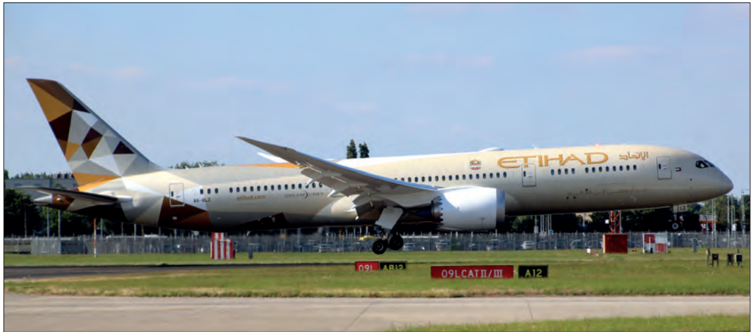
Boeing 787-9 Dreamliner A6-BLZ (42369/858) of Etihad at London-Heathrow on 3rd July 2019.

The carrier has awarded long term ground handling contract at Luton to John Menzies Plc.