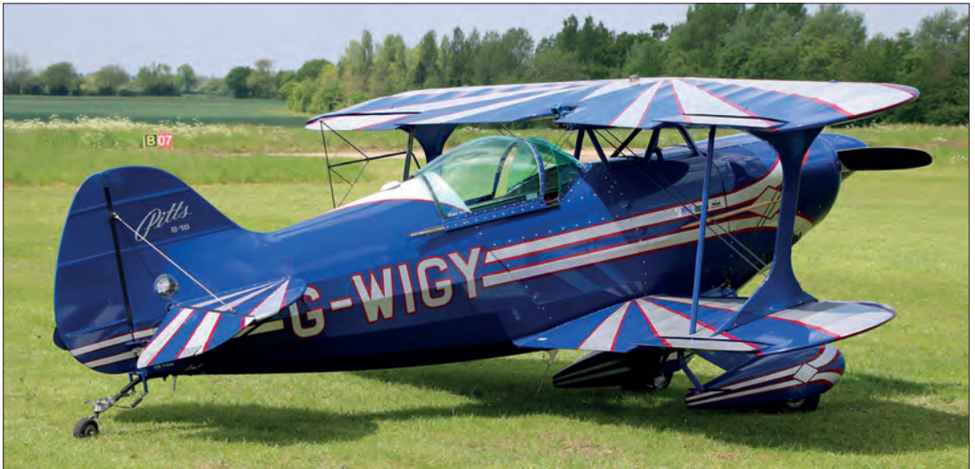
Pitts S-1S G-WIGY (7-0115) at Old Buckenham on 25th May 2019.