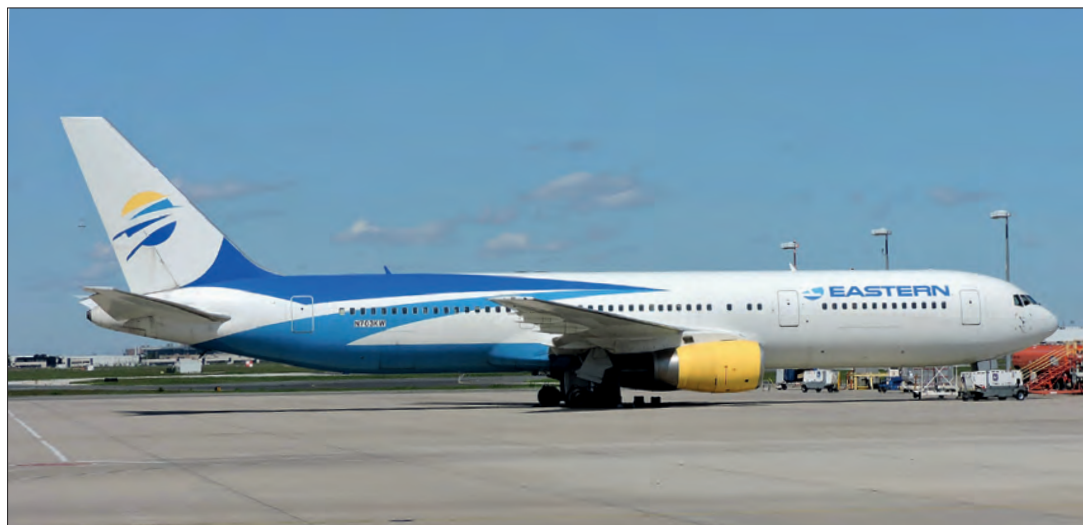
Boeing 767-336ER N703KW (24343/364) of Eastern at Toronto Pearson on 3rd June 2019.