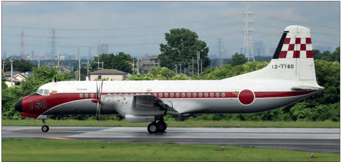
One of the very few remaining airworthy examples, YS-11FC 12-1160 of JASDF/Hiko Tenkentai (Flight Check Squadron) is lined up for departure from Iruma AB on 24th June 2019.