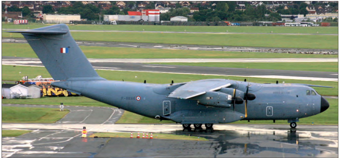
Airbus A400M 053/F-RBAK (053) at Le Bourget on 12th June 2019.