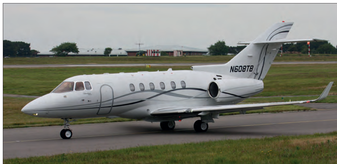
Hawker 900XP N608TB (HA-140) departing Guernsey on 18th June 2019 on delivery to the USA following its change of marks from G-SCPJ.

205 N429JS rereg'd N29JW , Schussboomer Systems Inc, WA. 6.19 235 N250EA marks N120RC are reserved. 7.19 260 N150HM marks N175MG are reserved. 6.19 300 OE-GKA returned to Koln-Bonn 18.3.18 following its fatal incident in Finland two months earlier [see ABN 2.18]. Flew Koln-Bonn → Luton → Keflavik 6-7.6.19 on ferry to Dallas/Love Field, where it arrived 8.6.19.