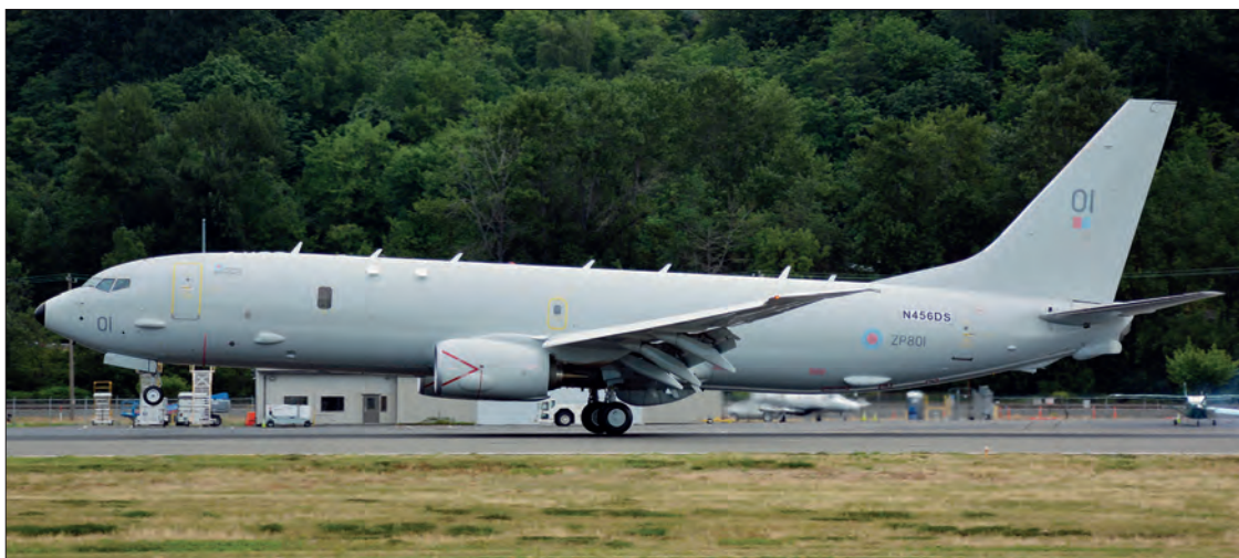
P-8 Poseidon ZP801 (64175/7532), the first for the RAF, made its first flight from Renton on 12th July 2019, wearing the temporary registration N456DS. It is seen here landing at Boeing Field.