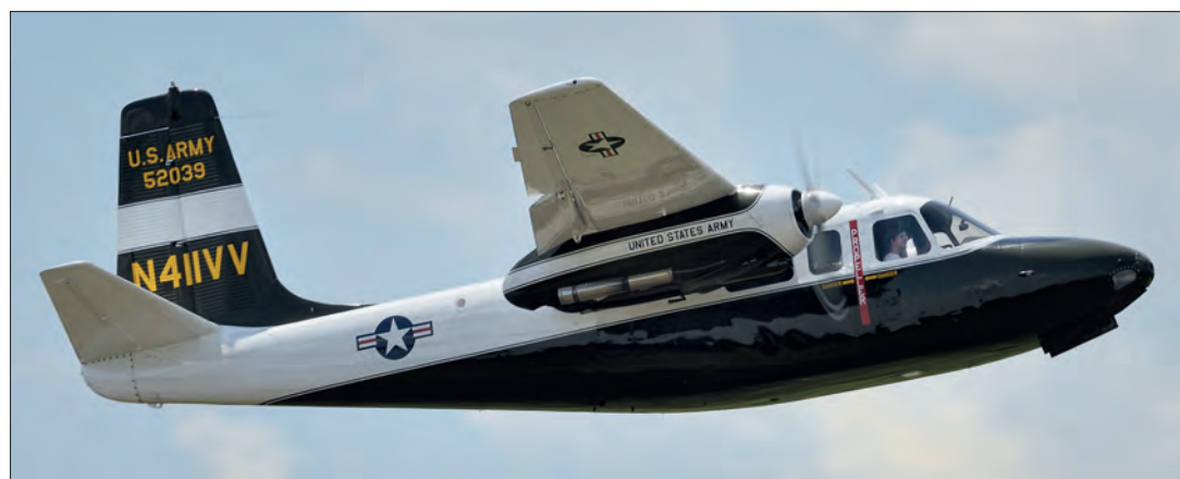
Aero Commander Model 520 N411VV (520-39) was a participant in the Women Can Fly day, Virginia, at KHWY on 29th June 2019. The markings are similar to the US Army VIP scheme worn by the U-9, which other than the three Model 520s acquired for evaluation, were later Aero Commander models. [Alex Hrapunov]