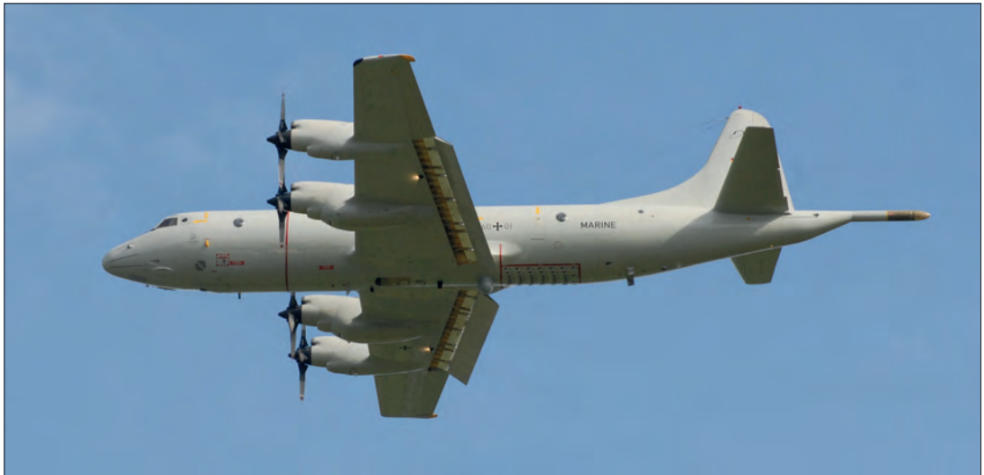
Lockheed P-3C CUP 60+01 (5737) of the German Navy at RAF Cosford on 9th June 2019. [Trevor Warren]