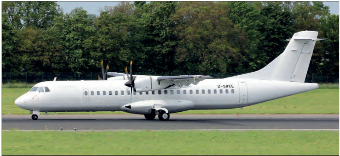
ATR72-212A 2-SWKE (767) of Elix Aviation Capital arrived at Rotterdam on 21st May 2019 and was scheduled to depart to Shannon but was unserviceable; it flew out on 26th May 2019, when this photo was taken.