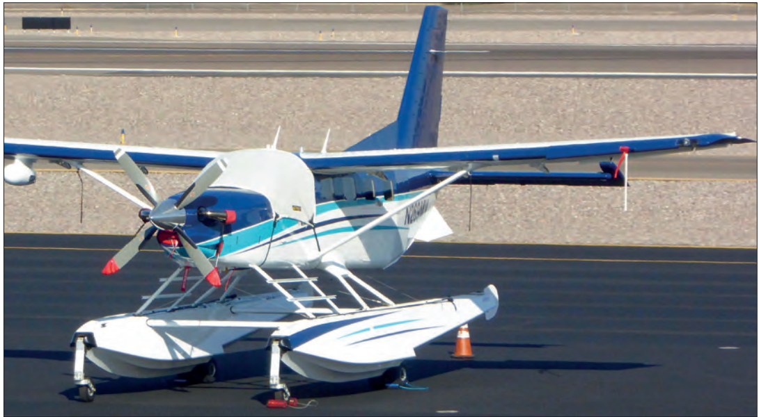
Quest Kodiak N148QK (100-0148), at Scottsdale on 10th July 2019, with its new registration N269MV applied. [David Fidler]