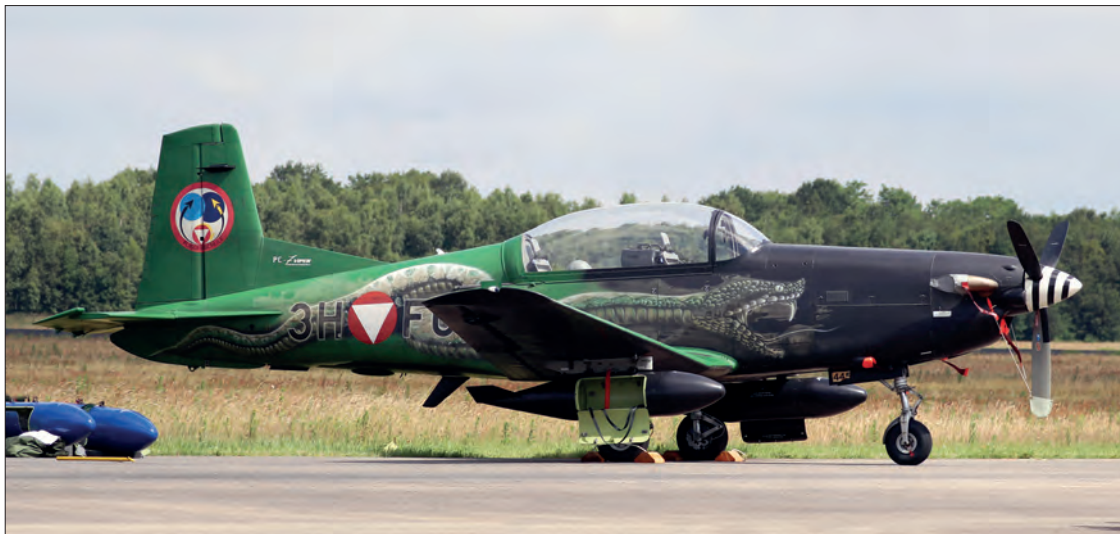
Pilatus PC-7 3H-FG (445) of the Austrian Air Force at Volkel on 15th June 2019.