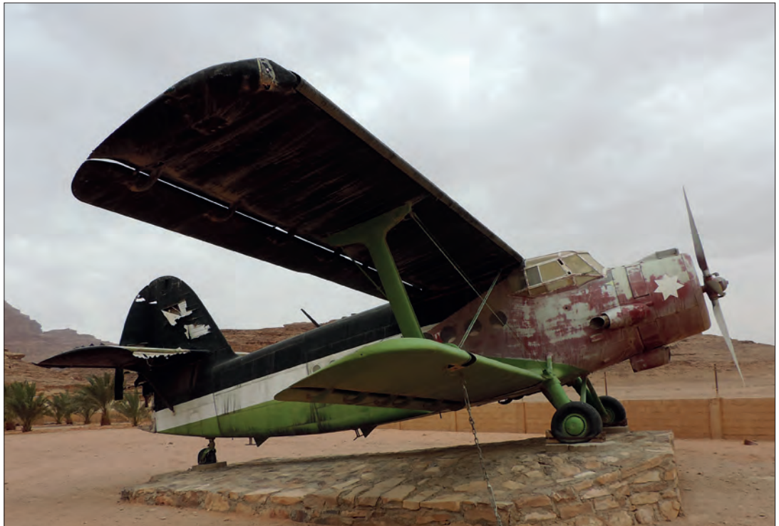
This anonymous Antonov An-2 is derelict at Beit Ali Lodge, Wadi Rum, Jordan where it was photographed on 8th April 2019.