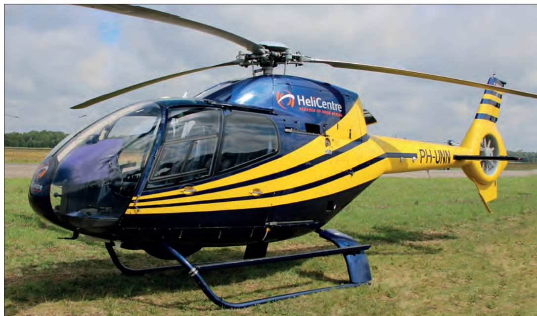
EC.120B PH-UNN (1310) of Heli Holland at Volkel on 15th June 2019.