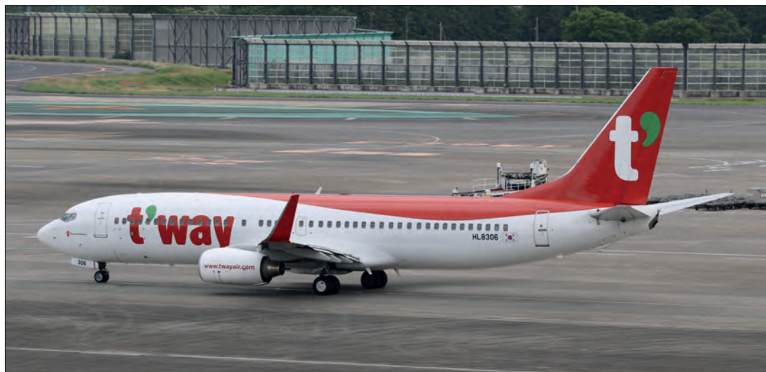
Boeing 737-8AS HL8306 (40308, ex Ryanair) of T'Way Air at Tokyo-Narita on 22nd June 2019.

company will sell a 50% stake in the aviation services company UTG to restructure debt.