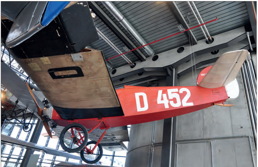
Udet U-10 D-452 is displayed at the Deutsches Technikmuseum, Berlin.