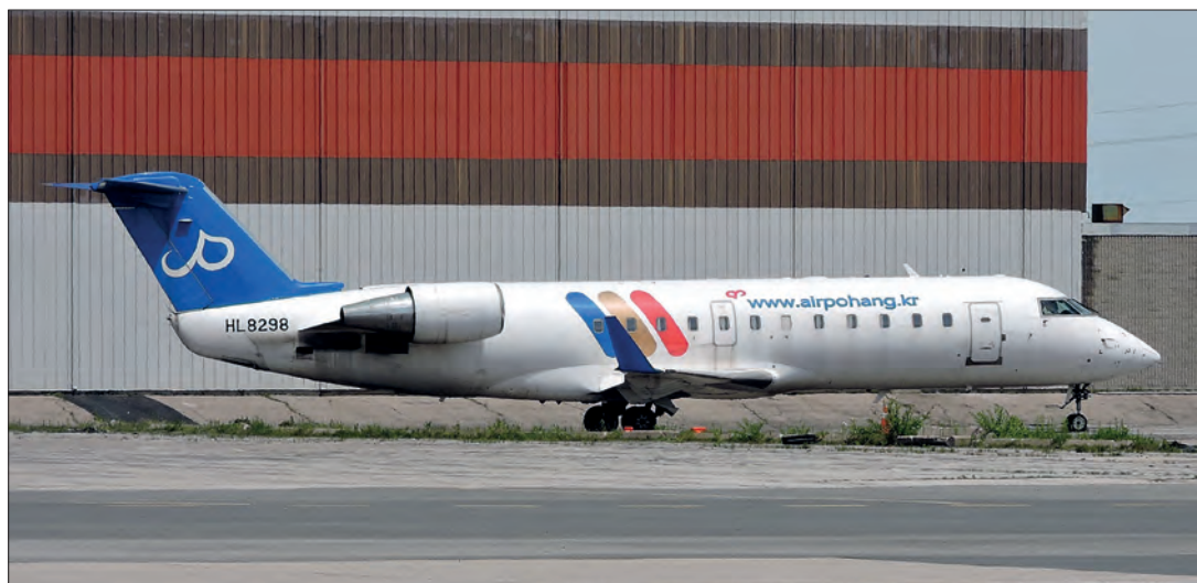
CRJ-200ER HL8298 (7834) of Air Pohang at Toronto Pearson on 9th June 2019.