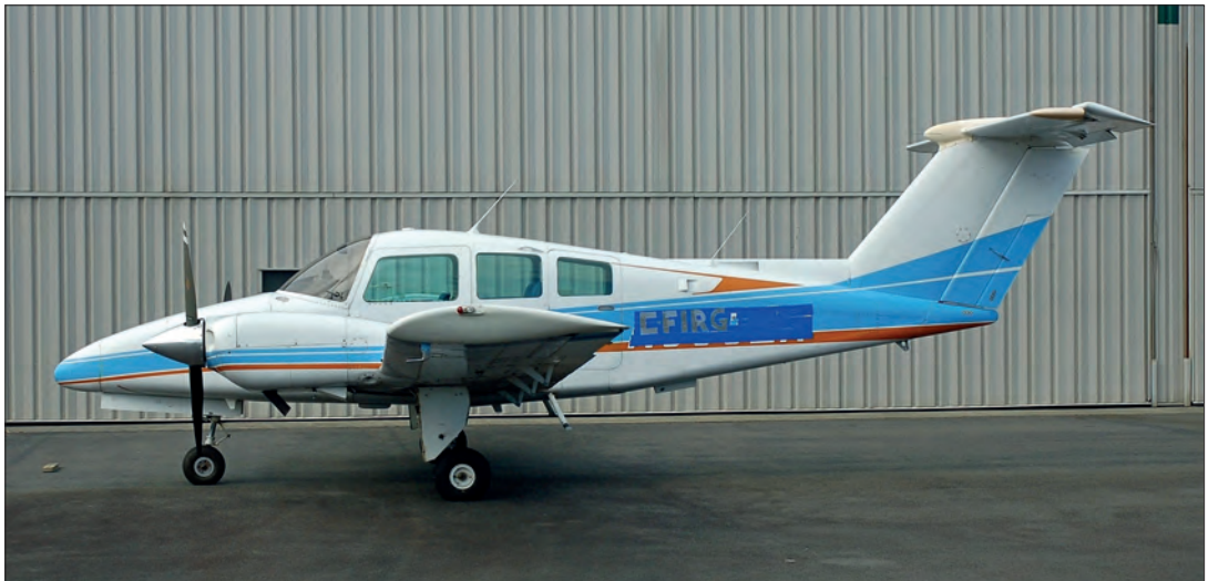
Beech 76 C-FIRG (ME-236) at Victoria, British Columbia on 18th June 2019.