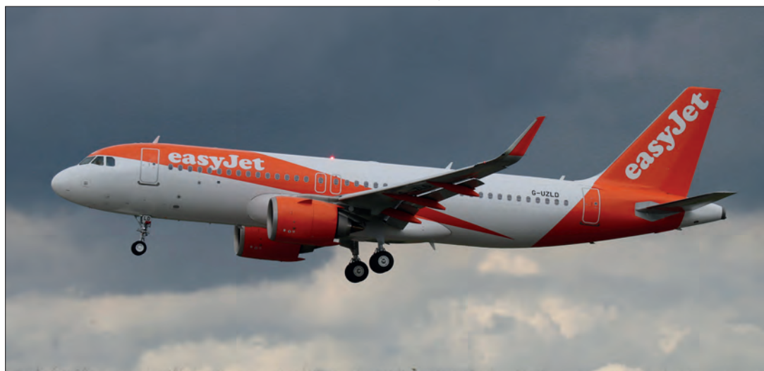
Airbus A320-251N G-UZLD (9036) on delivery to Luton on 20th June 2019.

EasyJet [U2/EZY] [UK] and its pilots' union in Spain have signed a new agreement in force until 2022.