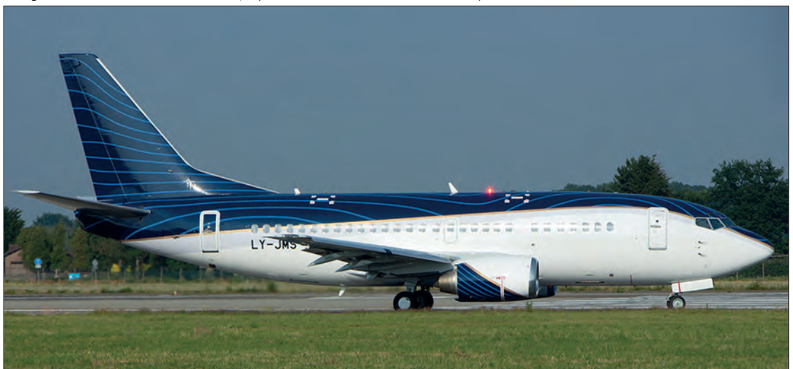
Boeing 7370522 LY-JMS (26680/2366) of Klasjet at Maastricht airport on 26th June 2019 after painting.