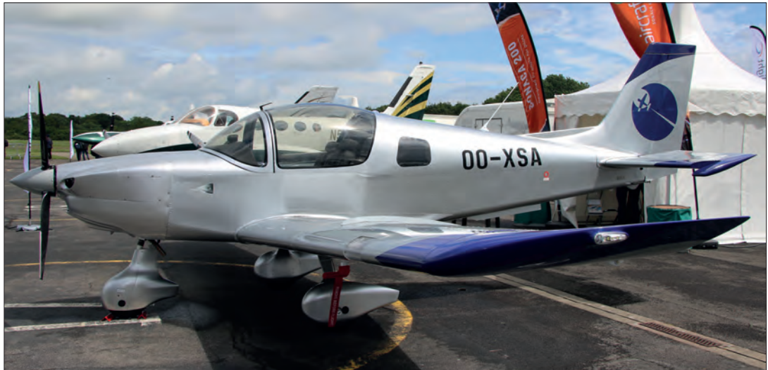
Sonaca S200 OO-XSA (009) at Wycombe Air Park on 14th June 2019.

De Havilland DHC-1 Chipmunk T.10: G-HAPY (C1/0697) Diamond DA20-A1 Katana: G-DAZO (10027) Diamond DA40 Star: N824US (40.824) Diamond DA40NG Star: G-SBSB (40.N319) Diamond DA42 Twin Star: G-CDXK (42.136), N469WW (42.AC074) Diamond DA42NG Twin Star: OE-FLZ (42.N351) Diamond DA62: G-IRJE (62.111) Dyn Aero MCR1 ULC: G-CBZX (?) Eurocopter EC120 B Colibri: G-MODE (1295) Europa Aviation Europa XS: G-IOWE (388), G-NICX (525) Evektor EV-97 EuroStar SL: G-CIDZ (2013 4107), G-CJTX (2016 4238), G-GLSA (2014 4216) Evektor EV-97 TeamEuroStar: G-CDEP (2004 2128), G-CFGX (2008 3212), G-CGGM (2008 3401) Evektor EV-97A TeamEuroStar: G-RJRJ (2008-3121) Flight Design CTSW: G-CTDW (38479) Grumman-American AA-5A Cheetah: N9910U (AA5A-0310) Guimbal Cabri G2: G-CILR (1090), G-CJEK (1151), G-HCEN (1079), G-LAVN (1234) Hughes 369E (MD-500E): G-MDDE (0563E) Junkers F-13 (Replica): HB-RIM (13-001) Lambert M108 Mission: G-OZZE (?) Mudry CAP 10B: G-CZCZ (54) P&M QuikR: G-JFAN (8525) Partenavia P68B Victor: G-ENCE (141) Pietenpol Aircamper: G-BUCO (?) Pilatus PC-12/47E: G-DYLN (1760) Piper J-3 Cub: G-AISX (11663) Piper PA-22-160 Tri-Pacer: G-ARGL (22-5898) Piper PA-28-140 Cherokee: G-AVGE (28-22787), G-AXSZ (28-26188) Piper PA-28-160 Cherokee: G-JAKS (28-339) Piper PA-28-161 Cherokee Warrior: G-BJCA (28-7916473), G-BNCR (28-8016111), G-BNOL (2816023), G-BODR (28-8116318), G-BSVG (28-8516013), G-CEIZ (28-8116076), G-EGLL (28-7816257), G-PJCC (2816043), G-SIXT (2816056)