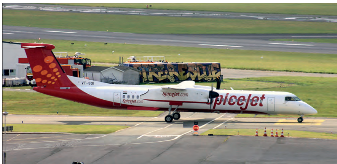
DHC 8-402NG VT-SQI (4596) of Spicejet at Le Bourget on 14th June 2019. [Jeff Hamilton]

preliminary stage. However, it is also in early talks with Fosun Tourism (Hong Kong) to sell its tour operating business.