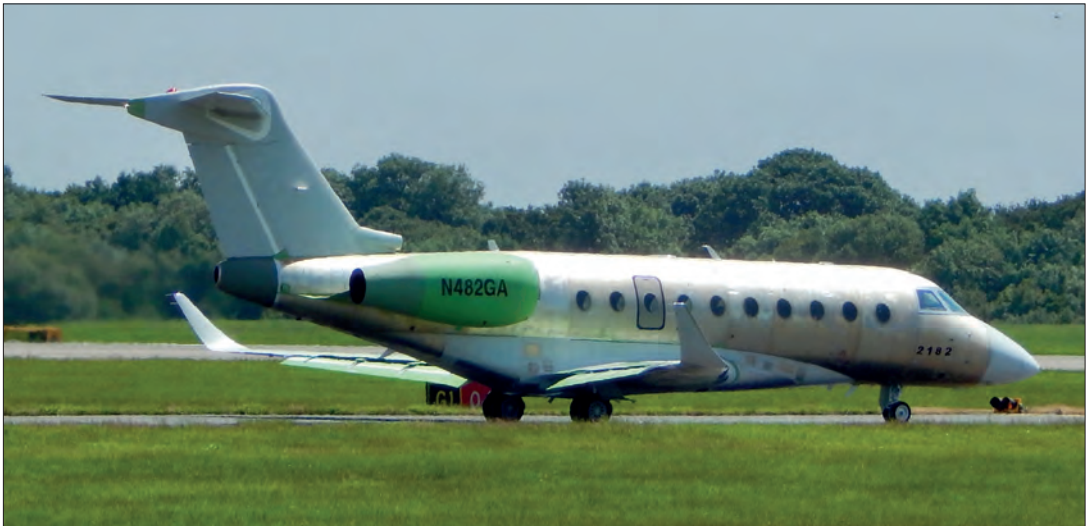
Gulfstream G280 N482GA (2182) at Stansted on 28th June 2019.