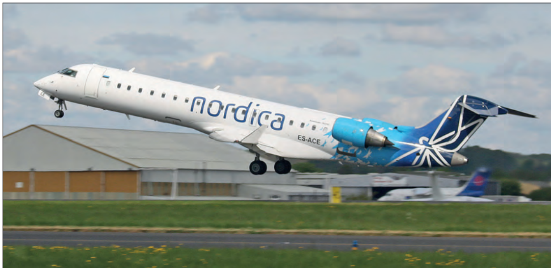
Bombardier CRJ-701ER ES-ACE (10083) of Nordica, operating for Air Malta, departing Southend on 2nd May 2019.