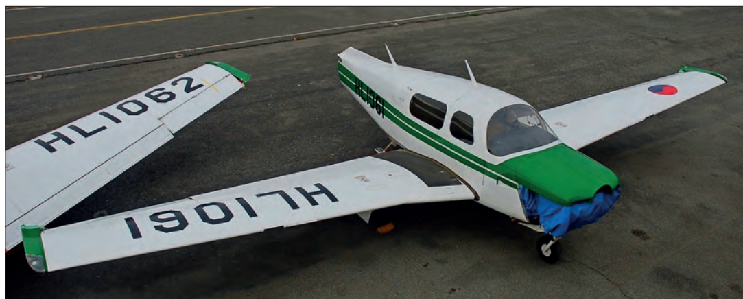
Mooney M20) HL1061 (24-2220) ready for reassembly at Langley, British Columbia on 26th June 2019.