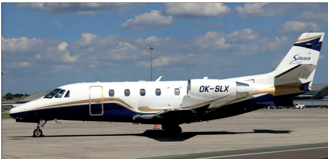
Cessna 560XL Citation Excel OK-SLX (560-5243) at Southend on 25th May 2019.