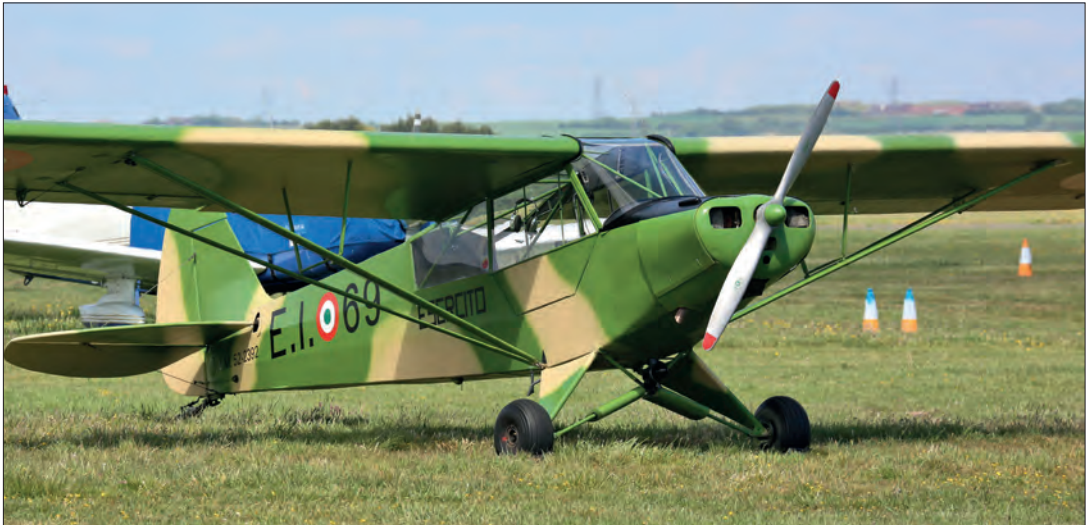
PA-18 Super Cub 95 G-HELN/MM52-2392 (18-3365) at Solent on 25th May 2019.

(14th, 17th, 20th) & G-SAJO (24th, 26th, 28th, 30th, 31st) and Embraer 135s G-SAJR (13th, 14th, 15th, 19th, 21st, 22nd, 27th, 29th) & G-SAJT (12th, 13th, 16th). G-SAJR received the traditional water arch on arrival here on 13th. The Glasgow service was flown by Embraer 145 G-SAJC on all four days, 28th to 31st.