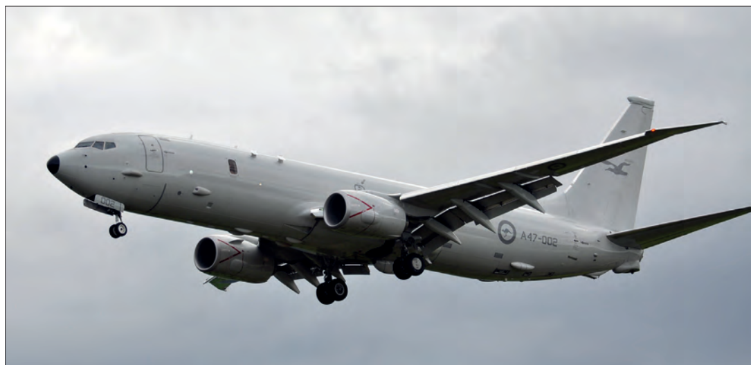
Boeing P-8A Poseidon A47-002 of the RAAF at the Wings over Illawarra Air Show NSW Australia on 4th May 2019.

Marshall Aerospace and Defence Group announced on 20/6/19 that Bangladesh is to receive additional former RAF Hercules C5 transport