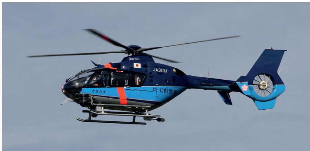
Tokyo Police EC135P2+ JA310A seen returning to its base at Truma Air Base on 24th June 2019.

The unit has mainly relied upon Bell OH-58 Kiowa aircraft to provide air support services across the state for many years but acquired a single modern Bell 407 (N407NC/53840) in 2008. Last June it lost one of the 40-year-old Kiowas (N303HP) in a take-off accident at