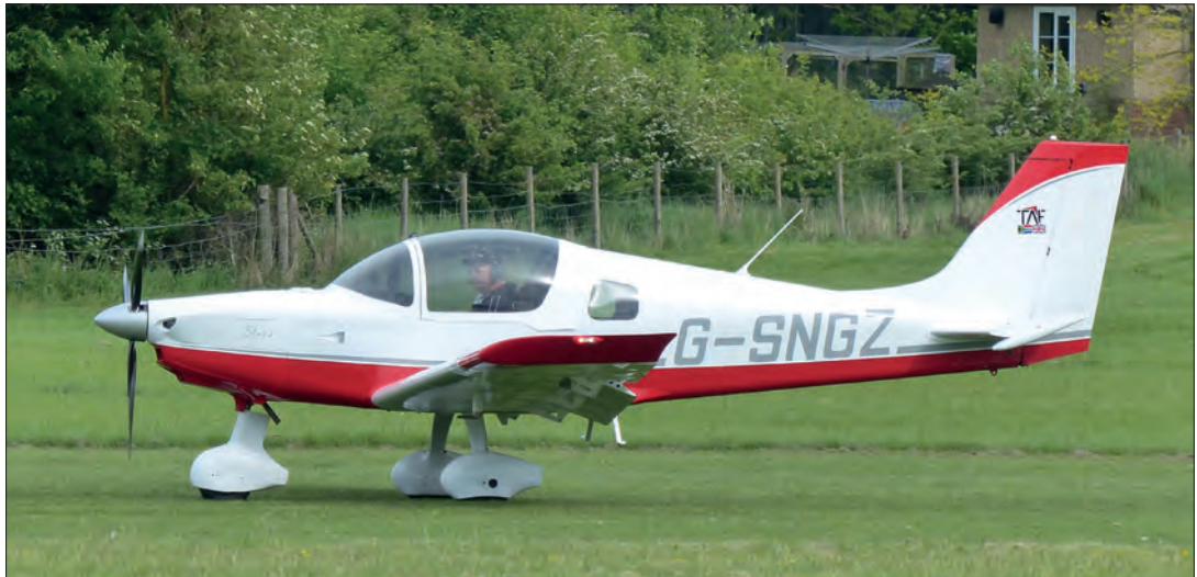
TAF Sling 2 G-SNGZ (LAA 399-15395) at Old Warden on 25th May 2019.

Europa XS: G-OUSD EV-97 Eurostar: G-CCZZ Magni M16C: G-CFXF, G-CGCE, G-CGLF, G-CHDK, G-CIRH, G-CITM, G-CKWR, G-CKZZ, G-DBDB, G-IROJ, G-ITAR, G-JWNW, G-YRON Magni M22: EC-XCM Magni M24C: G-IROX, G-JMBJ, G-MSGI, G-OWLS, G-YROG, G-YROR, G-YROU Piper Cub: G-BHVV/42-38384, G-NCUB RAF2: G-CBIT, G-IYRO TAF Sling 2: G-SNGZ Van's RV-6: G-BZRV Van's RV-10: G-RRVX Wallis WA.116: G-ARRT, G-ARZB Wallis WA.12: G-AVVO Zenith CH.601 Zodiac: G-CEZS