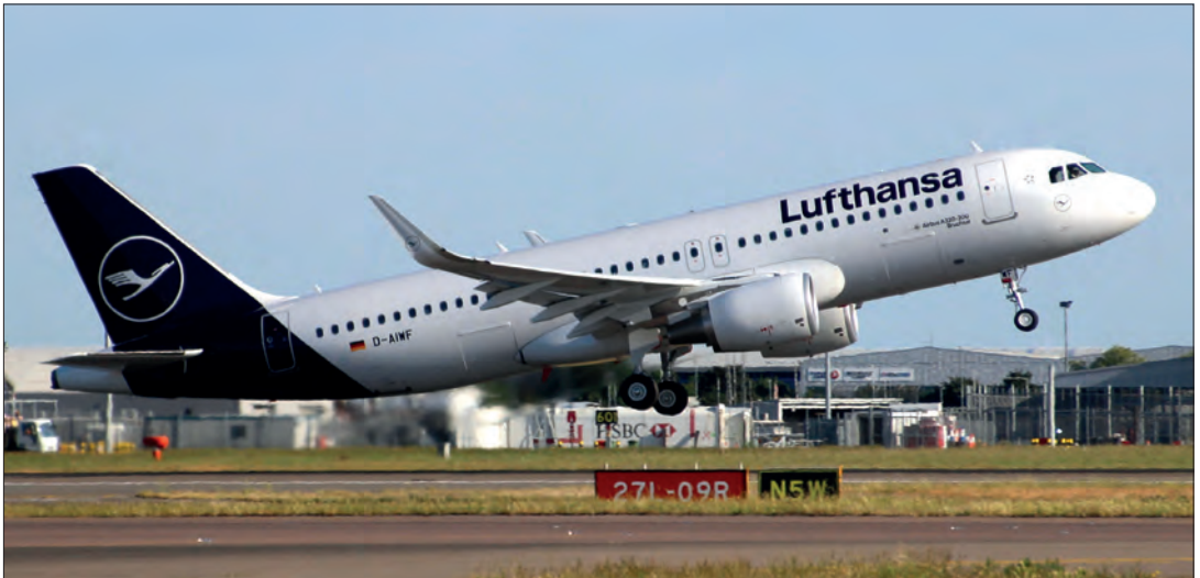
Airbus A320-214 D-AIWF (8853) of Lufthansa at London-Heathrow on 6th June 2019.

re-orientated and more closely aligned with the Network unit as integration into Eurowings will not be further pursued.