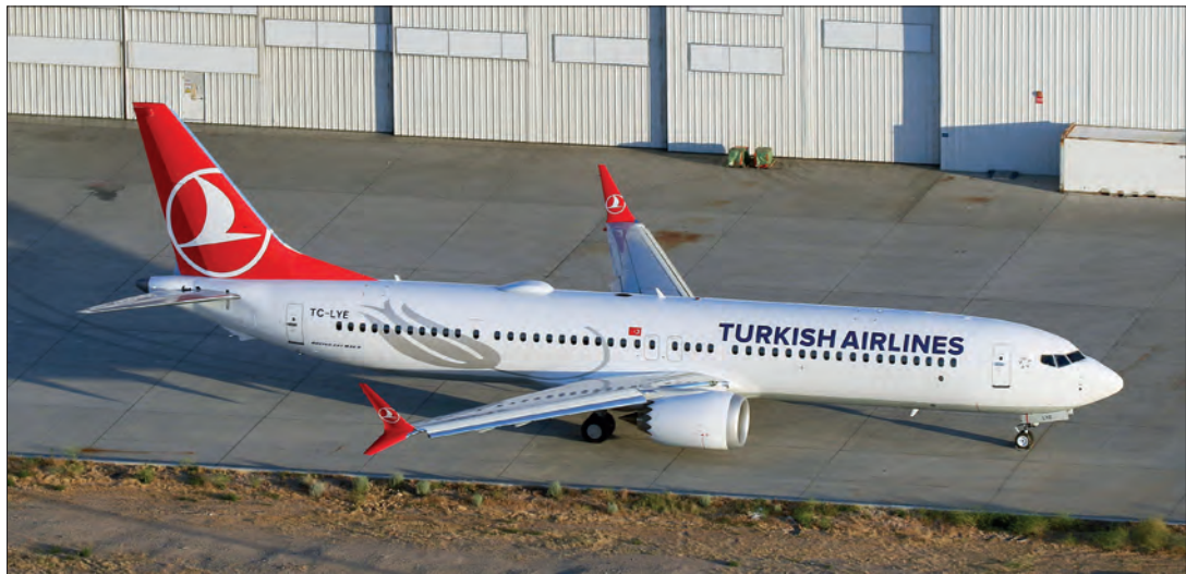
Boeing 737-9 MAX TC-LYE (60066/7580) of Turkish just out of paint at Victorville pending storage. It was photographed on 12th June 2019.