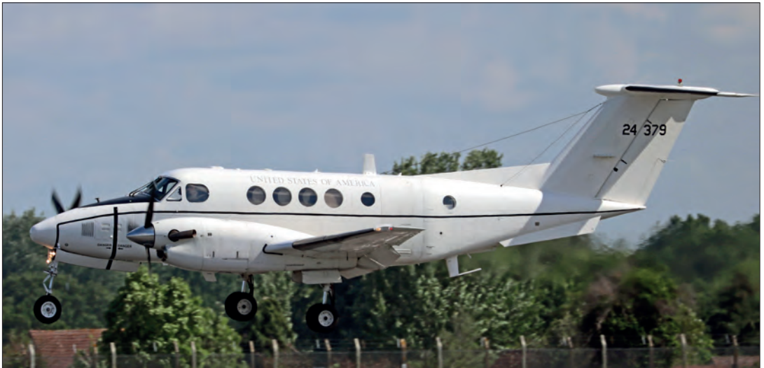
C-12 84-24379 callsign 'Duke 96' at Mildenhall on 31st May 2019.