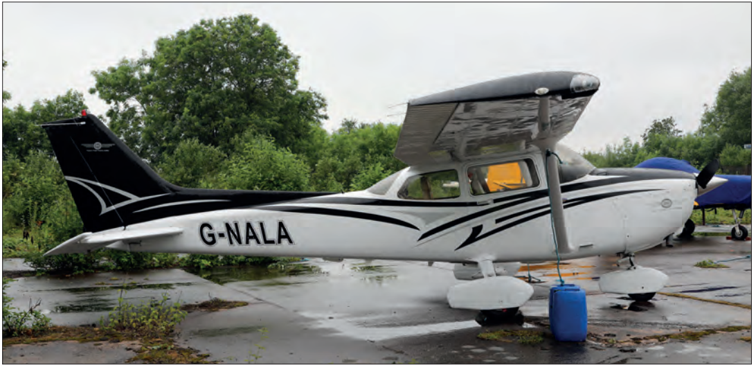
Cessna 172S Skyhawk G-NALA (172S10214), seen at Leicester on 25th June 2019, had been restored to the register the previous day.