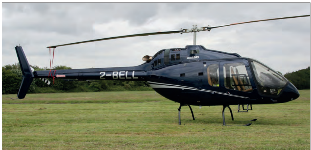
Bell 505 Jet Ranger X 2-BELL (65188) at Wycombe Air Park on 15th June 2019.