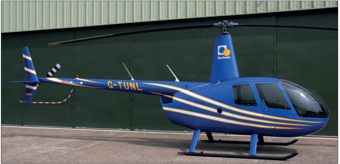
Robinson R-44 Raven II G-TUNL (11628) at Denham on 18th June 2019.