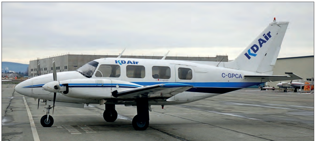
PA-31 Navajo C-GPCA (31-42), seen at Pitt Meadows, British Columbia on 26th December 2017, has recently changed owners.