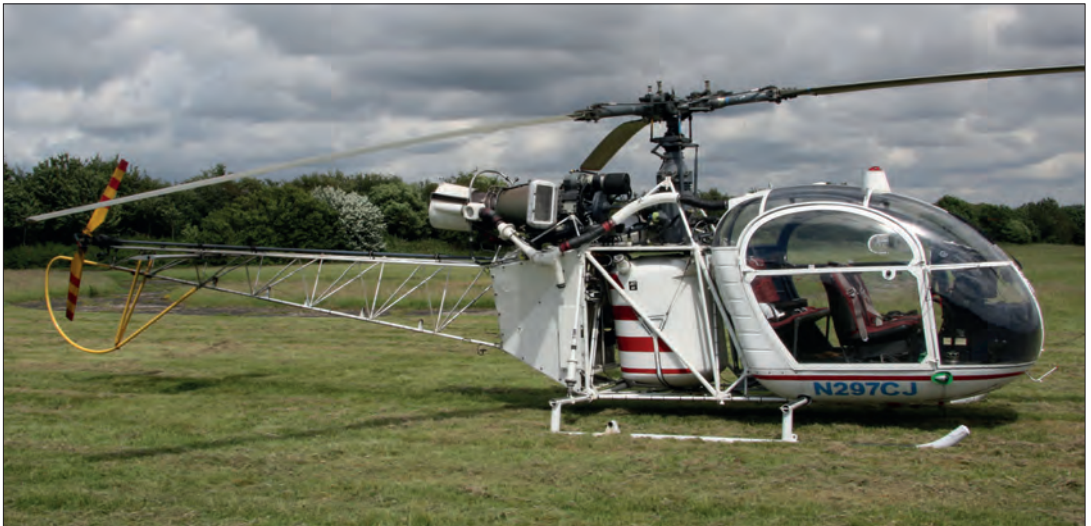
Sud Aviation SE-313B Alouette II N297CJ (1847) at Wycombe Air Park on 14th June 2019.