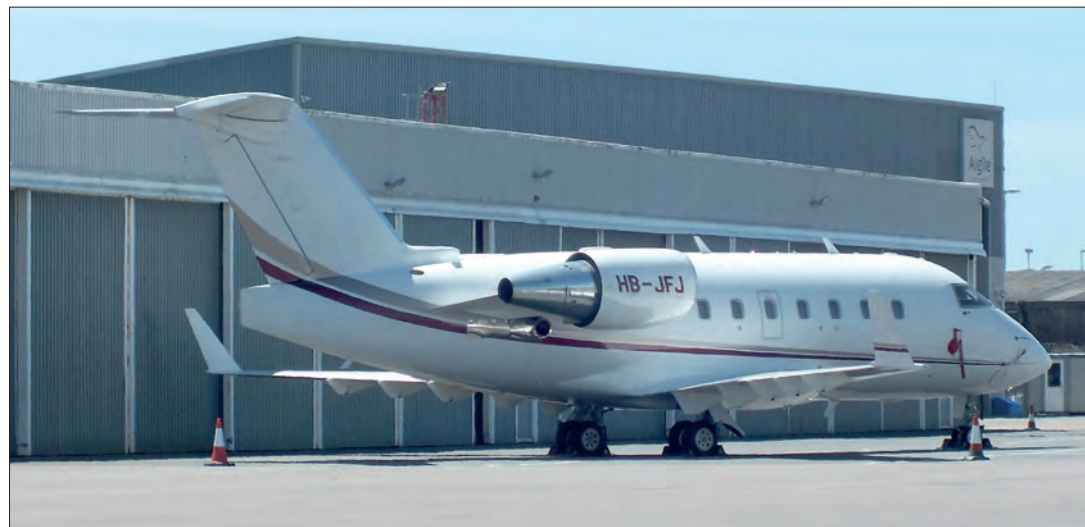
Challenger 604 HB-JFJ (5599) at Guernsey on 31st May 2019 awaiting its change of marks to T7-NMN...