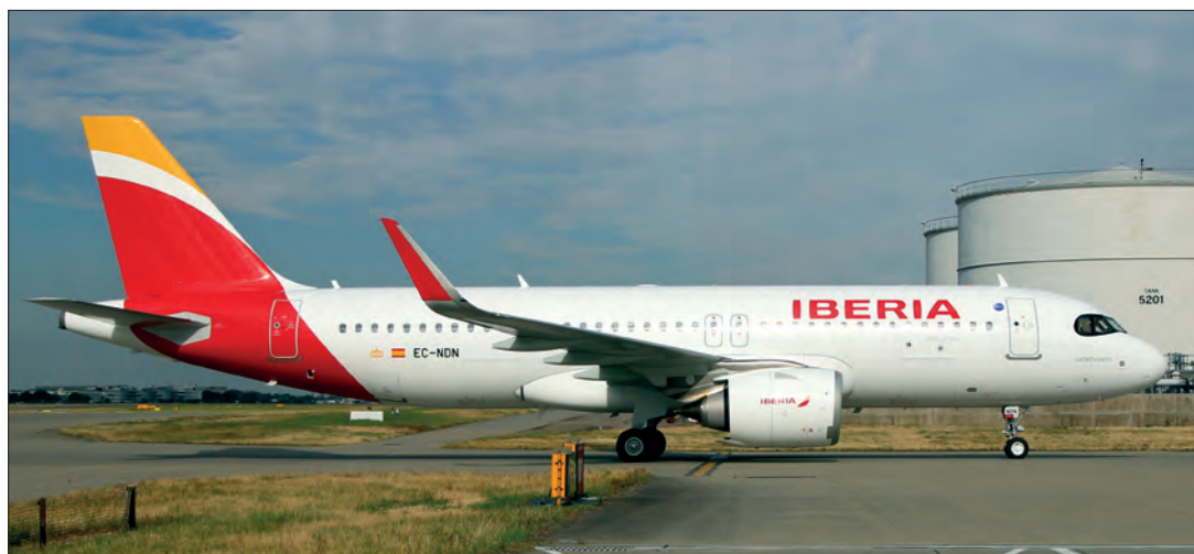
Airbus A320-251N EC-NDN (8939) of Iberia at London-Heathrow on 5th July 2019. [K West]