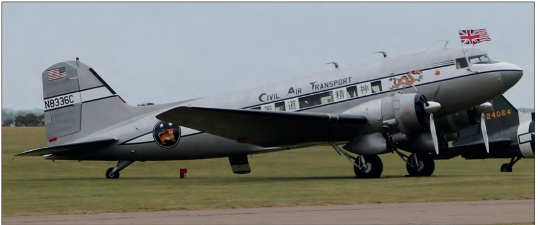
Douglas C-53 N8336C (7313) at Duxford on 4th June 2019.

Taylorcraft Auster AOPV: G-AKSY/TJ534 (1567) Van's RV-7: G-CFET (70686) Westland Apache AH.1: ZJ215 (WAH.49)