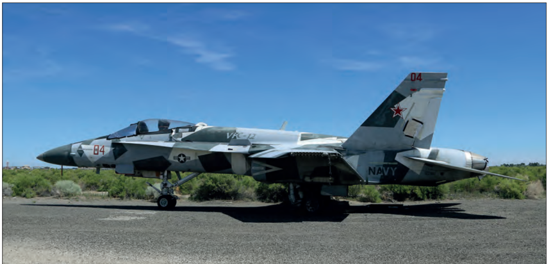
F/A-18A+ 162861/04 of VFC-12, US Navy in rare splinter camo and "Russian" markings has been withdrawn from use at Fallon Naval Air Station, Nevada. 10th June 2019.

ADF Serials, Air Forces Monthly, Scramble, MAR, MSF, Flight Global, Janes, Aviation Safety Database, Airbus Helicopters, F.16-net, NAMAR, ABIX, Touchdown News, C-130.net, AMARC Experience, Defence Blog.