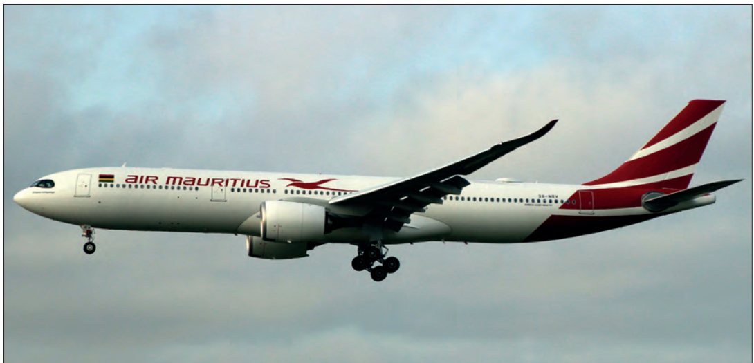
Airbus A330-941N 3B-NBV (1890) of Air Mauritius at London-Heathrow on 28th June 2019.

Air Pohang [South Korea] is still struggling to resume operations, because it lacks the employees to manage the company.