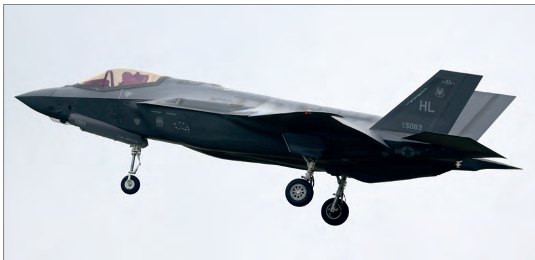
F-35A 13-5083/HL of 34th FS/388th FW 'Rude Rams', call sign 'Trend14', at Lakenheath on 25th June 2019. [Colin Johnson]