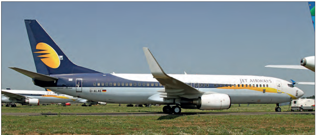
Boeing 737-8FL (WL) D-A LAE (29668/1686) formerly with Jet Airways as VT-JGG was registered to SMBC Aviation Capital in May 2019. It was photographed in storage at Lourdes-Tarbes on 29th June 2019.

The Lufthansa Group announced that its subsidiary Eurowings will focus on short-haul services in future, as its Eurowings long-haul services to be transferred to the Network unit. Brussels Airlines will be