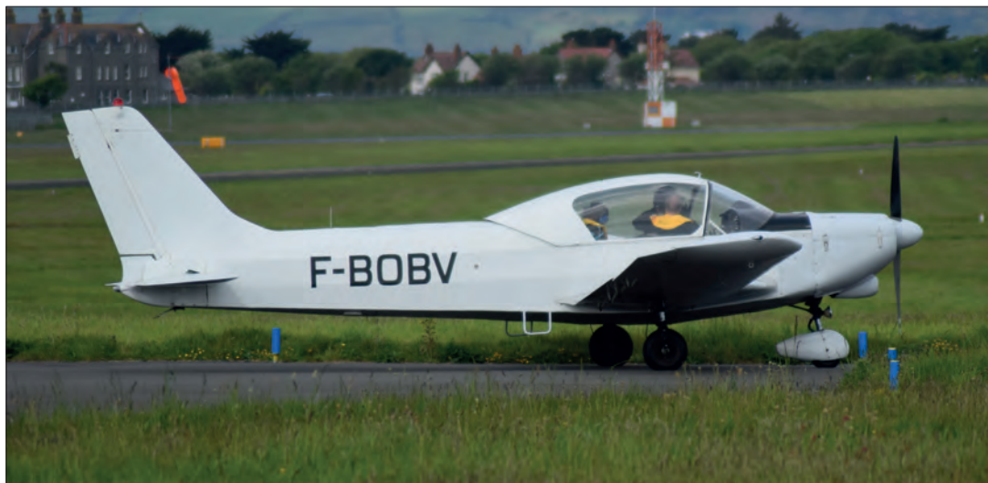
Wassmer WA41 F-BOBV (145) at Isle of Man on 22nd May 2019.