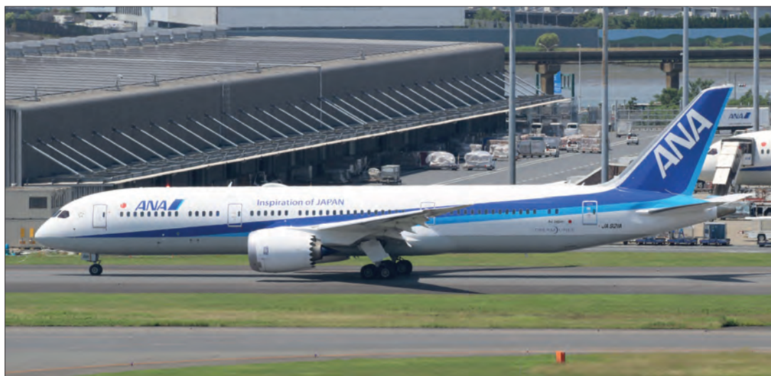
ANA's latest Boeing 787-9 JA921A (c/n 43865, delivered May 30th 2019) taxis for departure from Tokyo-Haneda on 18th June 2019.

HL8335 B737-8JP (39015) Regd to Jeju Air 31.5.19.