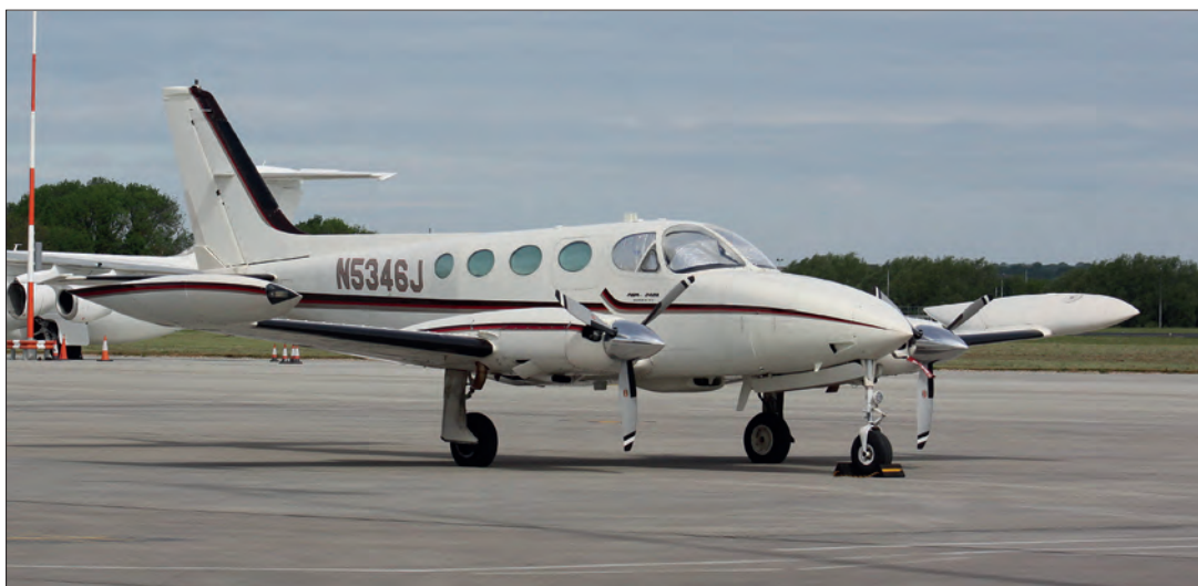
Cessna 340A N5346J (340A0419), at Southend on 26th May 2019.