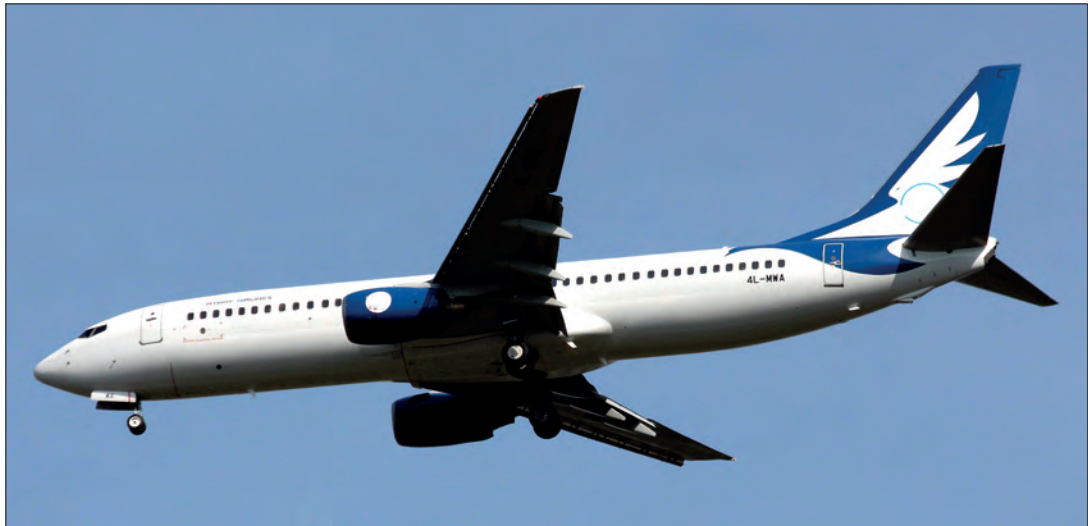
Boeing 737-800 4L-MWA (35073/2197) of MyWay Airlines landing at Manchester on 22nd June 2019, operating for Bulgaria Holidays.