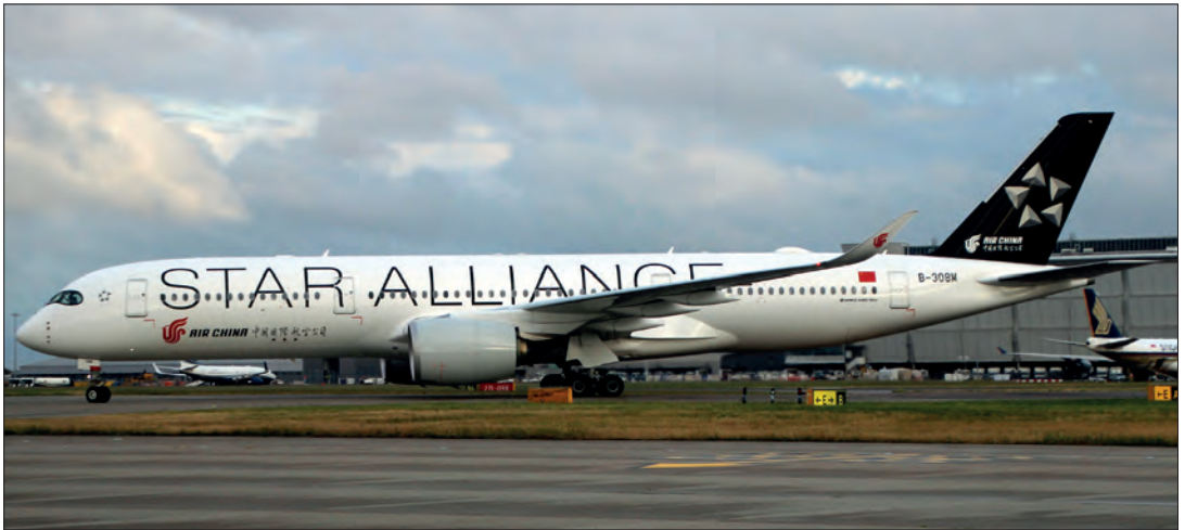
Airbus A350-941 B-308M (311) of Air China/Star Alliance at London-Heathrow on 15th June 2019.