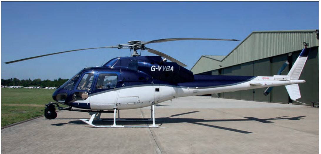
Aerospatiale AS355F2 Ecureuil II G-VVBA (5463) at Denham on 27th June 2019.