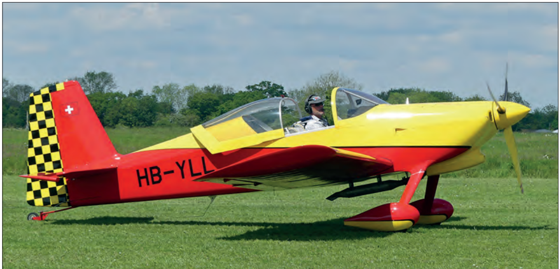
Van's RV-6 HB-YLL (25685) at Old Buckenham on 25th May 2019.

SLAITHWAITE, W. YORKS – Bell 47G-3B-1 N9595B [6528] is based on a private helipad at a house off Holme Lane here. The pad is clearly visible on Google Maps.