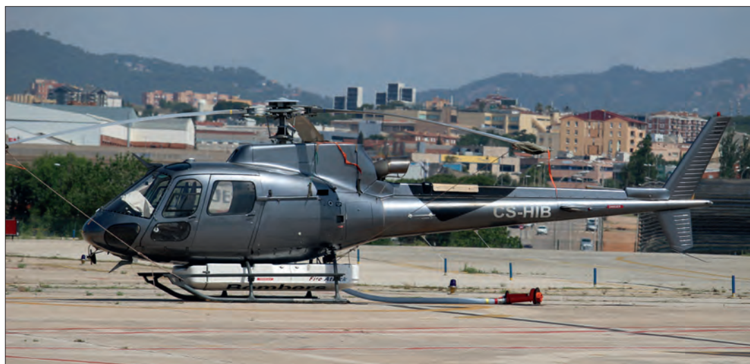
AS350B3 CS-HIB (3702) at Sabadell on 10th June 2019.