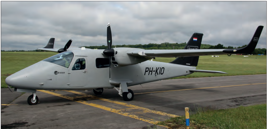
Tecnam P2006T PH-KIO (279) at Wycombe Air Park on 12th June 2019. [Brian G Nichols]

Socata TB-10 Tobago: G-BOIT (810), G-CTCL (1107) Socata TB-20 Trinidad: G-BMIX (579), G-OMAO (378) Socata TB-9 Tampico: G-BKVC (372) Socata TBM 910: N910RW (1220) Socata TBM 940: F-GKCJ (1281) Sonaca 200: OO-XSA (9) Stemme S.12G: D-KIZG (12-022) Stemme S.15-1 ASP: D-EOHB (ASP-031) Stinson HW-75: G-BMSA (7040) Tecnam P2002-JF Sierra: G-UCAN (229) Tecnam P2006T: G-JRER (194), G-OGOL (262), PH-KIO (279) Tecnam P2008 JC: G-JACN (1112) Tecnam P2010 TwentyTen: G-JACL (66), G-TTEN (8) Van's RV-10: G-OMRC (41040) Van's RV-12: PH-SES (120790) Van's RV-4: G-RVIL (?) Van's RV-8: G-IIDD (82814), G-RVTX (82517) Van's RV-9A: G-IINI (?), G-XCRJ (91502) WACO YMF-5C: HB-DMO (F5C-8-153)