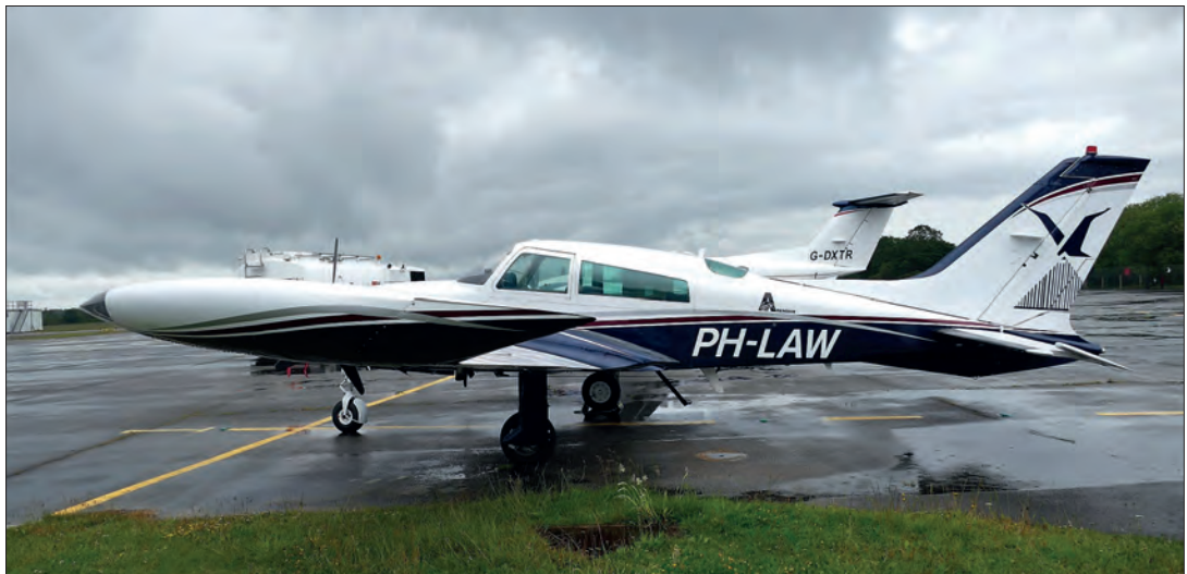
Cessna T310R PH-LAW (310R0096) at Blackbushe on 10th May 2019.

The proposed hangar development has been turned down because of an objection by the airport. The new hangars would block the view