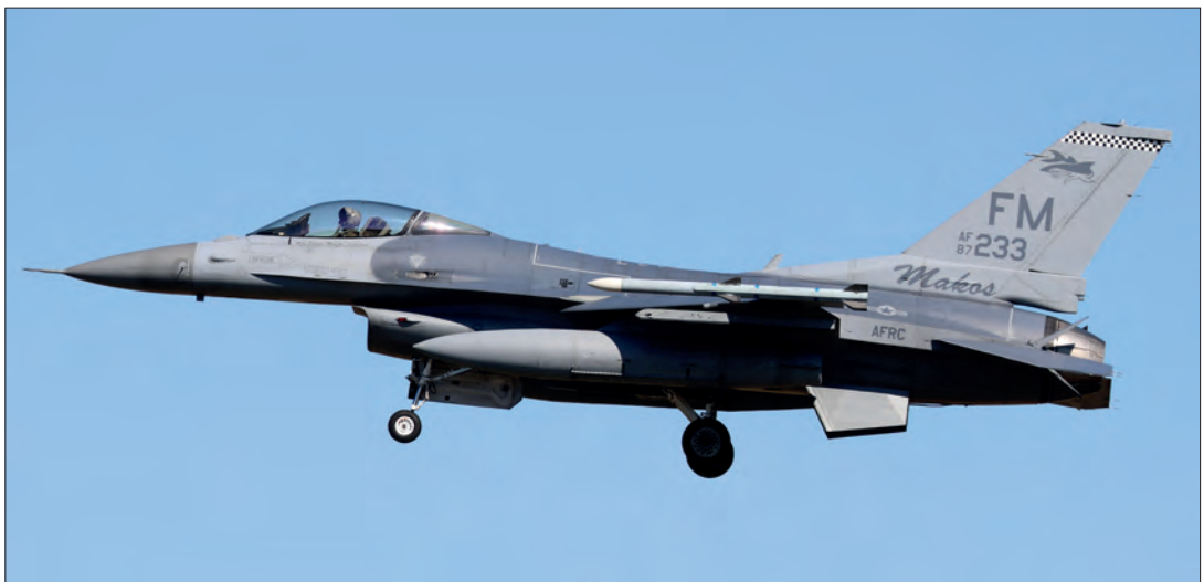
F-16C 87-0233/FM of 93rd FS/482nd FW, AFRC at Lakenheath on 13th May 2019.