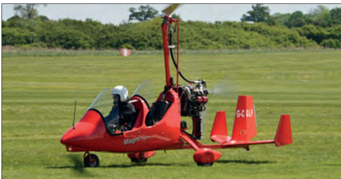
Magni M16C Tandem Trainer G-CGLF (16095614) at Old Warden on 25th May 2019.

Autogyro Calidus: G-CGLY, G-CIKG, G-CJTC, G-GYRA, G-LISS, G-MRLS, G-PCPC, G-PPBZ Autogyro Cavalon: G-CHWM, G-CIHW, G-CLDV, G-EVAA, G-MUDX, G-OTZZ, G-RDNY, G-SJEF Autogyro MT-3: G-CFGG, G-CFGY, G-CFKA, G-COLI, G-DADA, G-JBRE Autogyro MTOsport: G-CGGW, G-CGIX, G-CGZM, G-CICV, G-CIRT, G-CKYD, G-HHMH, G-HOTC, G-IGLL, G-KBOJ, G-KIMH, G-PAFF, G-PALT, G-RARA, G-YROA Comco C-42 Ikarus: G-CEGL, G-CIXY DHC-1: G-BBND/WD286, G-BCCG/WP903