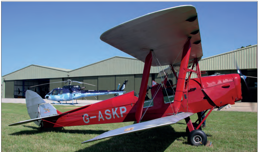
DH 82A Tiger Moth G-ASKP (3889) at Denham on 27th June 2019.