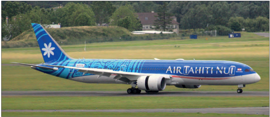
Boeing 787-9 N1015X/F-OVAA (62710/847) of Air Tahiti Nui at Le Bourget on 13th June 2019.