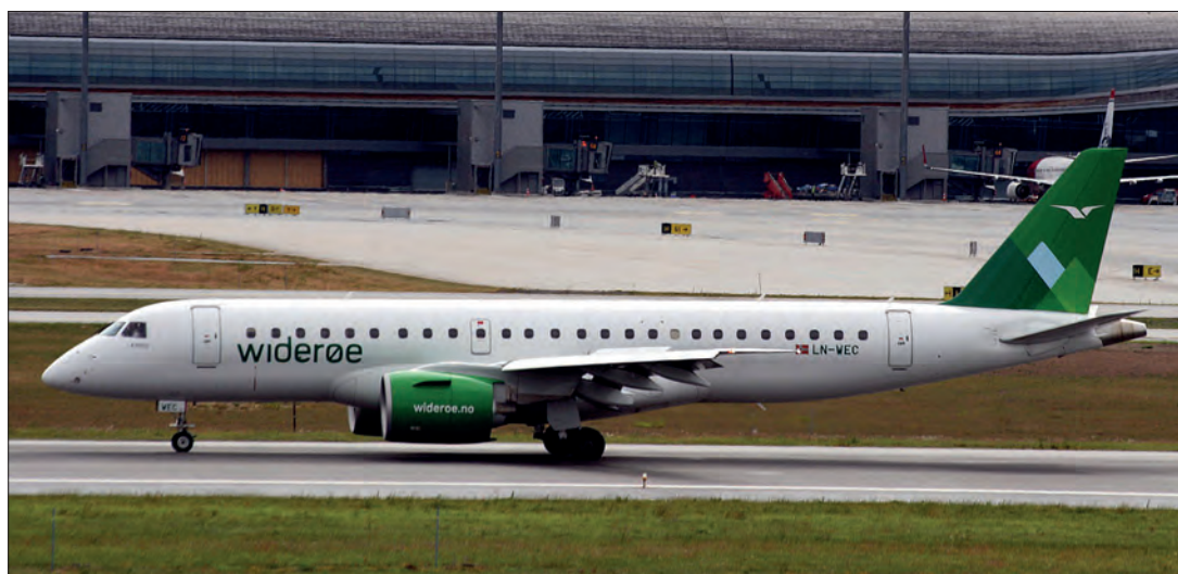
Embraer 190E2 LN-WEC (19020011) of Wideroe at Oslo on 7th July 2019. [Erik Oxtorp]