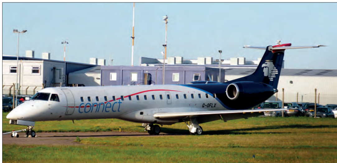
Embraer EMB-145LR G-OFLX (145588) was registered to BAE Systems on 25th June 2019 and is seen at East Midlands Airport two days later.