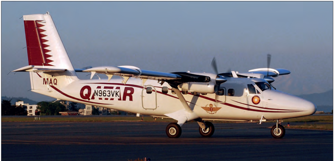
DHC-6-400 N963VK (963), destined for the Qatar Air Force as MAQ, is seen at Victoria, British Columbia on 31st May 2019.