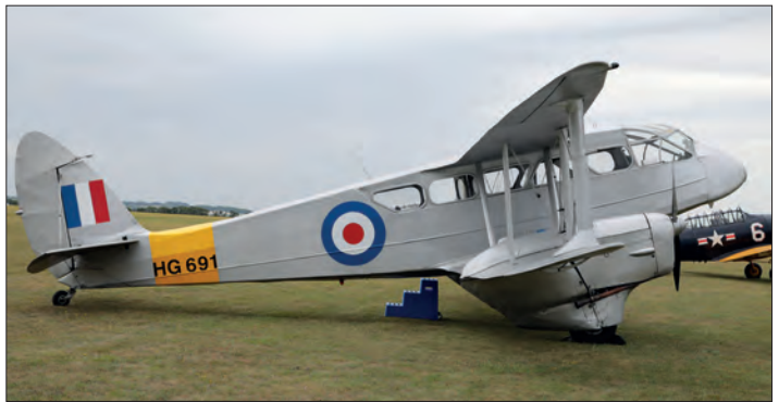
de Havilland DH.89A Dragon Rapide 6 G-AIYR/HG691 (6676) at Duxford on 4th June 2019.

Agusta-Bell 47G-3B-1 Sioux AH.1: G-CICN/XT131 Auster AOP.6: G-BNGE/TW536 Auster AOP.9 : G-CICR/XR244 AutoGyro Europe/Rotorsport UK Calidus: G-DISP Bowers Fly Baby 1A/1B: G-BNPV/1801/18 Britten-Norman BN-2B-20 Islander: G-CKYK Britten-Norman BN-2T Islander: G-JSAT Britten-Norman BN-2T Islander AL.1: G-DLRA Britten-Norman BN-2T-4S Islander: G-WPNS Cessna 182R Skylane/Porche FTB: G-ESSL Cirrus SF50 Vision: 2-AUER Comco-Ikarus C42 FB80: G-PAPI (9th only) De Havilland DHC-1 Chipmunk: G-BXGP/WZ882 Douglas C-47A-75-DL: N473DC/2100882/3X-P (8th) Fairchild 24 R46A: G-RGUS/K527 (8th only) Fokker DR.1 Triplane (Replica): G-CFHY/556/17 Hawker Hunter GA.11 (cockpit only): WV381 Lockheed P-3C CUP: 60+01 German Navy North American P-51D Mustang: G-SIJJ/A3-3 Piper PA-28-151 Cherokee Warrior: G-BCIR Piper PA-28-161 Cherokee Warrior: G-BMFP Piper PA-28-181 Cherokee Archer: G-BWUH Reims/Cessna F172N Skyhawk: G-BEWR Royal Aircraft Factory BE.2C (Replica): G-AWYI/687 Scottish Aviation Bulldog T.1: G-DOGG/XX638 (8th only), G-KDOG/XX624