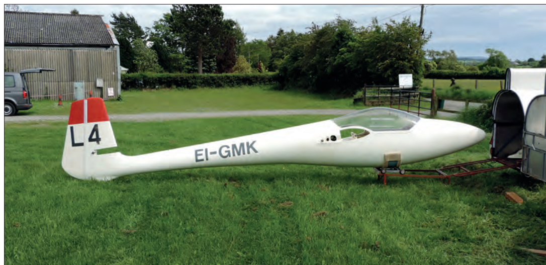
H201B Standard Libelle EI-GMK (509) at Gowran Grange on 3rd June 2019.