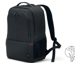
Eco Backpack Plus BASE