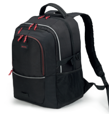
Backpack Plus SPIN