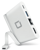
USB-C Portable Docking 4-in-1 with HDMI