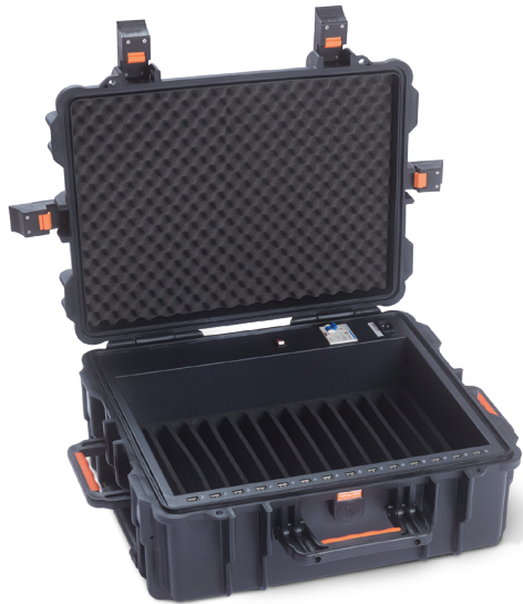
Charging Case Trolley 14 Tablets