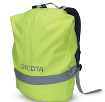
Backpack Rain Cover Universal