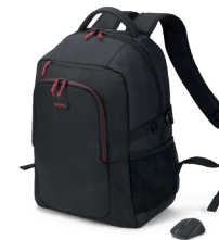
Backpack Gain Wireless Mouse Kit