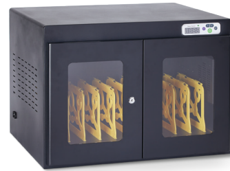
Charging Cabinet 10 Laptops/Tablets