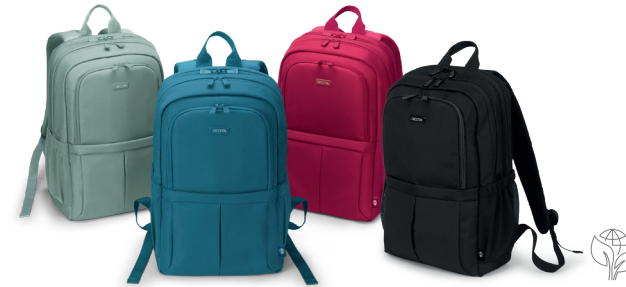
Eco Backpack SCALE