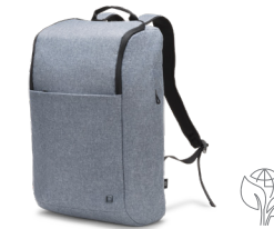
Eco Backpack MOTION