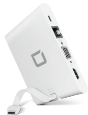
Docking 9-in-1 with HDMI