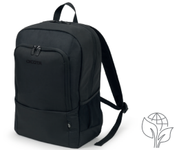
Eco Backpack BASE