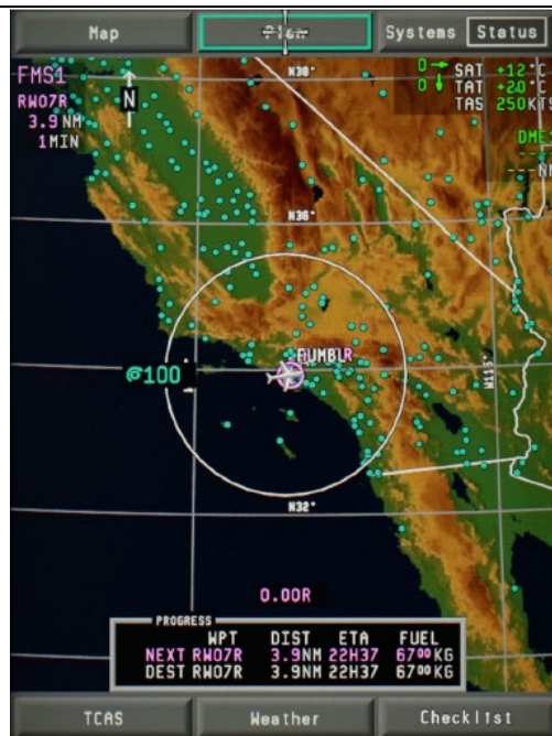
Figure 3-2 Interactive Navigation Display