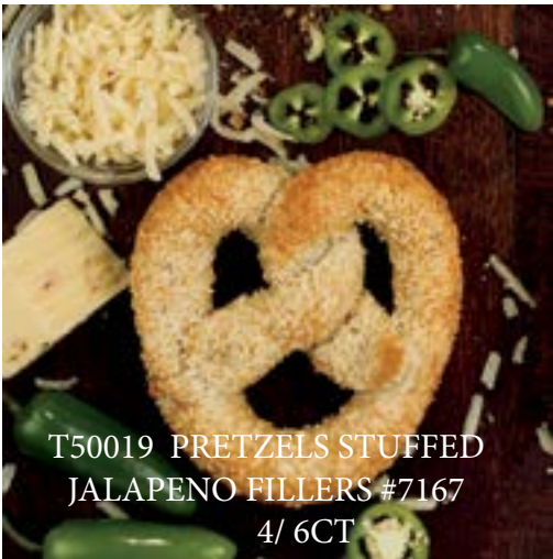
T50019 PRETZELS STUFFED JALAPENO FILLERS #7167 4/ 6CT