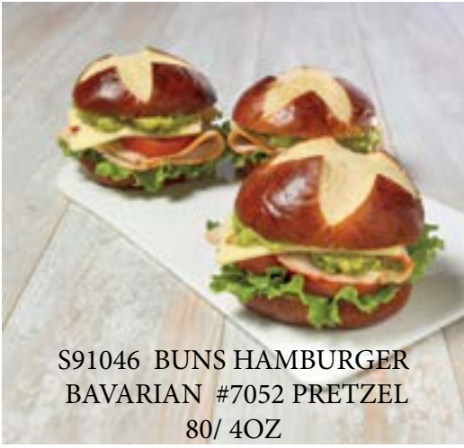
S91046 BUNS HAMBURGER BAVARIAN #7052 PRETZEL 80/ 4OZ