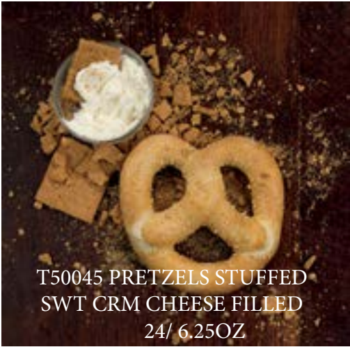
T50045 PRETZELS STUFFED SWT CRM CHEESE FILLED 24/ 6.25OZ