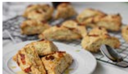
Sugardale---Maple Bacon Scones