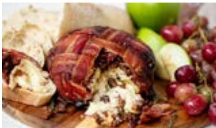
Sugardale---Bacon Wrapped Brie