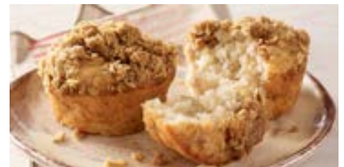
Pacific Northwest Canned Pears Pear Banana Muffins