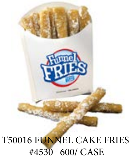
T50016 FUNNEL CAKE FRIES #4530 600/ CASE