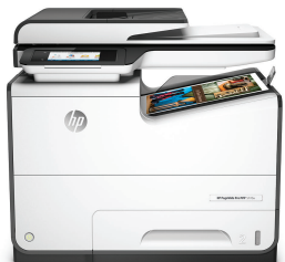
HP PageWide Pro 577dw Multifunction Printer