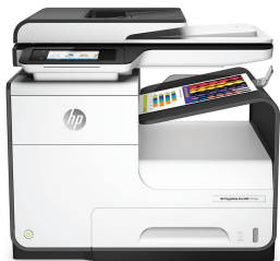
HP PageWide Pro 477dw Multifunction Printer

Ultimate value and speed—HP PageWide Pro delivers the lowest total cost of ownership and fastest speeds in its class. 1,2 Get quick two-sided scanning, plus best-in-class security features and energy efficiency. 3,4