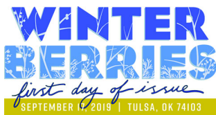
Digital Color Pictorial

Locally produced items are not authorized. Only merchandise that has been approved and assigned an item number by Headquarters Retail Marketing may be produced and sold.