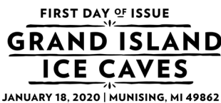
Black and White Pictorial

USPS Stamp Fulfillment Services May 18, 2020 8300 NE Underground Drive, Suite 300 Kansas City, MO 64144-9900