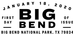
Black and White Pictorial

USPS Stamp Fulfillment Services May 18, 2020 8300 NE Underground Drive, Suite 300 Kansas City, MO 64144-9900