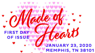
Digital Color Pictorial

USPS Stamp Fulfillment Services May 18, 2020 8300 NE Underground Drive, Suite 300 Kansas City, MO 64144-9900