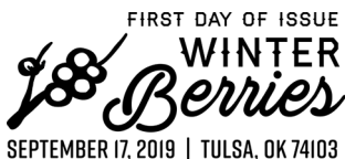
Black and White Pictorial

USPS Stamp Fulfillment Services 8300 NE Underground Drive, Suite 300 Kansas City, MO 64144-9900 January 17, 2020