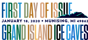
Digital Color Pictorial

USPS Stamp Fulfillment Services May 18, 2020 8300 NE Underground Drive, Suite 300 Kansas City, MO 64144-9900