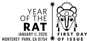
Black and White Pictorial

USPS Stamp Fulfillment Services May 11, 2020 8300 NE Underground Drive, Suite 300 Kansas City, MO 64144-9900