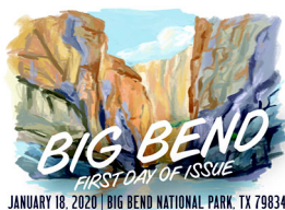
Digital Color Pictorial

USPS Stamp Fulfillment Services May 11, 2020 8300 NE Underground Drive, Suite 300 Kansas City, MO 64144-9900