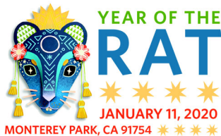
Digital Color Pictorial