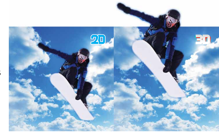
2D-to-3D image conversion

Experience your entire video collection from a whole new perspective. The SP8600HD3D's built-in 2D-to-3D conversion can transform any 2D material into 3D sequential format, immersing you in the scene like never before.