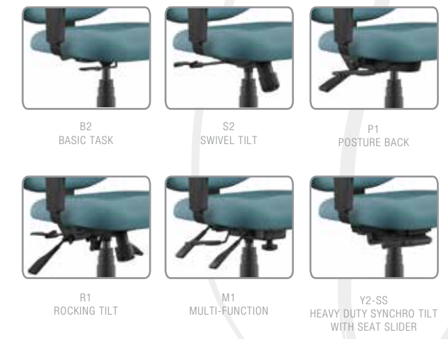
B2 BASIC TASK S2 SWIVEL TILT P1 POSTURE BACK R1 ROCKING TILT M1 MULTI-FUNCTION Y2-SS HEAVY DUTY SYNCHRO TILT WITH SEAT SLIDER