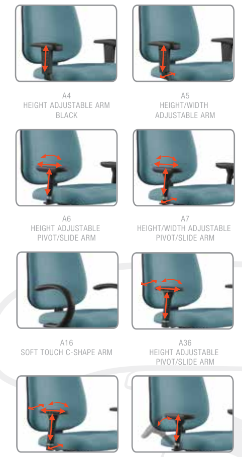
A4 HEIGHT ADJUSTABLE ARM BLACK A5 HEIGHT/WIDTH ADJUSTABLE ARM A6 HEIGHT ADJUSTABLE PIVOT/SLIDE ARM A7 HEIGHT/WIDTH ADJUSTABLE PIVOT/SLIDE ARM A16 SOFT TOUCH C-SHAPE ARM A36 HEIGHT ADJUSTABLE PIVOT/SLIDE ARM A37 HEIGHT/WIDTH ADJUSTABLE PIVOT/SLIDE ARM A90 HEIGHT ADJUSTABLE BREAKAWAY ARM (MID-BACK ONLY)