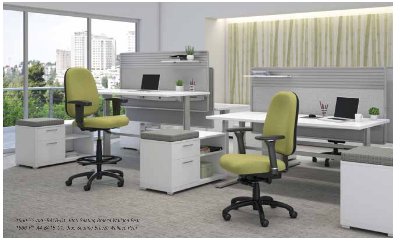
1660-Y2-A36-BA1B-C1; 9to5 Seating Breeze Wallace Pear 1666-P1-A4-BA1B-C1; 9to5 Seating Breeze Wallace Pear