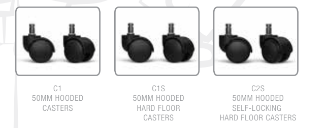
C1 50MM HOODED CASTERS C1S 50MM HOODED HARD FLOOR CASTERS C2S 50MM HOODED SELF-LOCKING HARD FLOOR CASTERS