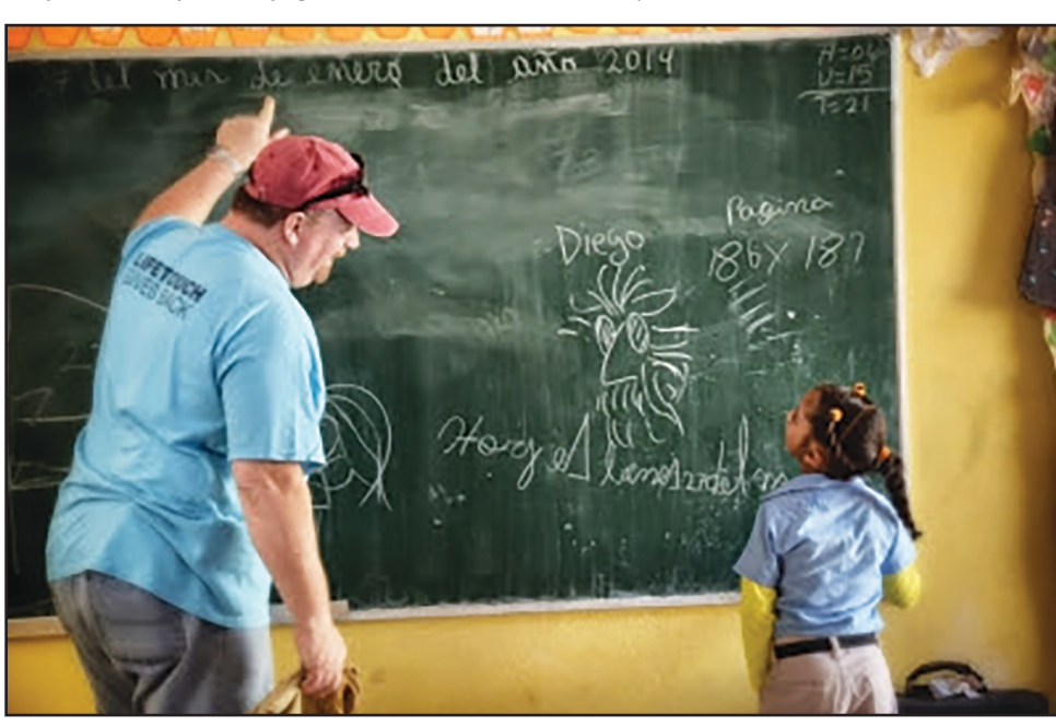
Having good facilities for educational purposes is vitally important in areas like the Dominican Republic.

To learn more about the Lifetouch Memory Missions visitwww.lifetouchmemorymission.com