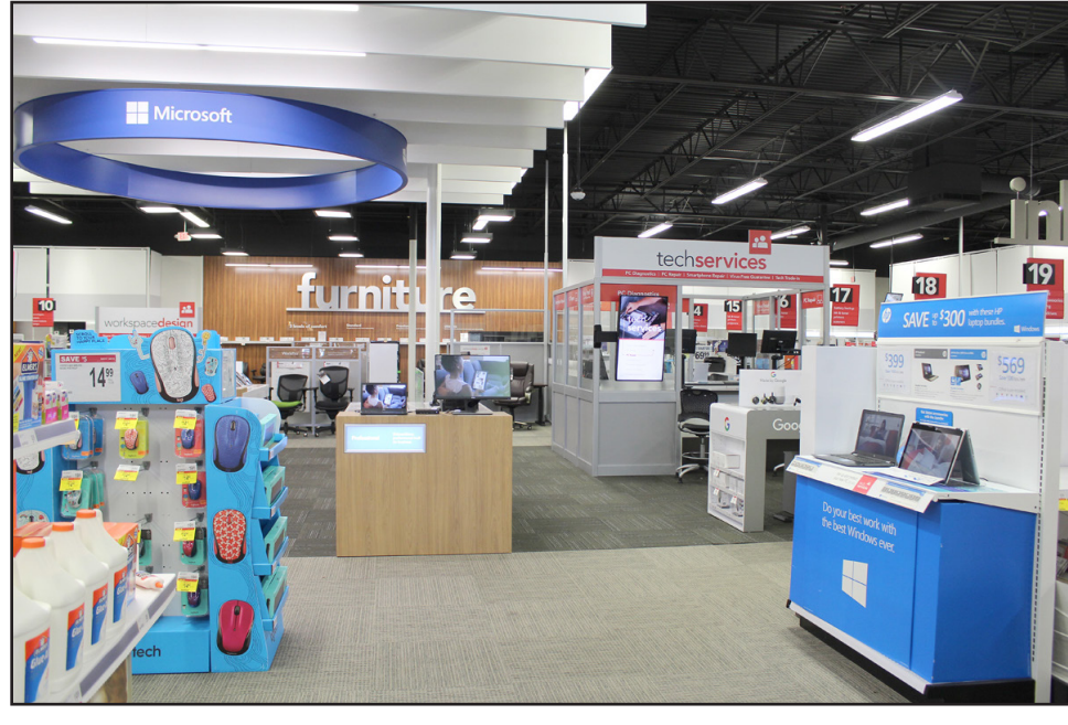
Laurel's Office Depot store of the future includes a brightly lit store with an open concept.