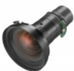
VPLL-Z3009 Short focus zoom lens