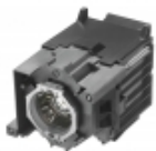
LMP-F370 Replacement Lamp for the VPL-F Series