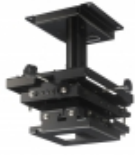
PSS-650 Projector Ceiling Bracket for Installation