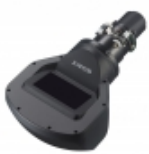
VPLL-3003 Projection Lens for the VPL-F Series