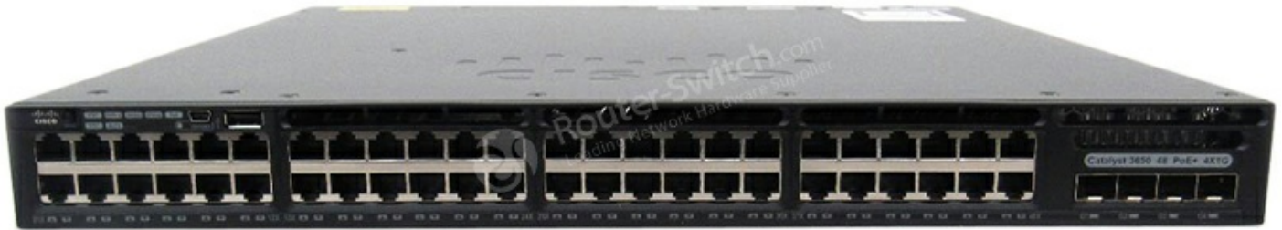
Table 1 shows the Quick Specs.

Figure 1 shows the appearance of WS-C3650-48PS-S.