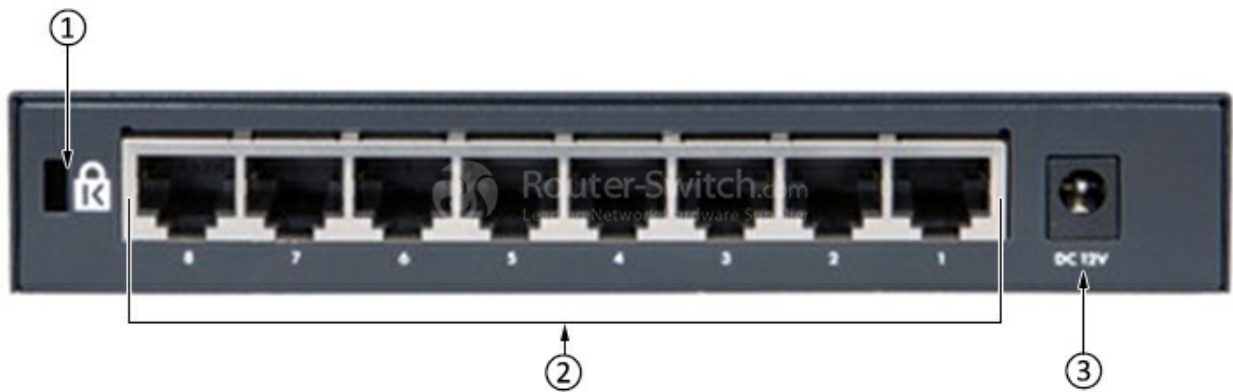
Figure 3 shows the back panel of HPE JH329A.