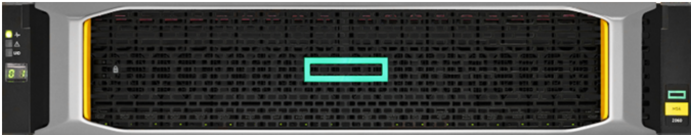
HPE MSA 2062 Storage

Looking for seriously simple and affordable flash storage? The HPE MSA 2062 Storage is a flash-enabled system designed for affordable application acceleration for small and remote office deployments. Don't let the low cost fool you. The MSA 2062 gives you the combination of simplicity, flexibility and advanced features you many not expect in an entry-priced storage array. Starting with 3.84 TB of embedded flash capacity, you can scale the system from there with any combination of solid state disks (SSD), high-performance Enterprise SAS HDDs, or lower-cost Midline SAS HDDs. Capable of delivering in excess of 325,000 IOPS, the MSA 2062 saves you up to 32% with an all-inclusive software suite and 3.84TB of flash capacity included. It's seriously simple and affordable flash storage to help you achieve high performance yet meet challenging budgets.