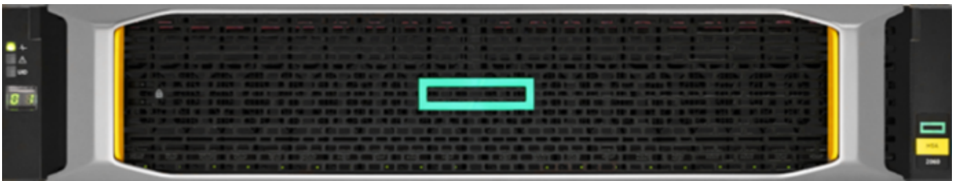
HPE MSA 1060 Storage

Designed to meet entry-level storage requirements, the HPE MSA 1060 Storage is a good fit for budget constrained customers. With one of the lowest entry price points in the Hewlett Packard Enterprise Storage portfolio and field-proven HPE ProLiant compatibility, the HPE MSA 1060 Storage is the platform of choice for smaller IT workloads. The HPE MSA 1060 Storage features 10GBASE-T iSCSI, Fibre Channel and SAS host interface connectivity at previously unattainable entry price points. The MSA 1060 allows users to take advantage of the latest storage technologies while also providing a balance between performance and budget.