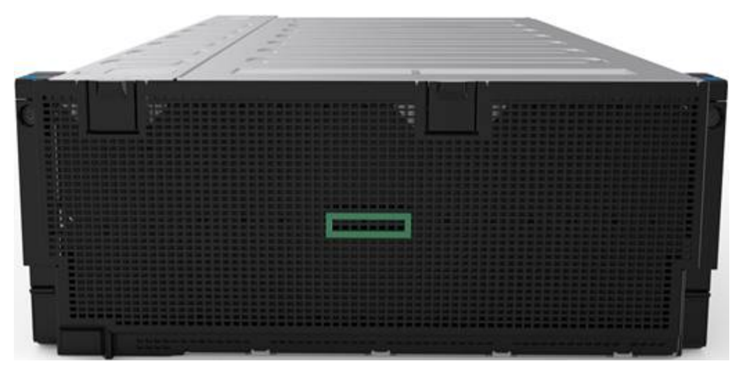
HPE D8000 Disk Enclosure Front View

The D8000 Disk Enclosure can be connected to ProLiant Gen10 servers using the HPE Smart Array E208e-p SR Gen10 Controller or the P408e-p SR Gen10 Controller. Two D8000 enclosures can be daisy-chained together to provide support for up to 211 drives.