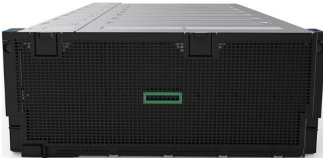
HPE D8000 Disk Enclosure Front View

The D8000 Disk Enclosure can be connected to ProLiant Gen10 servers using the HPE Smart Array E208e-p SR Gen10 Controller or the P408e-p SR Gen10 Controller. Two D8000 enclosures can be daisy-chained together to provide support for up to 211 drives.