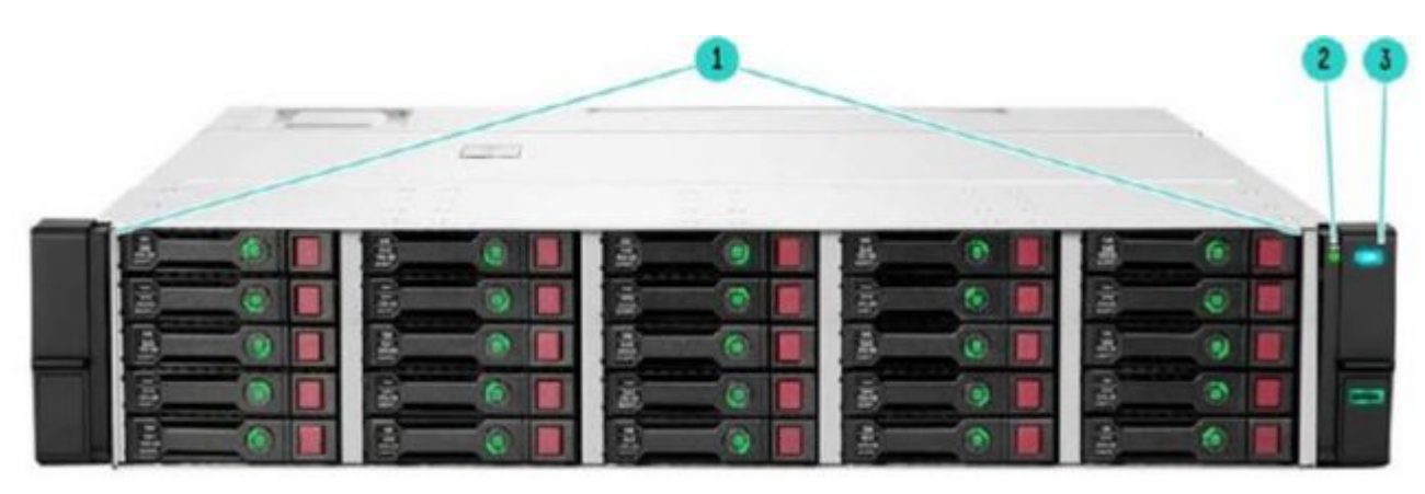
HPE D3000 Enclosure (SFF)

HPE H222 and the H241 Host Bus Adapters are also supported with the D3600/D3700 Enclosures. With the H241 HBA and the P741m (in HBA mode) deployment of software defined storage such as Microsoft Storage Spaces can be enabled with Gen9 servers. See the <u>Windows Server Catalog</u> for the latest supported configurations. The HPE D3000 Enclosures support HPE SmartDrive Carrier (Gen8 HPE ProLiant drives). Total support can grow as needed to up to 96 LFF drives or 200 SFF drives.