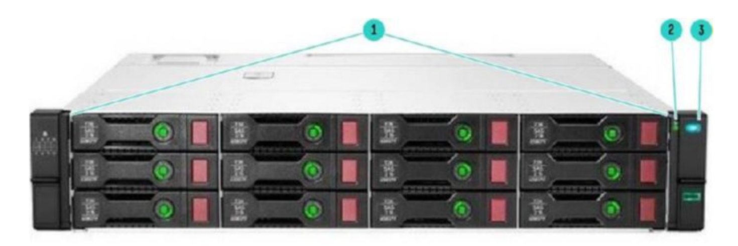
HPE D3000 Enclosure (LFF) HPE D3000 Enclosure (Large and Small Form factor Features)