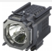
LKRM-U330S Replacement lamp for the LKRM-U330 x6 pack