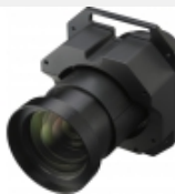
LKRL-Z514 Superb 4K Lens for the SRX-T615, SRX-R515P and SRX-R510P