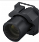
LKRL-Z519 Superb 4K Lens for the SRX-T615, SRX-R515P and SRX-R510P