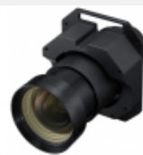
LKRL-Z511 Superb 4K Lens for the SRX-T615, SRX-R515P and SRX-R510P