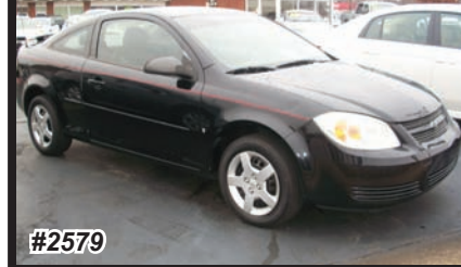
2007 CHEVY COBALT