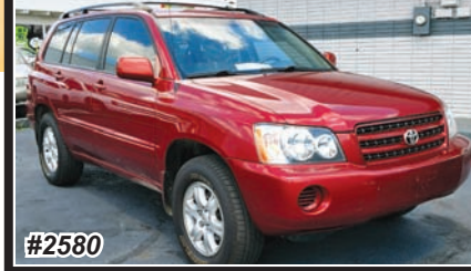
2003 TOYOTA HIGHLANDER