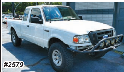
2007 FORD RANGER