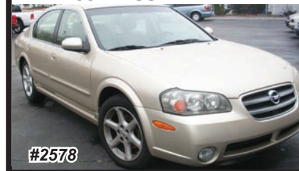
2002 NISSAN MAXIMA