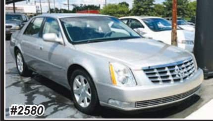
2006 CADILLAC DTS