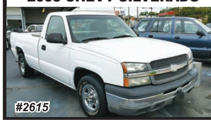
2003 CHEVY SILVERADO