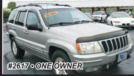
2000 JEEP GR. CHEROKEE