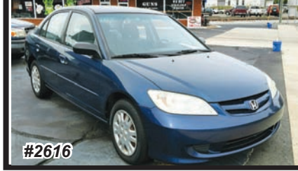
2004 HONDA CIVIC