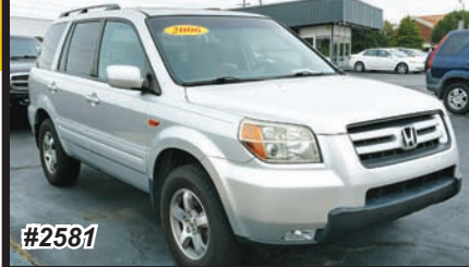
2006 HONDA PILOT