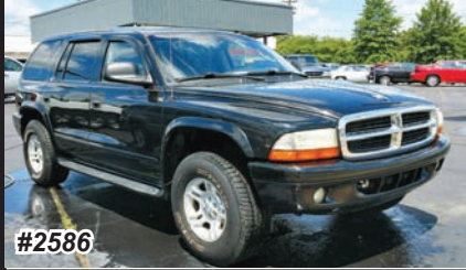
2002 DODGE DURANGO