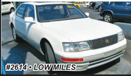
1996 LEXUS CLASSIC