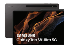
Samsung Galaxy Tab S8 Ultra

SSG-PSMX900NZAATHL (Graphite) SSG-PSMX906BZAATHL (Graphite)