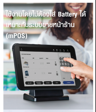
ใช้งานโดยไม่ต้องใส่ Battery ได้ เหมาะกับระบบขายหน้าร้าน (mPOS)