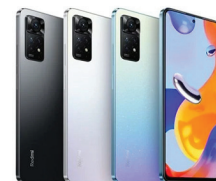
Redmi Note 11 Pro (8/128)

XMI-6934177771378 (Graphite Gray) XMI-6934177771385 (Pearl White) XMI-6934177771323 (Twilight Blue)