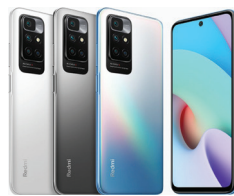
Redmi 10 (2022) (4/128)

XMI-6934177774478 (Graphite Gray) XMI-6934177774423 (Mint Green) XMI-6934177774362 (Ocean Blue) XMI-6934177774348 (Graphite Gray) XMI-6934177774447 (Ocean Blue) XMI-6934177774454 (Mint Green)