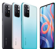
Redmi Note 11 (6/128)

XMI-6934177767173 (Graphite Gray) XMI-6934177768163 (Twilight Blue)