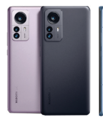
Xiaomi 12 Pro (12+256)

XMI-6934177755613 (Blue) XMI-6934177763625 (Gray) XMI-6934177763700 (Purple) XMI-6934177763618 (Gray) XMI-6934177763724 (Blue) XMI-6934177764004 (Purple)