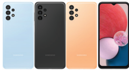
Samsung Galaxy A13 LTE (4/128GB)

SSG-PSMA135FLBHHTL (Blue) SSG-PSMA135FZKHHTL (Black) SSG-PSMA135FZOHTL (Peach)