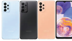
Samsung Galaxy A23 LTE (6/128GB)

SSG-PSMA235FLBHHTL (Blue) SSG-PSMA235FZKHHTL (Black) SSG-PSMA235FZOHTL (Peach)