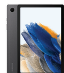
Samsung Galaxy Tab A8 (LTE) 4/64GB

SSG-PSM205NZAETHL (Gray) SSG-PSM205NIDETHL (Pink Gold)