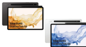
Samsung Galaxy Tab S8

SSG-PSMX700NZAATHL (Graphite) SSG-PSMX700NZSATHL (Silver) SSG-PSMX706BZAATHL (Graphite) SSG-PSMX706BZSATHL (Silver)