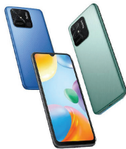
Redmi 10C (4/128)

XMI-6934177774478 (Graphite Gray) XMI-6934177774423 (Mint Green) XMI-6934177774362 (Ocean Blue) XMI-6934177774348 (Graphite Gray) XMI-6934177774447 (Ocean Blue) XMI-6934177774454 (Mint Green)