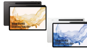
Samsung Galaxy Tab S8+

SSG-PSMX800NZAATHL (Graphite) SSG-PSMX800NZSATHL (Silver) SSG-PSMX806BZAATHL (Graphite) SSG-PSMX806BZSATHL (Silver)