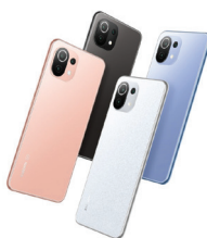
Xiaomi 11 Lite 5G NE

XMI-6934177770616 (Atlantic Blue) XMI-6934177770852 (Graphite Gray) XMI-6934177770289 (Polar White) XMI-6934177770395 (Polar White) XMI-6934177770579 (Atlantic Blue) XMI-6934177770746 (Graphite Gray)