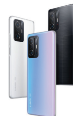
Xiaomi 11 T Pro (8/256)

XMI-6934177750823 (Meteorite Gray) XMI-6934177750670 (Meteorite Gray) XMI-6934177750946 (Moonlight White) XMI-6934177750694 (Moonlight White) XMI-6934177751035 (Celestial Blue) XMI-6934177750724 (Celestial Blue)