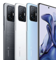
Xiaomi 11 T (8/256)

XMI-6934177754012 (Bubblegum Blue) XMI-6934177753855 (Bubblegum Blue) XMI-6934177754111 (Snowflake White) XMI-6934177754005 (Snowflake White) XMI-6934177754647 (Truffle Black) XMI-6934177754630 (Truffle Black) XMI-6934177754739 (Peach Pink) XMI-6934177754562 (Peach Pink)