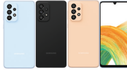
Samsung Galaxy A33 5G (8/128GB)

SSG-PSMA336ELBHHTL (Blue) SSG-PSMA336EZKHHTL (Black) SSG-PSMA336EZOHTL (Peach)