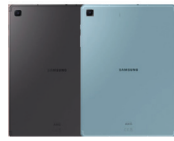
Samsung Galaxy Tab S6 Lite/64GB LTE

SSG-PSMP613NZAATHL (Gray) SSG-PSMP613NZBATHL (Blue) SSG-PSMP613NZIATHL (Pink)