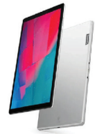
TAB M10 TB-X306X LNV-ZA6V0098TH