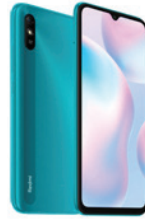
Redmi 9A (32)

XMI-6934177764592 (Black) XMI-6934177791260 (Light Blue) XMI-6934177791338 (Light Green)