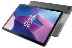
TAB M10 TB-128XU LNV-ZAAN0007TH