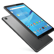
TAB M8 TB-8505X LNV-ZA5H0114TH (Grey)