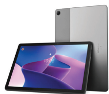
TAB M10 TB-328XU LNV-ZAAF0014TH