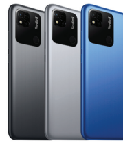
Redmi 10A (3/64)

XMI-6941059648413 (Granite Gray) XMI-6941059648390 (Peacock Green) XMI-6941059648406 (Sky Blue)