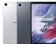
Samsung Tab A7 Lite (LTE)

SSG-PSMT225NZAATHL (Gray) SSG-PSMT225NZSATHL (Silver)