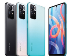
Redmi Note 11 (4/64)

XMI-6934177748479 (Chrome Silver) XMI-6934177748486 (Aurora Green) XMI-6934177748509 (Nighttime Blue) XMI-6934177748523 (Graphite Gray)