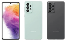
Samsung Galaxy A73 5G 8/128 GB

SSG-PSMA736BLGGHTL (Mint) SSG-PSMA736BZAGHTL (Gray)