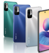
Redmi Note 10 5G (8/128)

XMI-6934177760914 (Sea Blue) XMI-6934177761102 (Sea Blue) XMI-6934177760990 (Pebble White) XMI-6934177761058 (Pebble White) XMI-6934177760860 (Carbon Gray) XMI-6934177761133 (Carbon Gray)