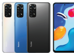
Redmi Note 11S (6/128)

XMI-6934177771378 (Graphite Gray) XMI-6934177771385 (Pearl White) XMI-6934177771323 (Twilight Blue)