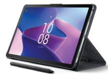
TAB M10 TB-128XU LNV-ZAAN0114TH