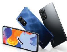
Redmi Note 11 Pro 5G (8/128)

XMI-6934177770616 (Atlantic Blue) XMI-6934177770852 (Graphite Gray) XMI-6934177770289 (Polar White) XMI-6934177770395 (Polar White) XMI-6934177770579 (Atlantic Blue) XMI-6934177770746 (Graphite Gray)