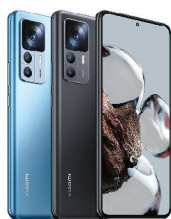
Xiaomi 12T (8+256)

XMI-6941812708422 (Black) XMI-6941812708446 (Blue)