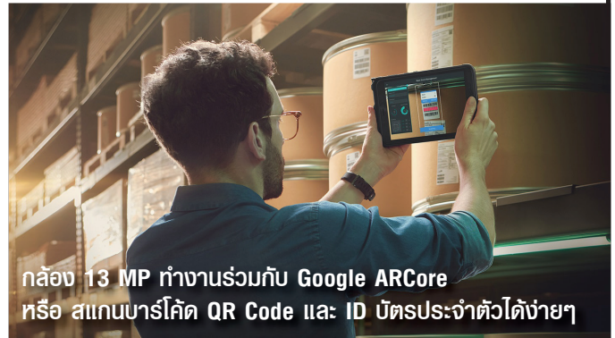
กล้อง 13 MP ทำงานร่วมกับ Google ARCore หรือ สแกนบาร์โค้ด QR Code และ ID บัตรประจำตัวได้ง่ายๆ