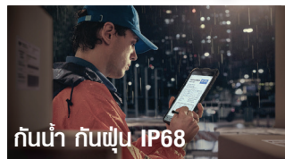
กันน้ำ กันฝุ่น IP68