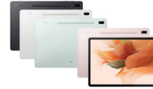
Samsung Tab S7 FE (WIFI)

SSG-PSMT733NLGATHL (Green) SSG-PSMT733NLIATHL (Pink) SSG-PSMT733NZSATHL (Silver) SSG-PSMT733NZKATHL (Black)