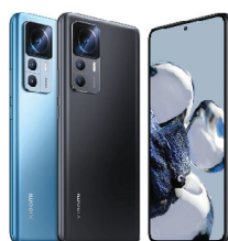
Xiaomi 12T Pro (12+256)

XMI-6934177797545 (Black) XMI-6934177797811 (Blue)