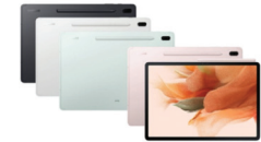
Samsung Tab S7 FE (LTE)

SSG-PSMT735NLGATHL (Green) SSG-PSMT735NLIATHL (Pink) SSG-PSMT735NZSATHL (Silver) SSG-PSMT735NZKATHL (Black)