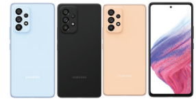
Samsung Galaxy A53 5G (8/128GB)

SSG-PSMA536ELBGHTL (Blue) SSG-PSMA536EZKGHTL (Black) SSG-PSMA536EZOGHTL (Peach)