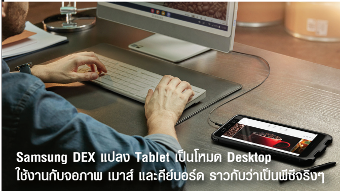
Samsung DEX แปลง Tablet เป็นโหมด Desktop ใช้งานกับจอภาพ เม้าส์ และคีย์บอร์ด ราวกับว่าเป็นพีซีจริงๆ

Galaxy Tab Active 3 แท็บเล็ตสุดอึด!! กันน้ำกันฝุ่น กันกระแทกได้ถึง 1.5 เมตร มีโหมด No Battery สลับไปใช้พลังงานจากแหล่งจ่ายไฟตรง โดยไม่ผ่านแบตเตอรี่ของตัวเครื่อง