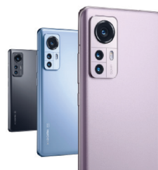
Xiaomi 12 (8+256)

XMI-6934177797545 (Black) XMI-6934177797811 (Blue)