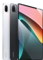
Mi Pad 5

XMI-6934177755668 (Cosmic Gray) XMI-6934177755675 (Pearl White)