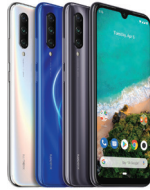
Mi A3 (64)

XMI-6941059620082 (BLK) XMI-6941059620105 (BLU)