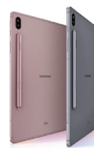
SM-T865NZAATHL 6GB/128GB SSG-SM-T865NZAATHL (GRAY) SSG-SM-T865NZNATHL (ROSE BLUSH)