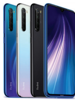
Note 8 (64)

XMI-6941059630869 (WHT) XMI-6941059630876 (BLK) XMI-6941059630883 (BLU)