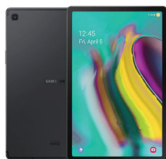
SM-T725NZKATHL (Tab S5e 10.5") SSG-PSMT725NZKATHL (BLACK)