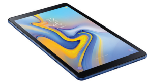
SM-T595NZKATHL (Tab A10.5") SSG-PSMT595NZKATHL (BLACK)