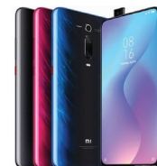
Mi 9T Pro (128)

XMI-6941059628163 (BLK) XMI-6941059628156 (BLU)