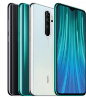
Note 8 Pro (64)

XMI-6941059635574 (WHT) XMI-6941059635598 (BLK) XMI-6941059635581 (BLU)