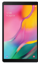
SM-T510 (Wi-Fi) B2B SSG-PSMT510NZKDTHL (BLACK)