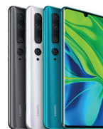
Mi Note 10 (128)

XMI-6941059629641 (WHT) XMI-6941059629658 (GRN) XMI-6941059629665 (GRAY)