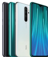
Note 8 Pro (128)

XMI-6941059629641 (WHT) XMI-6941059629658 (GRN) XMI-6941059629665 (GRAY)