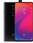
Mi 9T (64)

XMI-6941059626374 (GLY) XMI-6941059626367 (BLU) XMI-6941059626350 (WHT)