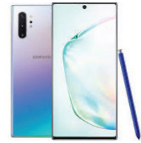
SM-N975 (Note10+ 12GB 256GB)

SSG-SM-N970FZKDTL (BLACK) SSG-SM-N970FZIDTHL (PINK) SSG-SM-N970FZSDTHL (GLOW)