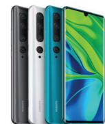
Mi Note 10 Pro (256)

XMI-6941059634386 (BLK) XMI-6941059634393 (WHT) XMI-6941059634409 (GRN)