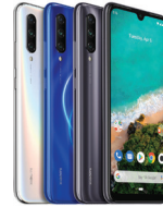
Mi A3 (128)

XMI-6941059626381 (WHT) XMI-6941059626404 (GLY) XMI-6941059626398 (BLU)