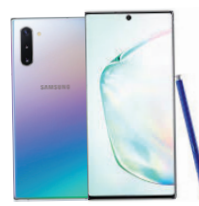
SM-N970 (Note10 8GB 256GB)

SSG-SM-G975FZGDTHL (GREEN) SSG-SM-G975FZKDTL (BLACK) SSG-SM-G975FZWDTHL (WHITE)