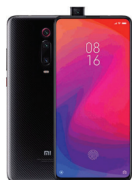
Mi 9T (128)

XMI-6941059624608 (BLK) XMI-6941059624592 (Blue)