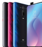
Mi 9T Pro (64)

XMI-6941059624608 (BLK) XMI-6941059624592 (Blue)