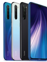
Note 8 (128)

XMI-6941059630869 (WHT) XMI-6941059630876 (BLK) XMI-6941059630883 (BLU)