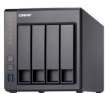
QNAP รุ่นใหม่ HDD