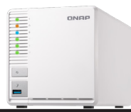
QNAP NAS 3 Bay รุ่นใหม่!!