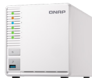
QNAP NAS 3 Bay รุ่นใหม่!!